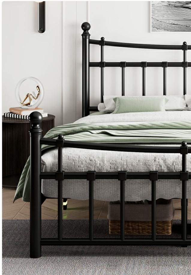
Figure 3: Protective covers at the bed's sharp corners help prevent accidental injury.