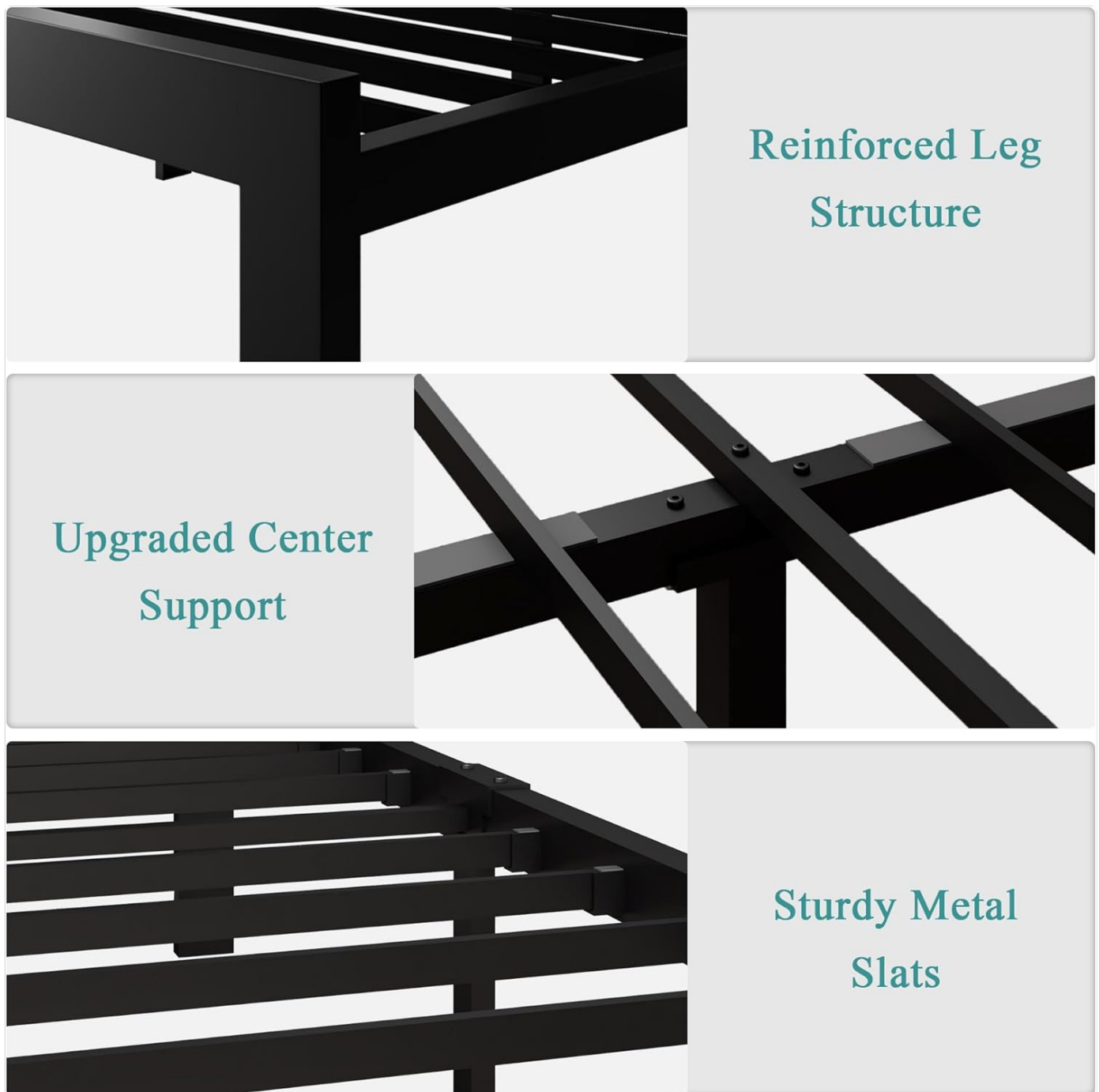
Figure 4: Exploded view showing the main components of the bed frame for assembly.