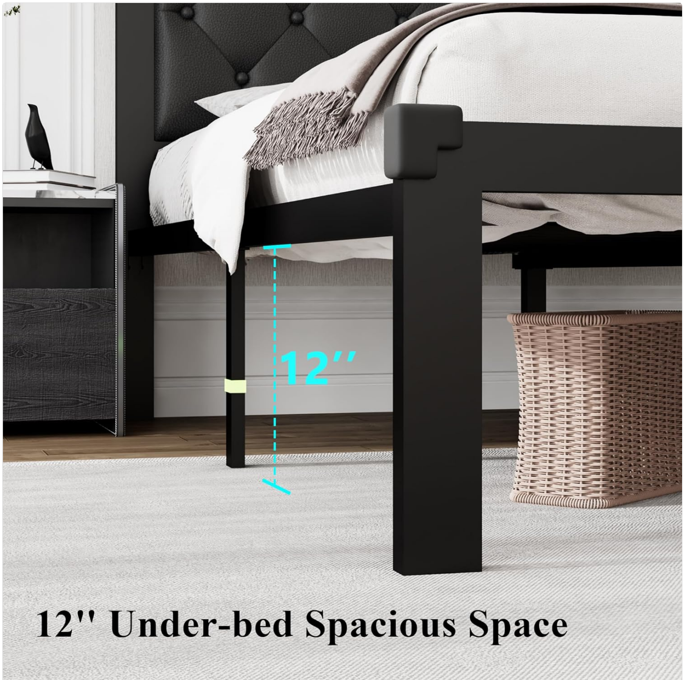
Figure 5: Illustration of the 12-inch under-bed clearance for storage.