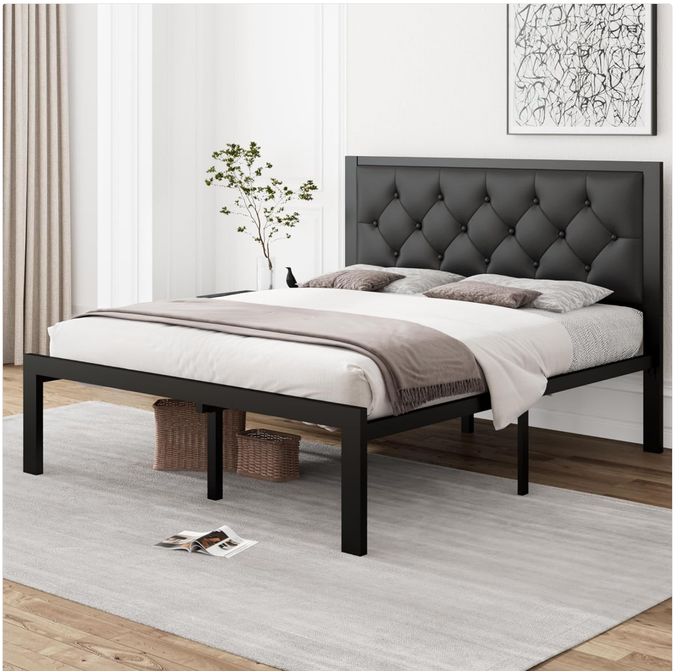
Figure 1: The iPormis Full Metal Bed Frame, showcasing its faux leather headboard and sturdy metal construction.