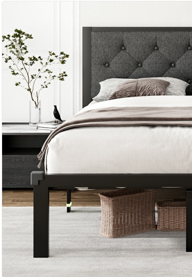
Figure 2: Luminescent strips on the middle legs aid in visibility in the dark.