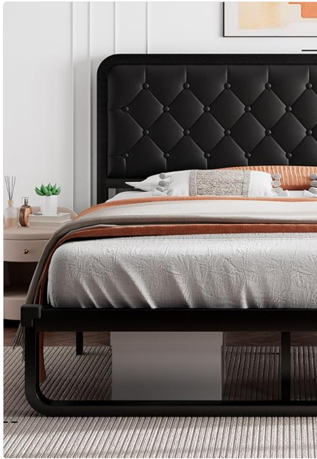
Figure 8: The high-end faux leather material of the headboard is durable and easy to maintain.