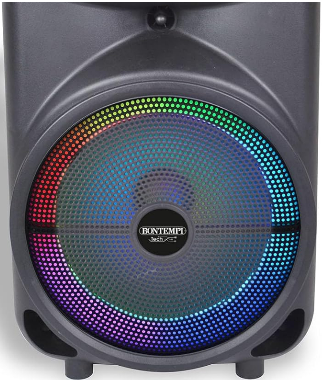
Image 1.1: Front view of the Bontempi TrolleySync Karaoke Amplifier, showcasing its integrated LED lights and included wireless microphones.