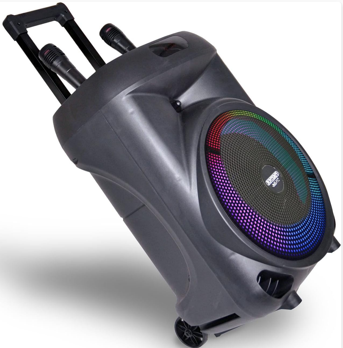
Image 4.2: The Bontempi TrolleySync tilted, illustrating its extendable handle and wheels, which facilitate easy transportation.

The TrolleySync is designed for easy transport, featuring an extendable handle and integrated wheels.