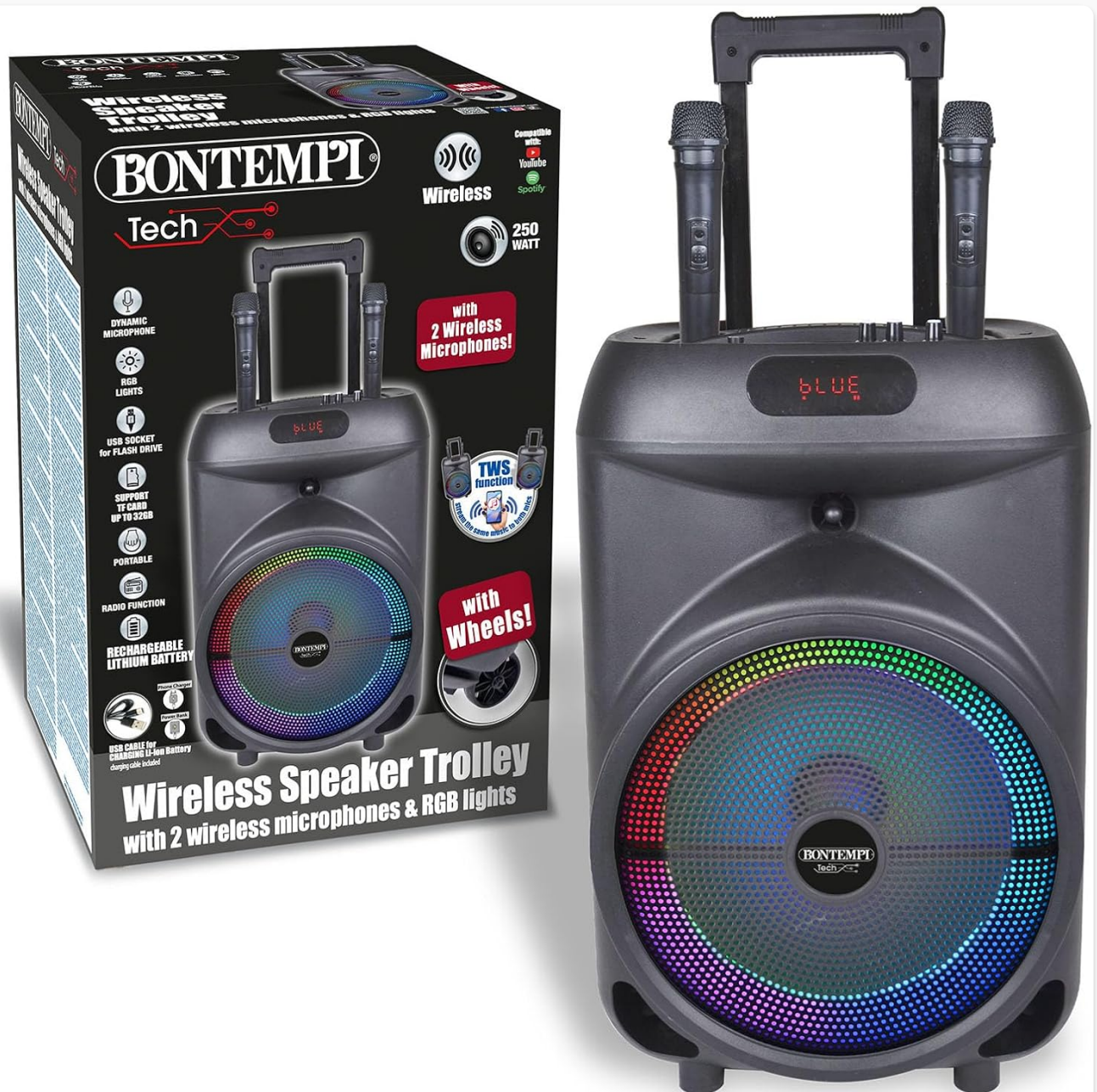
Image 3.1: The Bontempi TrolleySync Karaoke Amplifier shown within its retail packaging.