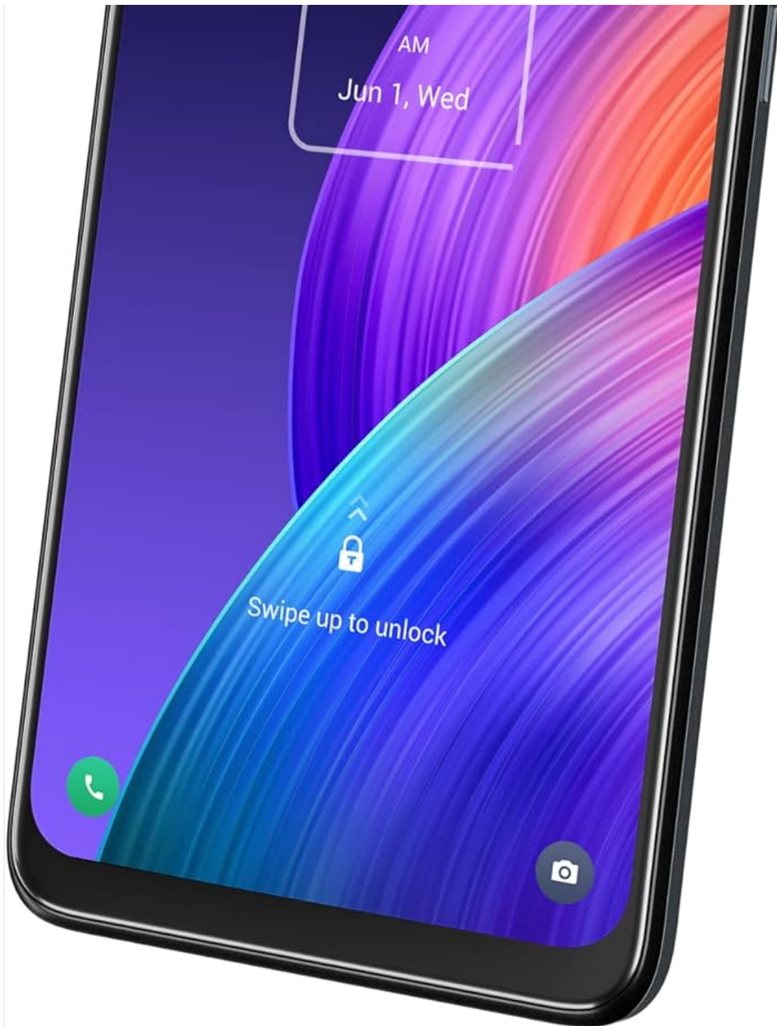
Image: Front view of the TCL 30XL smartphone, showcasing its large display and sleek design.