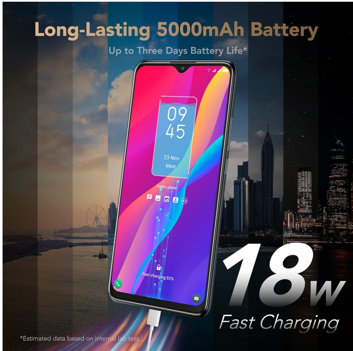
Image: The TCL 30XL connected to an 18W fast charger, illustrating its 5000mAh battery capacity.

Before first use, it is recommended to fully charge your TCL 30XL. Connect the included power adapter to the USB Type-C port at the bottom of the phone. The device supports 18W fast charging for quick power replenishment of its 5000mAh battery.