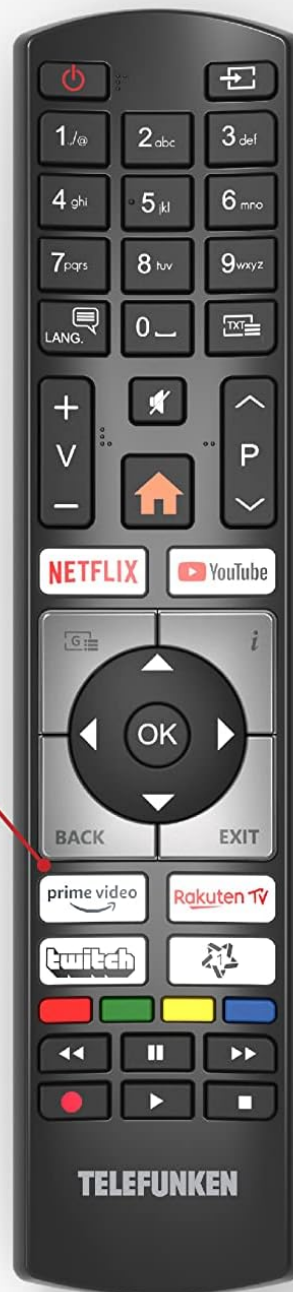
Figure 4: Remote control for the Smart TV, highlighting dedicated app buttons.