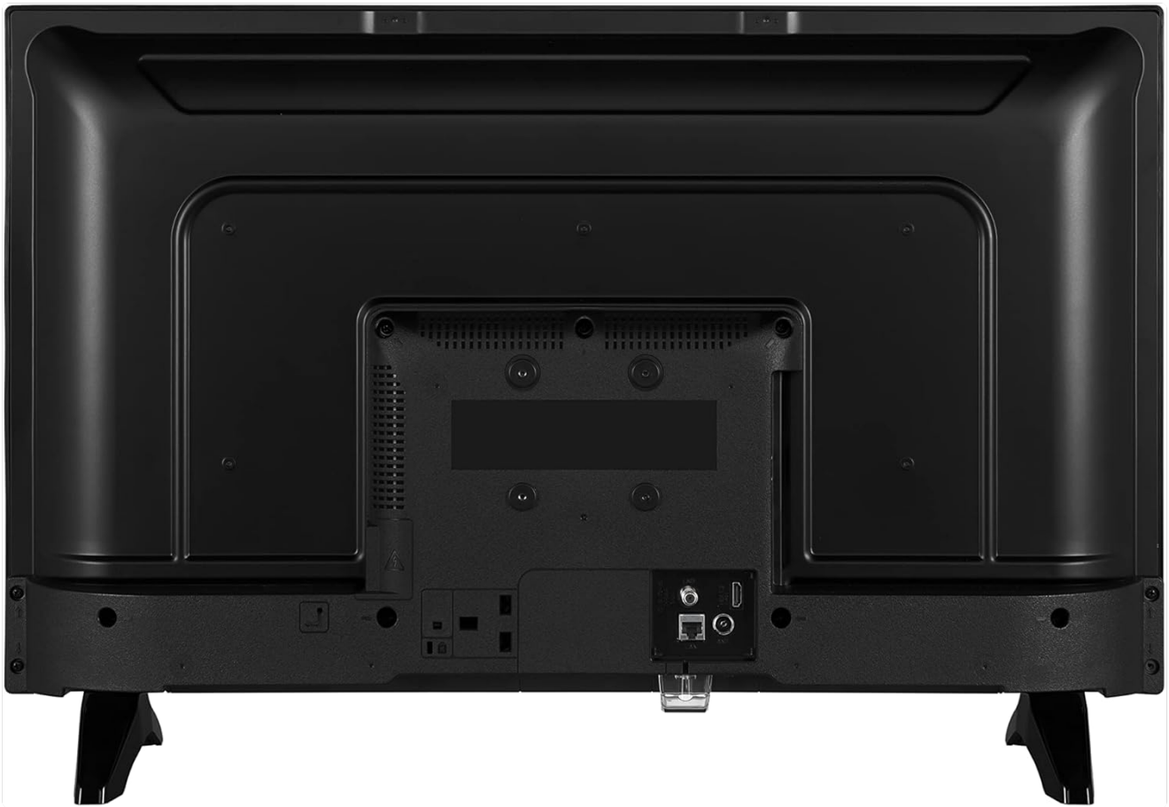
Figure 3: Rear view of the TV with connection ports.

After connecting all desired devices, plug the power cable into the TV and then into a wall outlet.