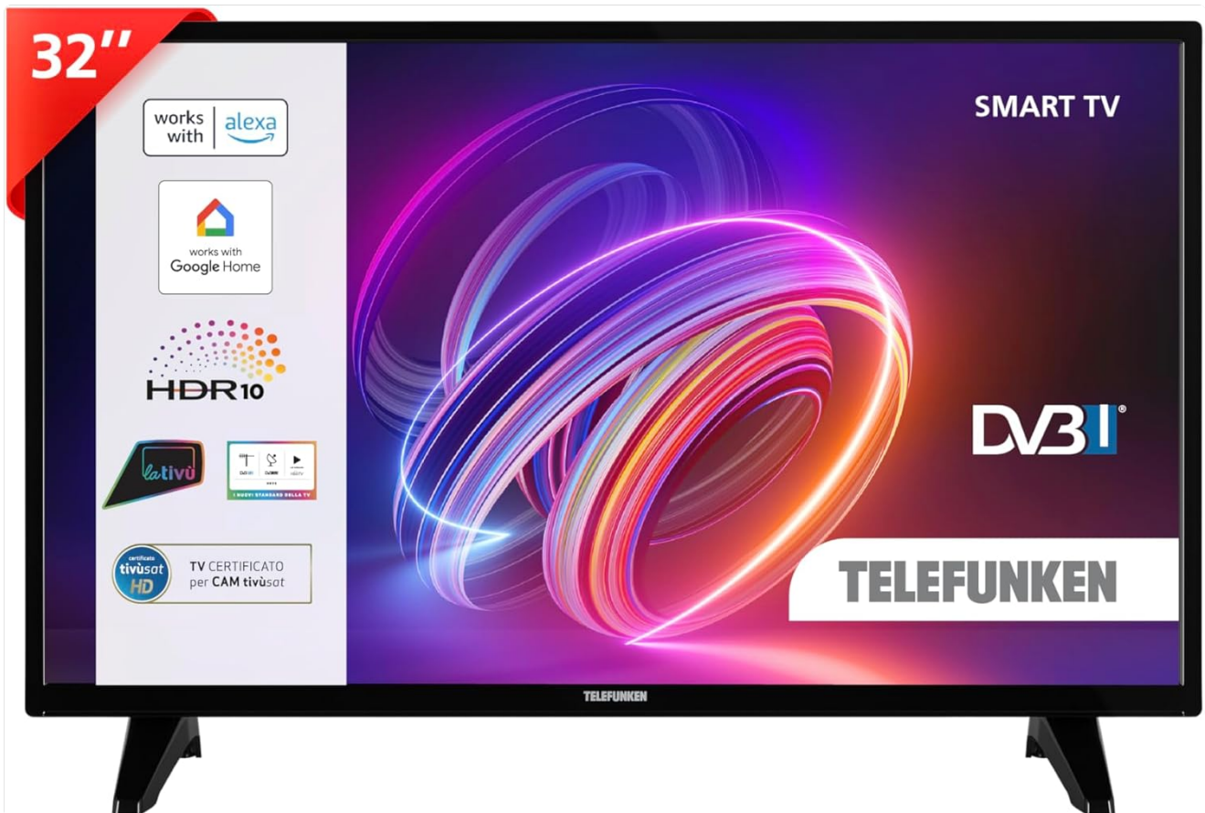
Figure 1: Front view of the TELEFUNKEN 32-inch Smart TV.