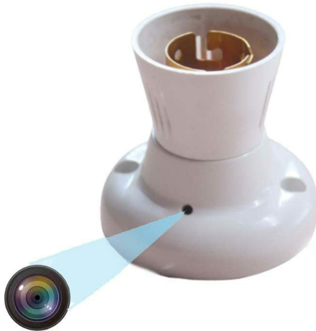
Figure 1.1: TECHNOVIEW Bulb Holder Camera. This image shows the overall design of the bulb holder with the discreetly integrated camera lens.