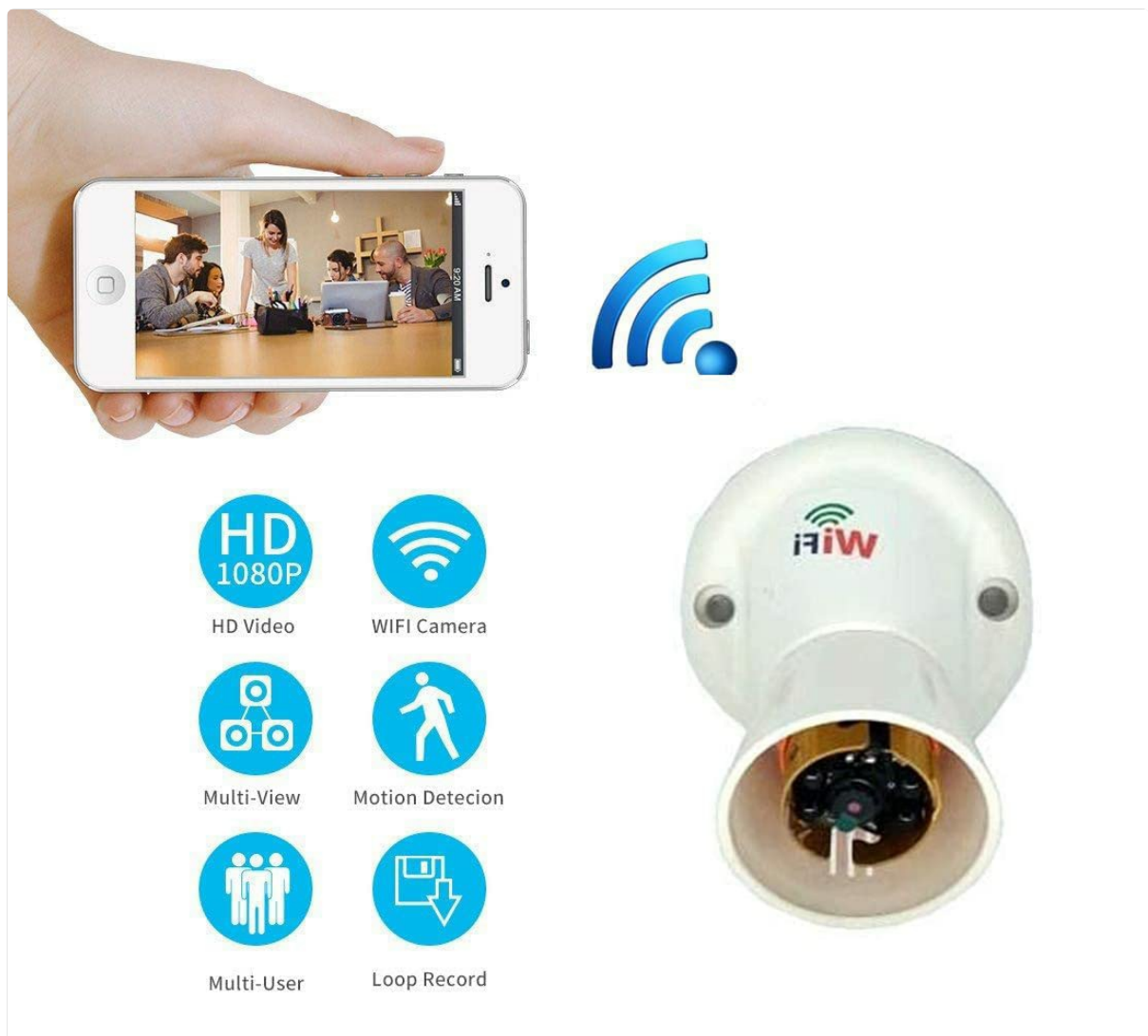
Figure 3.1: Remote viewing of the camera feed on a smartphone, accessible anytime, anywhere.