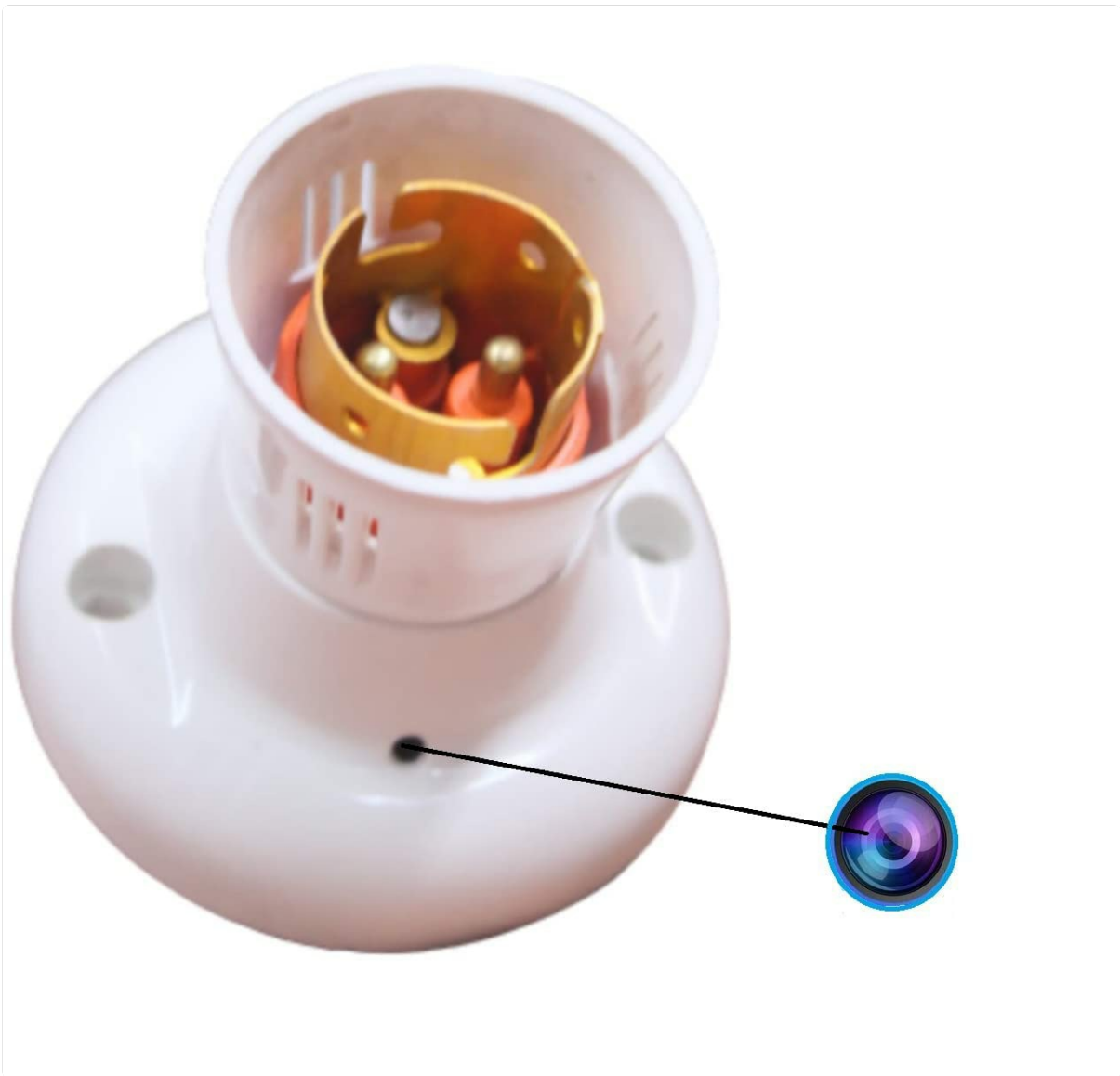
Figure 2.1: Close-up view of the camera lens on the bulb holder, indicating the discreet placement.