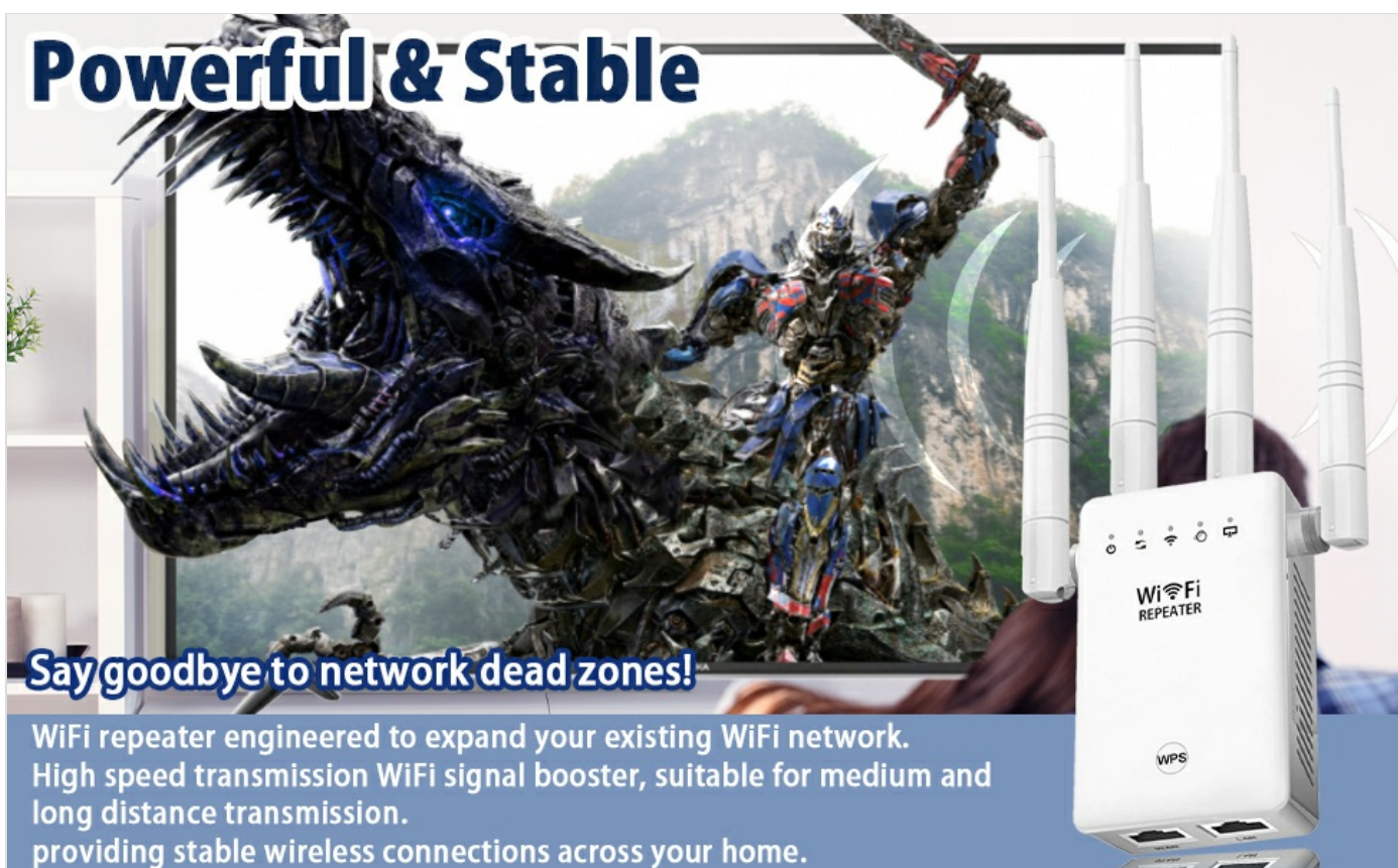
Figure 5: The WiFi Extender provides powerful and stable signal extension.