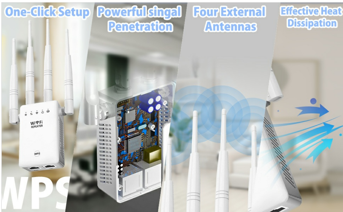
Figure 4: Key features of the WiFi Extender.