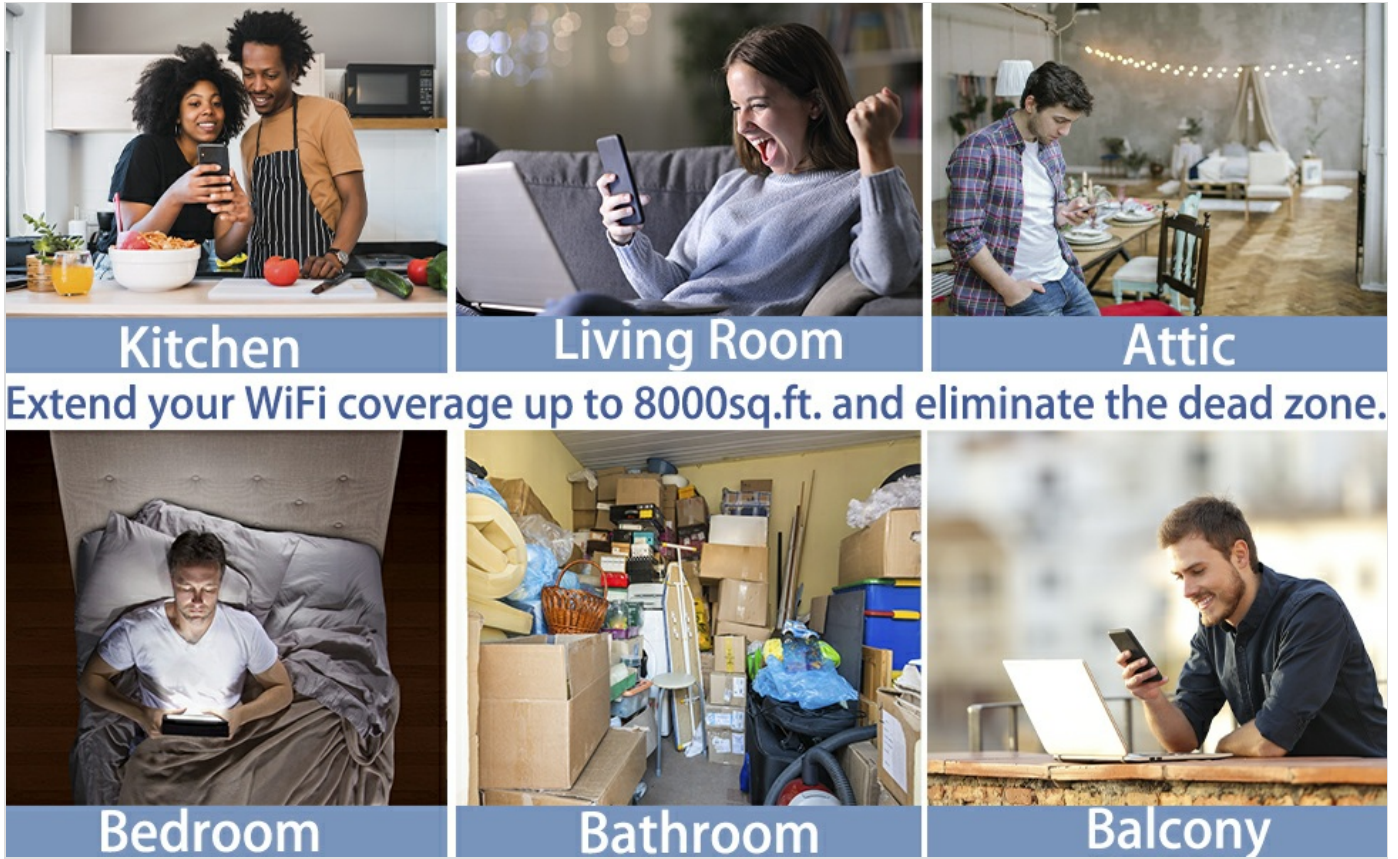
Figure 3: The WiFi Extender extends coverage to various areas of a home or office.

The SUPOOBE WiFi Extender is a versatile networking device designed to enhance your wireless coverage. It features four external antennas for improved signal penetration and effective heat dissipation for stable operation. It supports multiple operating modes including Repeater Mode, Access Point Mode, and WiFi Mesh functionality.