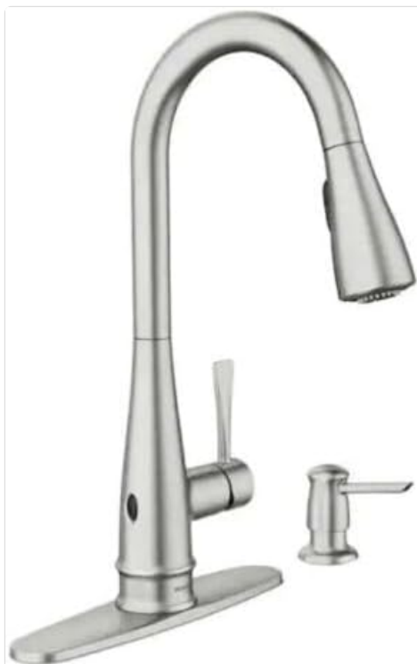
Image 1.1: Moen Birchfield Faucet with Soap Dispenser and Deck Plate.

Thank you for choosing the Moen Birchfield Single-Handle Pull-Down Sprayer Kitchen Faucet. This manual provides detailed instructions for the proper installation, operation, and maintenance of your new faucet. Please read this manual thoroughly before installation and retain it for future reference.