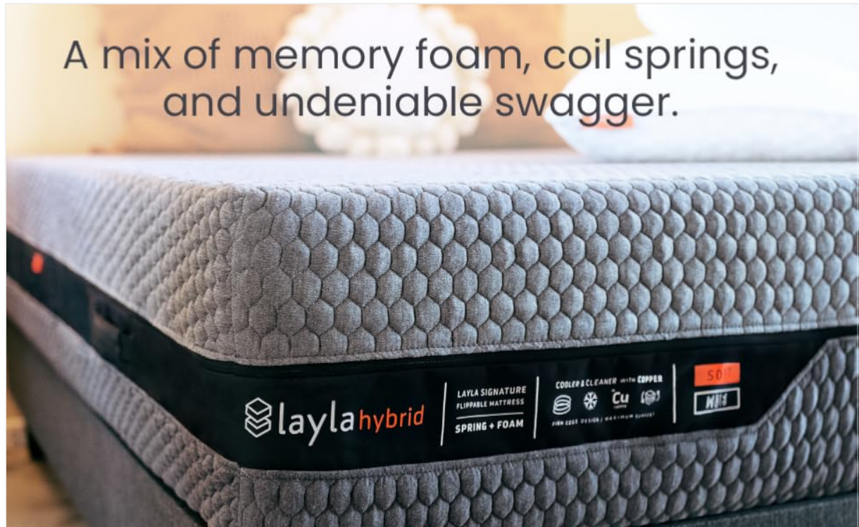
Image: Layla Hybrid Mattress expanding after unboxing.