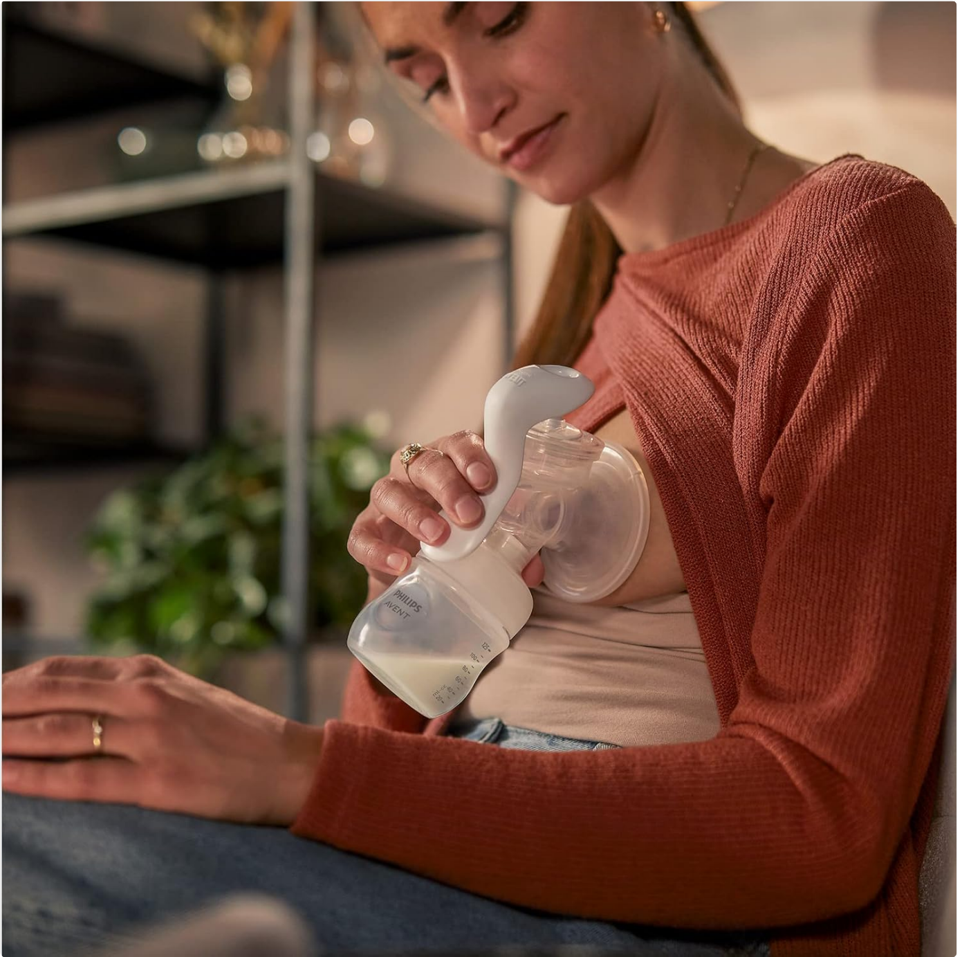
Figure 4: A user demonstrating the comfortable and upright pumping position enabled by the Philips Avent Manual Breast Pump's design.