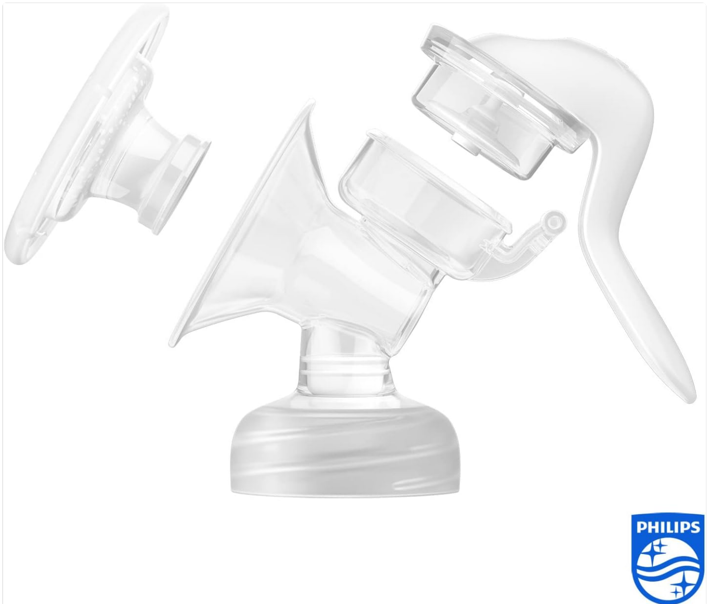
Figure 1: An exploded view of the Philips Avent Manual Breast Pump, illustrating its individual components for easy assembly and cleaning.

The Philips Avent Manual Breast Pump SCF430/01 consists of several key components designed for efficient and comfortable milk expression. Familiarize yourself with each part before assembly.