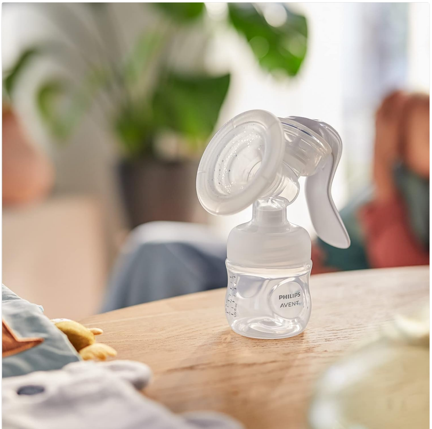
Figure 3: The fully assembled Philips Avent Manual Breast Pump, ready for use, placed on a wooden table.