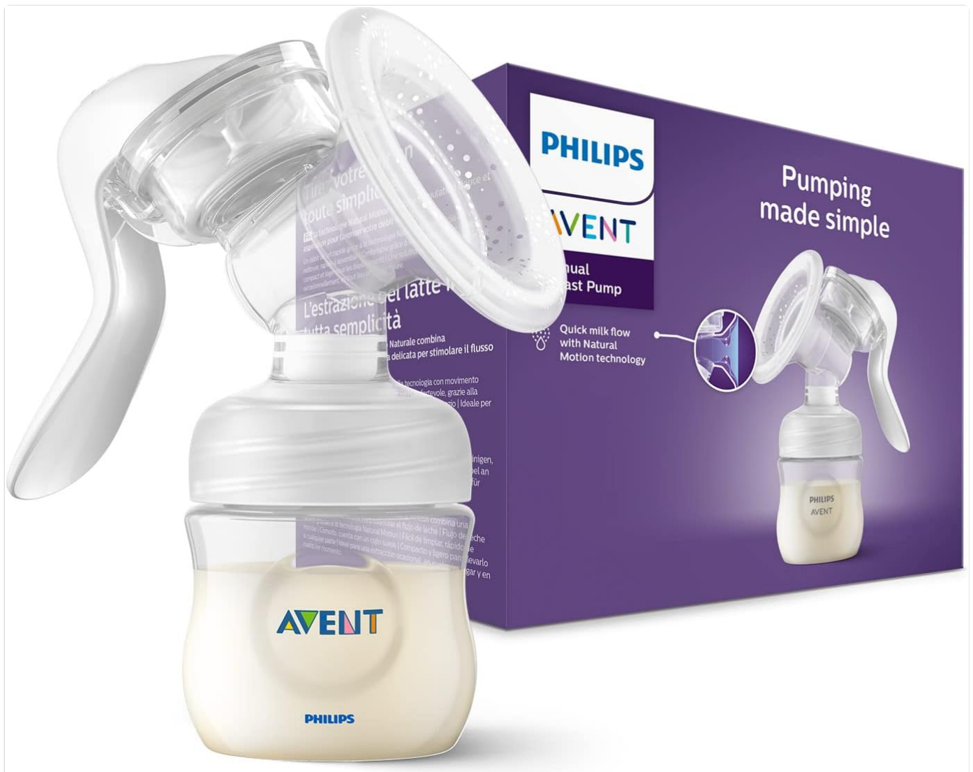
Figure 2: The Philips Avent Manual Breast Pump SCF430/01, shown here with its retail packaging, highlighting its compact design and ease of use.