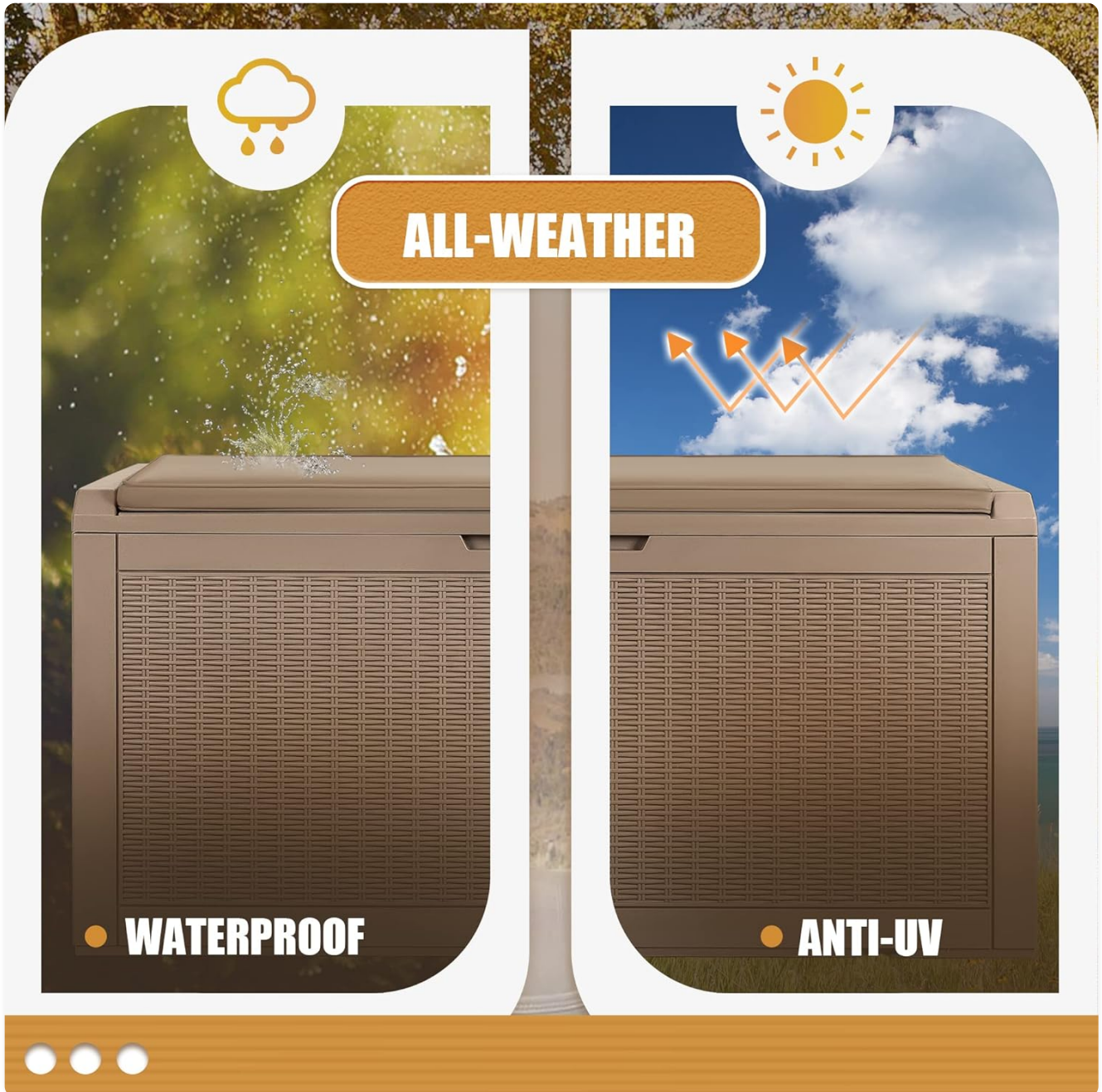
Image: Visual representation of the deck box's all-weather capabilities, highlighting its waterproof and anti-UV features.