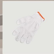
Glove* 1 pcs