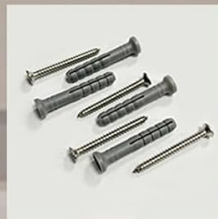
Screws* 4 sets