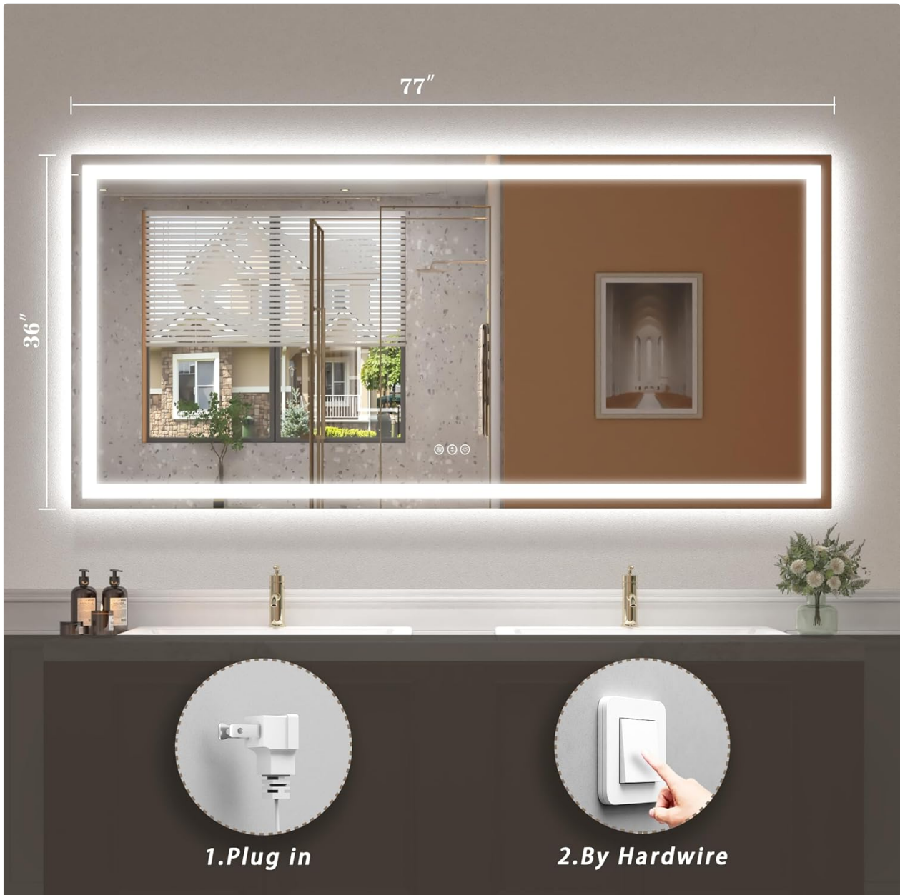
Image: Illustrates the mirror's dimensions and the two available power connection methods.