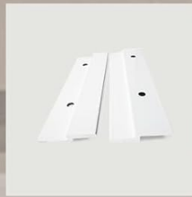
Bracket* 2 pcs