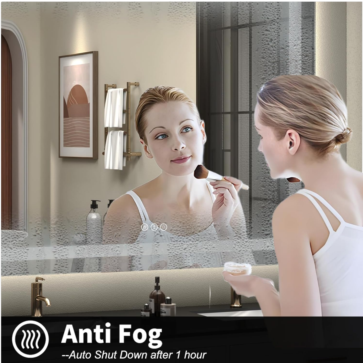
Image: Illustrates the anti-fog function keeping the mirror clear.

Your browser does not support the video tag.