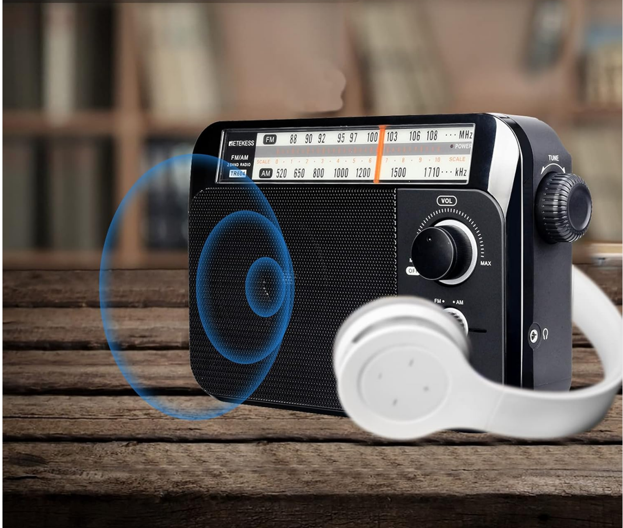
Image: The Reteless TR604 radio highlighting its 3.5-inch 2W speaker and a 3.5mm headphone jack for personal audio experience.