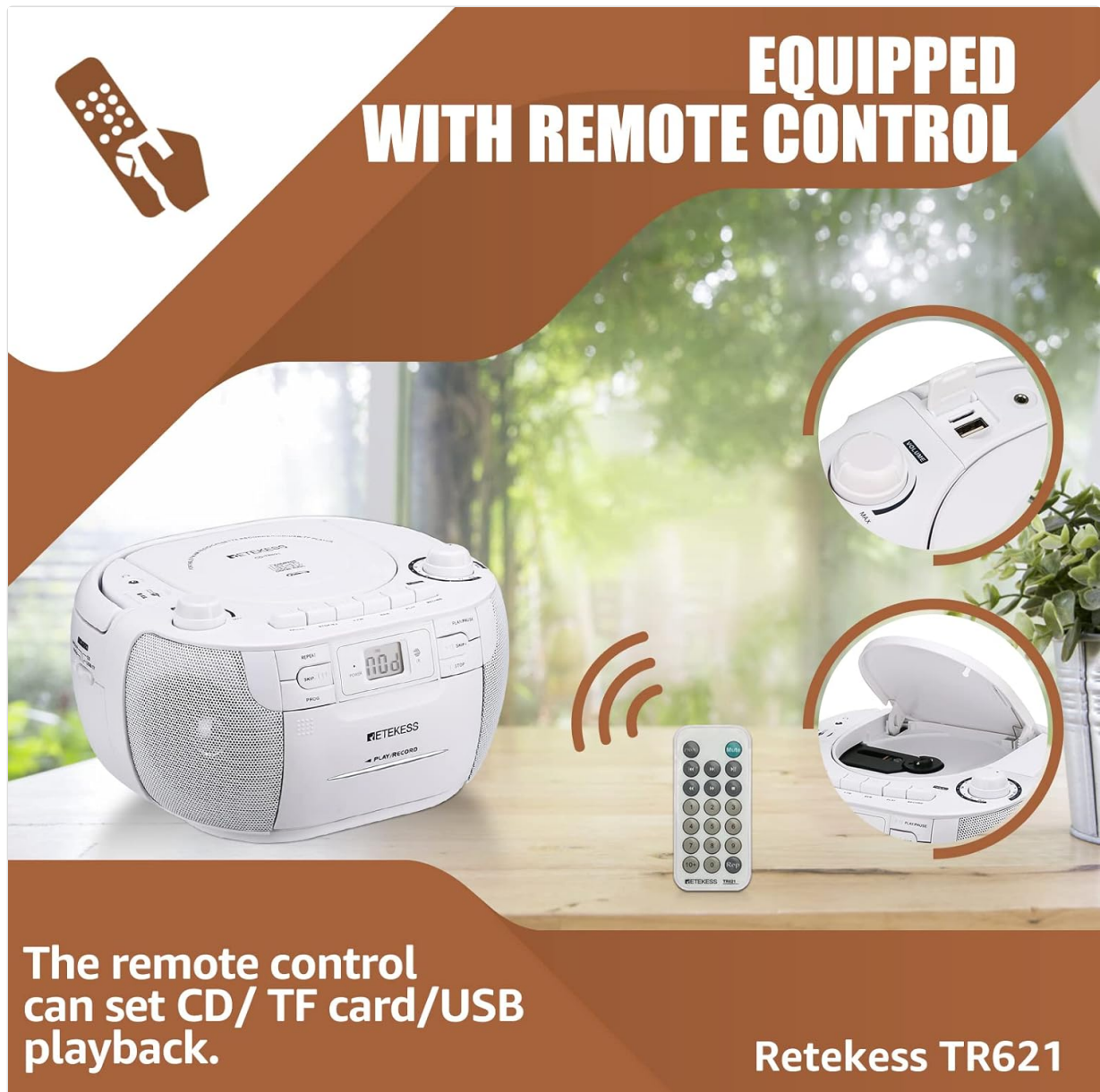
Image: The Reteless TR621 boombox shown with its remote control, indicating that the remote can manage CD, TF card, and USB playback.