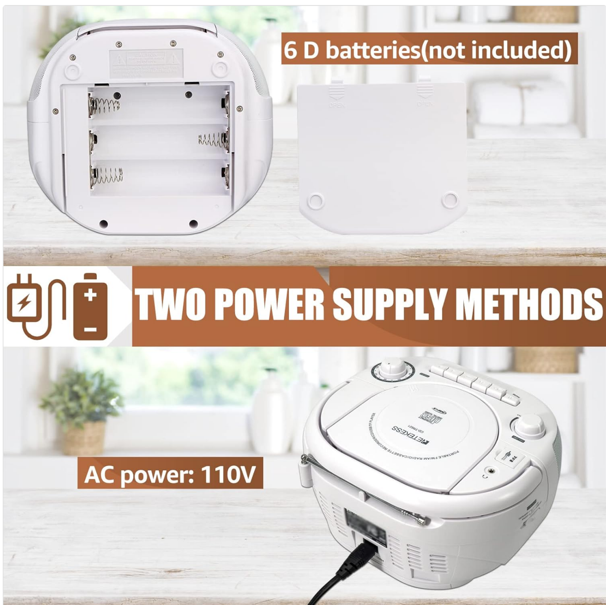
Image: The Reteless TR621 unit displaying its battery compartment for 6 D-cell batteries and the AC power input for 110V operation.