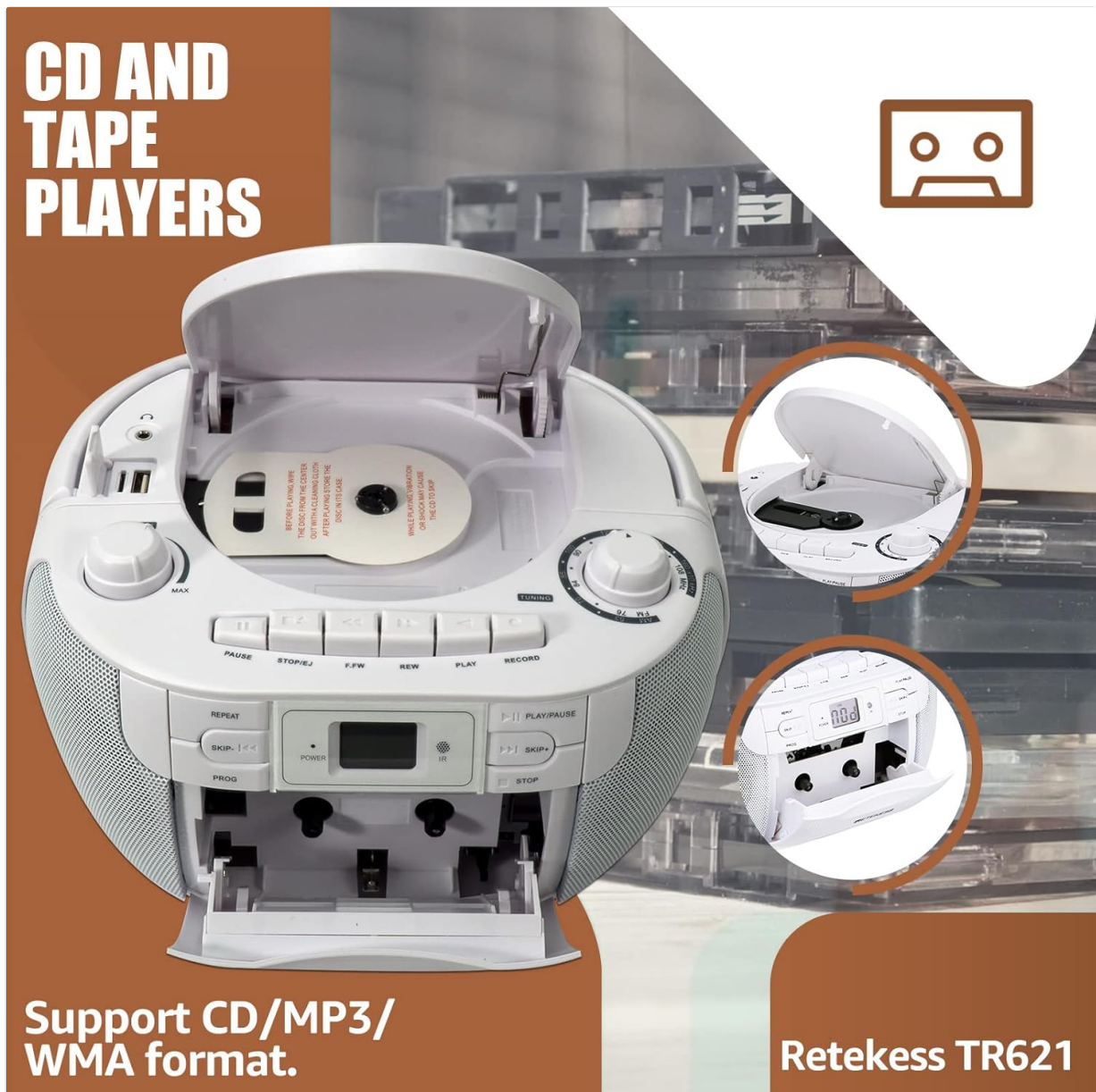
Image: The Reteless TR621 boombox with its top-loading CD player and front-loading cassette deck open, highlighting its multi-format playback capabilities.