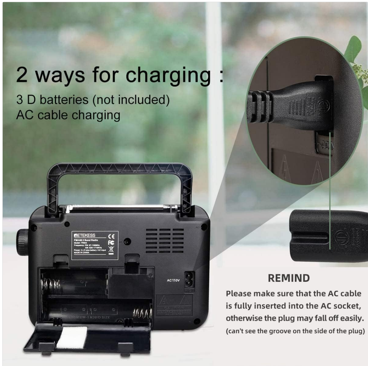
Image: The back of the Reteless TR604 unit, illustrating the battery compartment for 3 D-cell batteries and the AC power cable connection point.