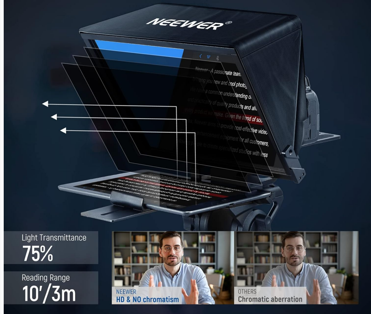
Image 4.3: Illustration of the clear beam splitter technology, demonstrating its high light transmittance and effective reading range.

14" clear beam splitter makes sure the script is easy to read.