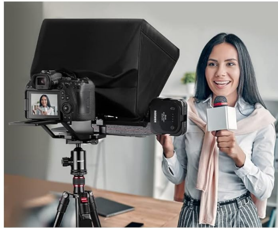
Image 4.1: Overview of the NEEWER Teleprompter App and the RT-110 remote control, detailing button functions for script management.