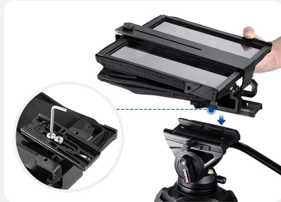
Step 2 Mount it on a tripod.