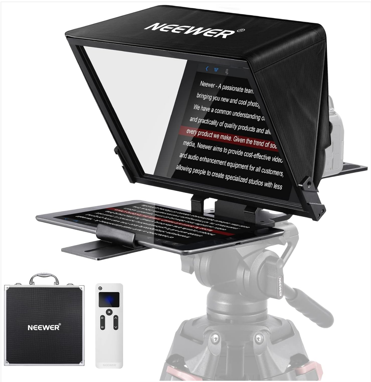
Image 1.1: The NEEWER Teleprompter X14 PRO, including the RT-110 remote control and aluminum carrying case.