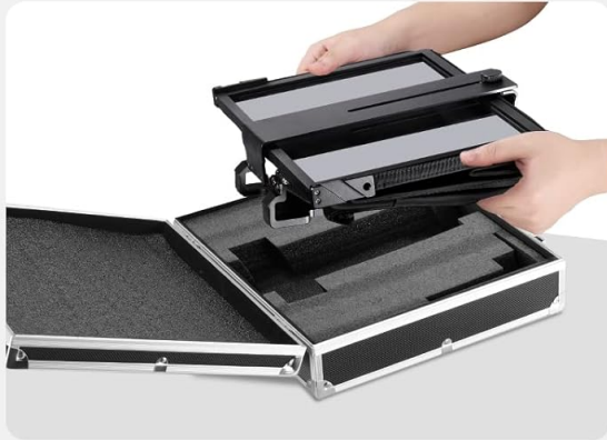
Step 1 Take it out of the box.

X14 Pro features an all in one structure that requires no assembly at all.