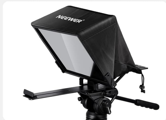
Step 4 Finished.

Image 3.3: Illustration of the cold shoe mounts and 1/4" threads on the teleprompter, designed for attaching external gear like microphones and LED lights.