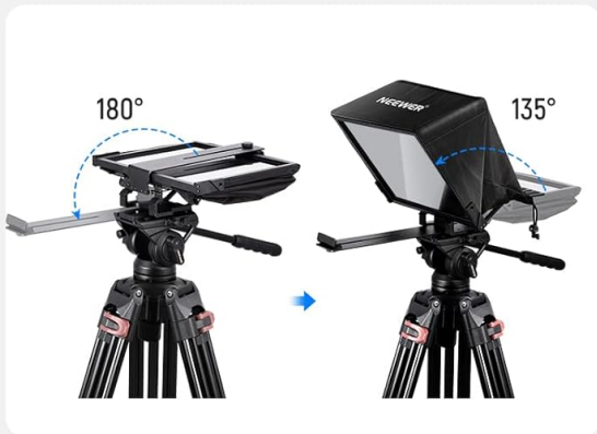
Step 3 Unfold the camera hood.