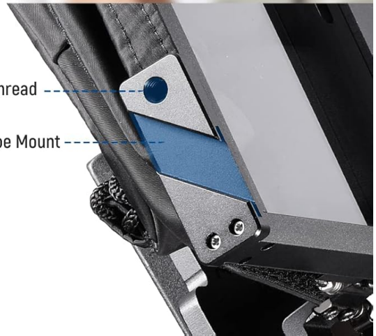
Image 3.2: Detail of the teleprompter's base, highlighting the 1/4" and 3/8" threads for tripod mounting.