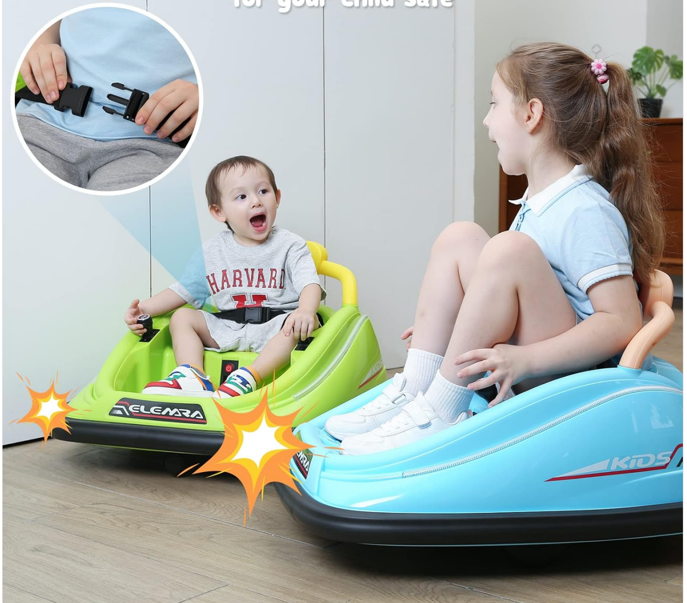
Image: A child fastening the safety belt inside the bumper car, emphasizing the importance of safety before operation.