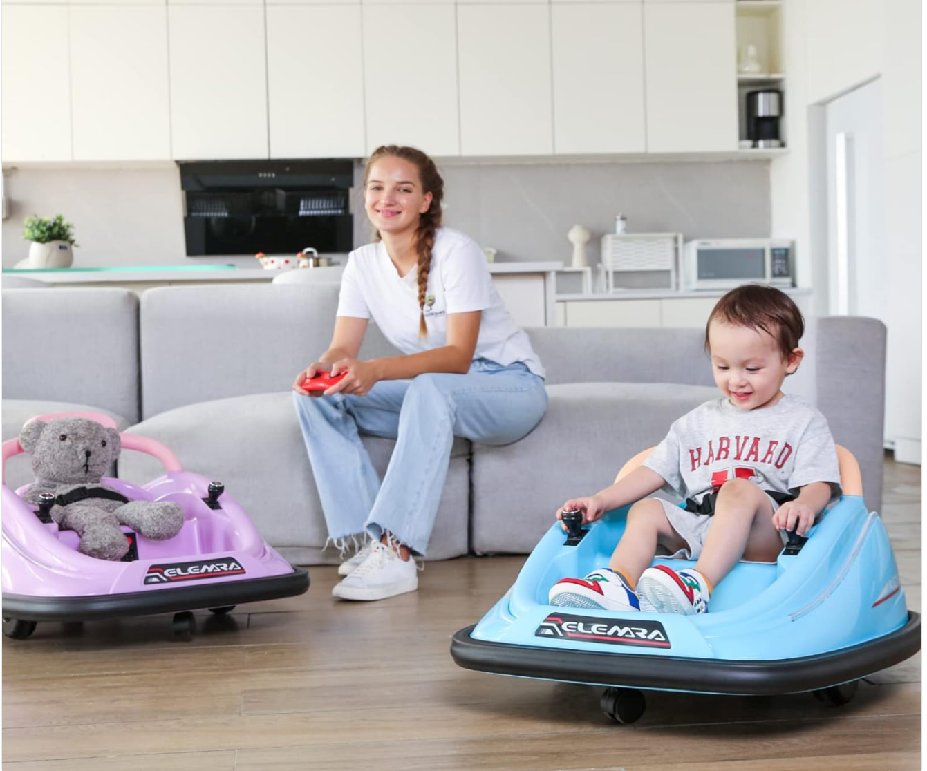
Image: Two ELEMARA bumper cars, one blue and one pink, showcasing their design and LED lights.