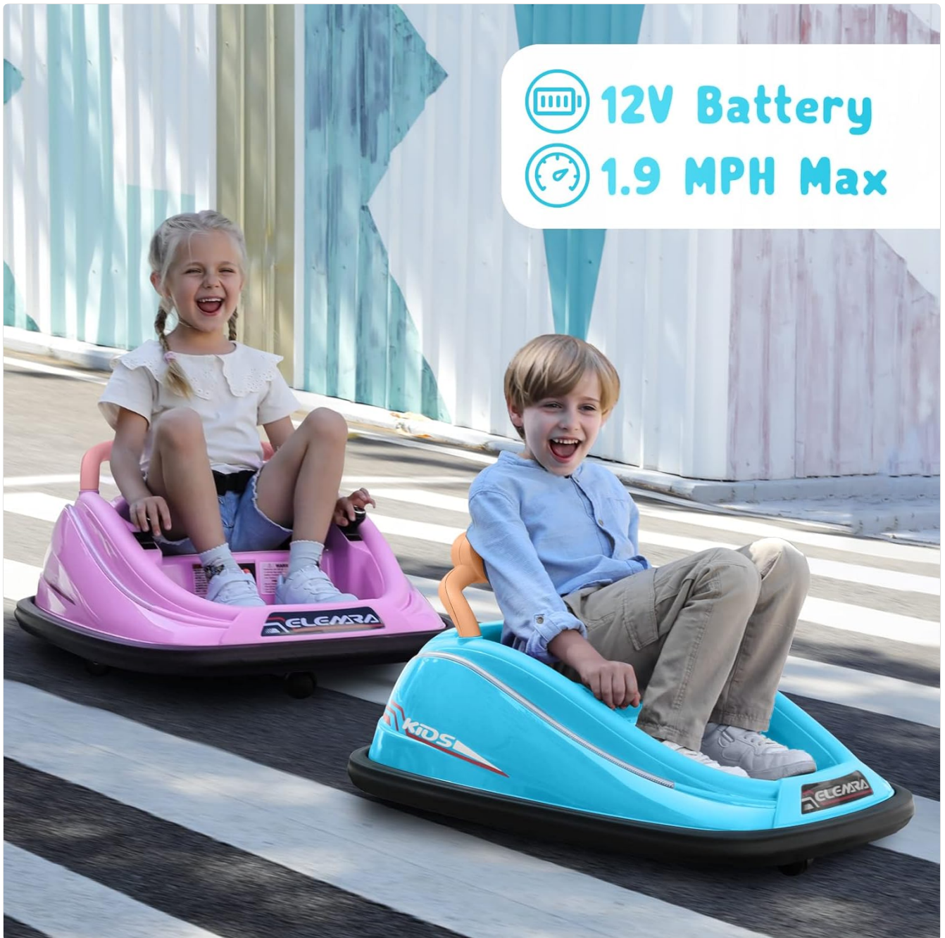
Image: Two children happily riding bumper cars, with graphics highlighting the 12V battery and 1.9 MPH maximum speed.

Your browser does not support the video tag.