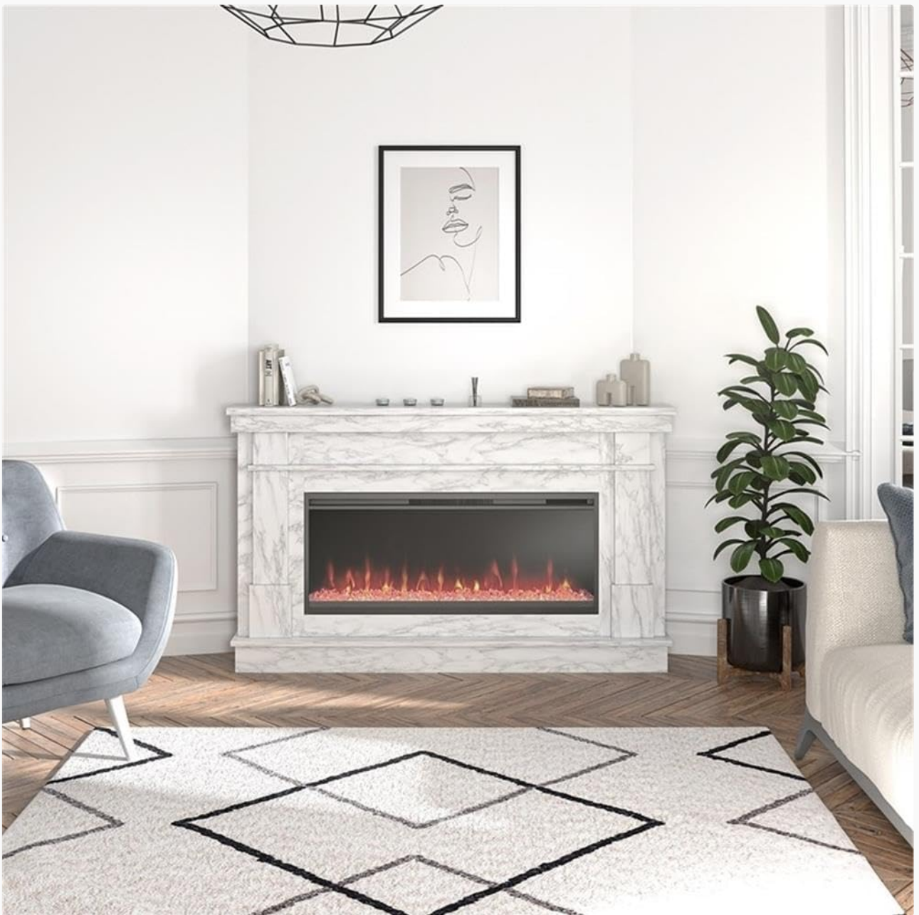
The electric fireplace integrated into a modern living room setting, showcasing its aesthetic appeal.