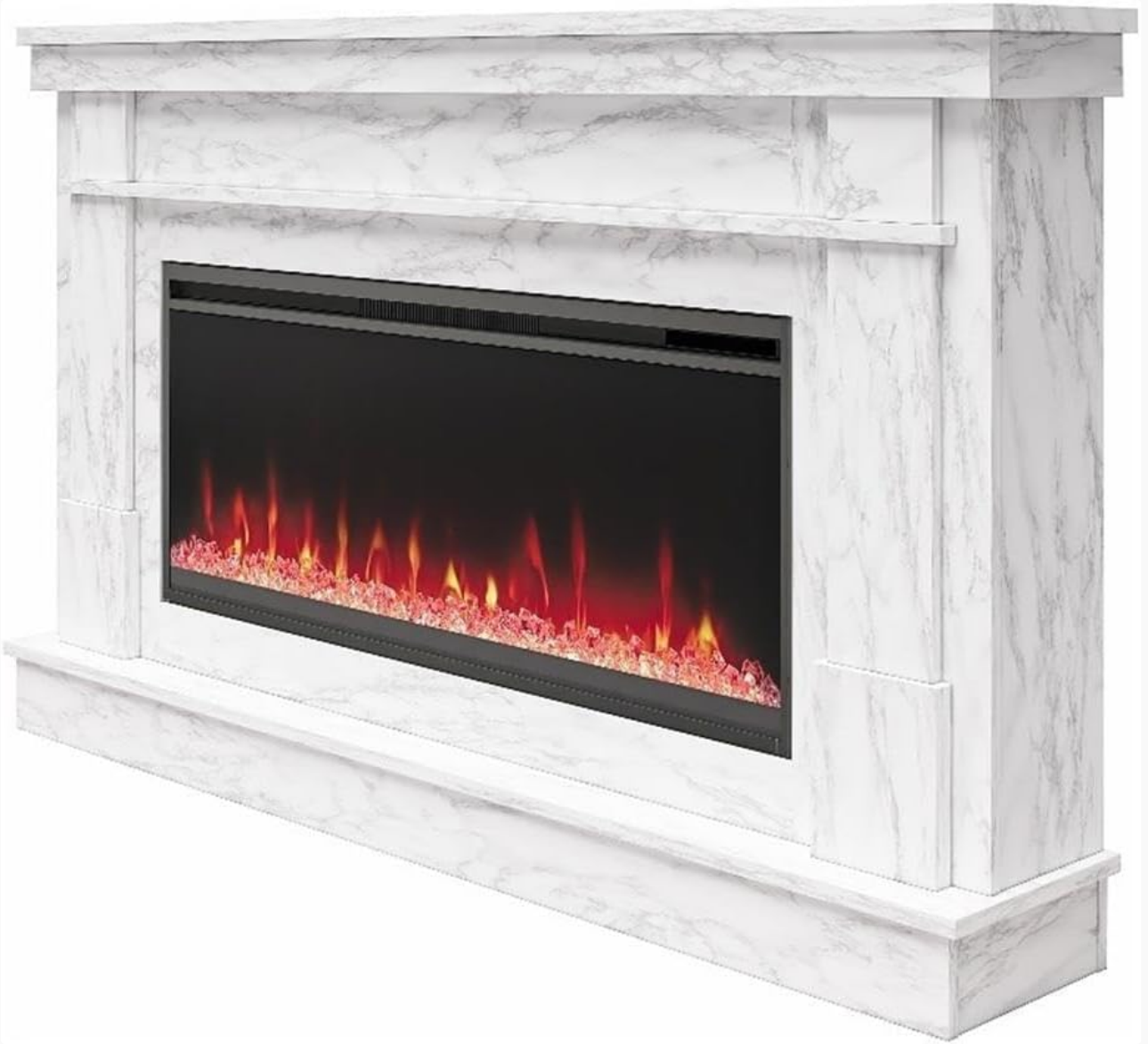
Front view of the Novogratz Waverly Electric Fireplace in White Marble finish.