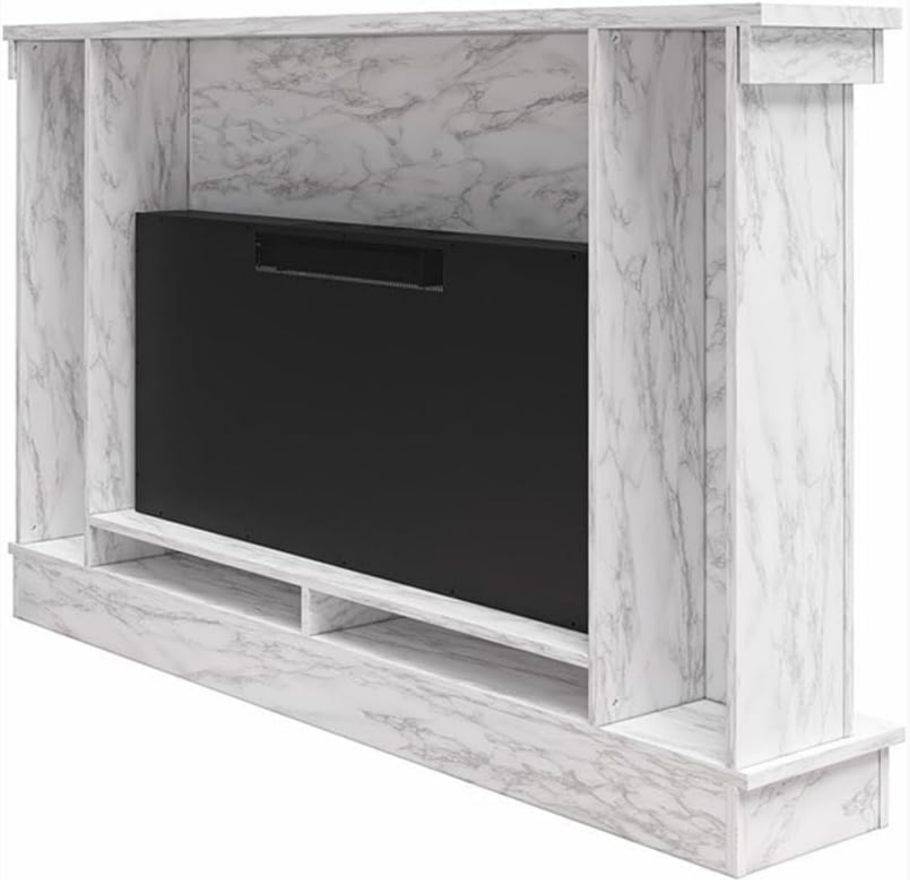
Rear view of the fireplace insert, showing the ventilation and connection points.