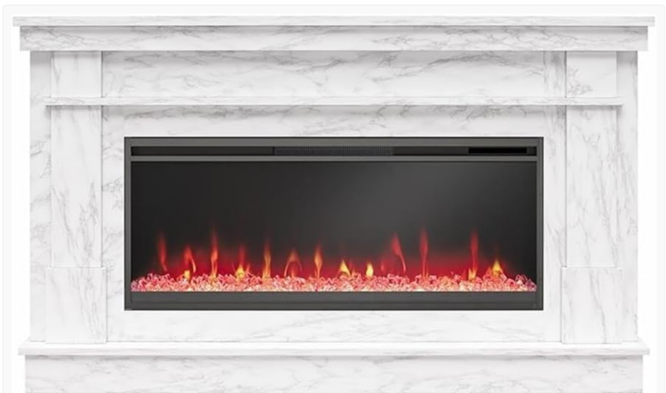
A detailed view of the electric fireplace insert, highlighting the crystal ember bed and realistic flame effect.