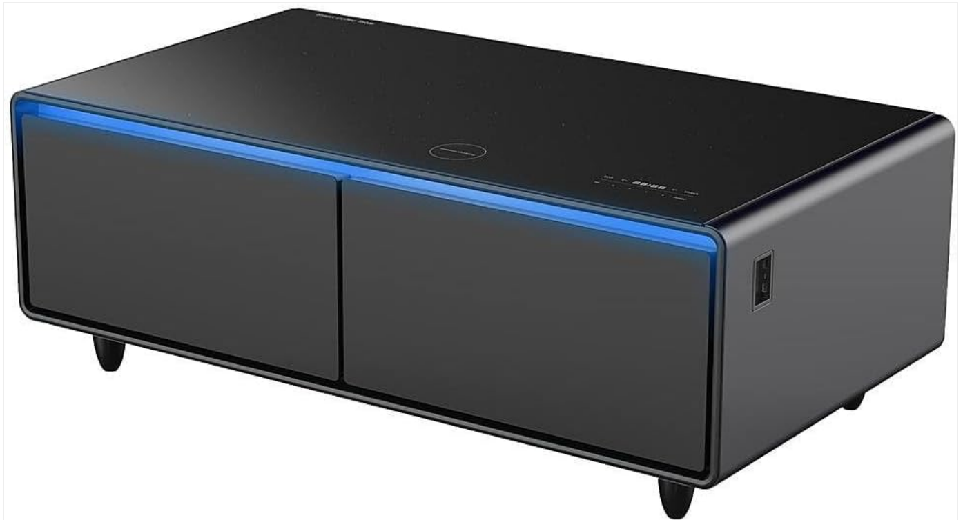
Figure 5: The smart refrigerator coffee table with its blue accent lighting activated, indicating the aesthetic feature of the device.