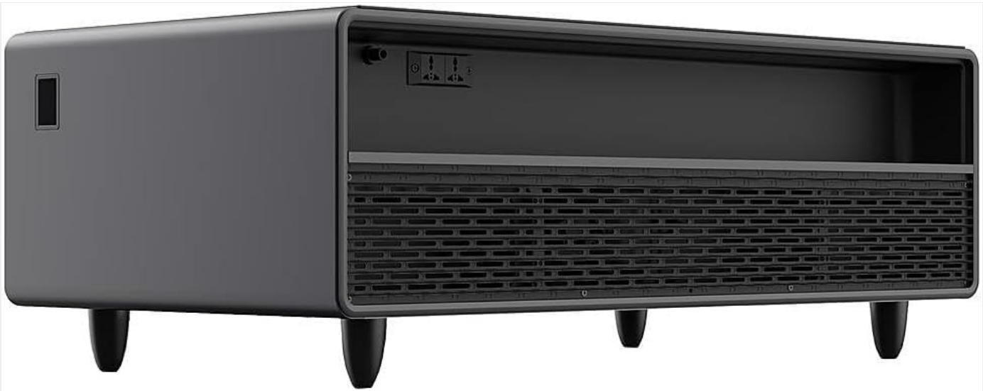
Figure 7: Side panel of the smart refrigerator coffee table, highlighting the accessible USB ports and 110V power outlets.