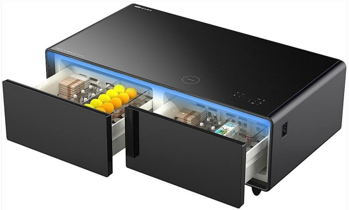
Figure 1: Front view of the Soundstream Smart Refrigerator Coffee Table with both refrigerated drawers open, displaying beverages and snacks.