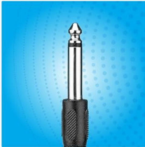
Image: A detailed view of the 1/4-inch auxiliary plug, which connects to your audio system's input.