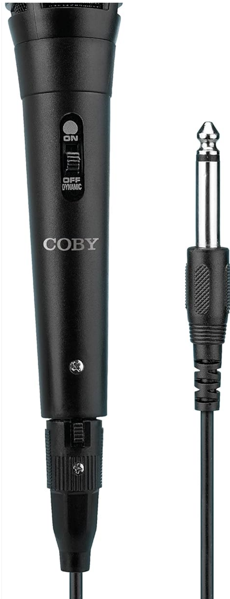
Image: The Coby Dynamic Vocal Wired Microphone shown alongside its included 10-foot detachable audio cable with a 1/4" auxiliary plug.