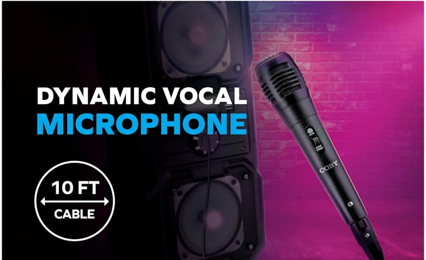
Image: A visual representation highlighting the microphone's on/off switch, 1/4" Aux input, and the easy-release button for the detachable cable.