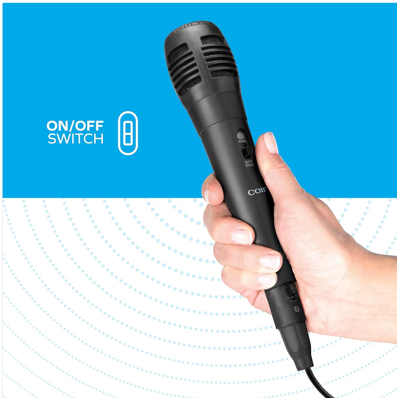
Image: A hand demonstrating the location of the easy-to-use ON/OFF switch on the microphone body.