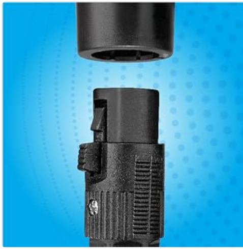
Image: A close-up view demonstrating the connection point for the detachable 10-foot cable to the microphone body.