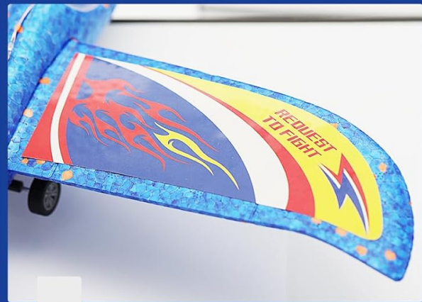
2 Paste The Stickers