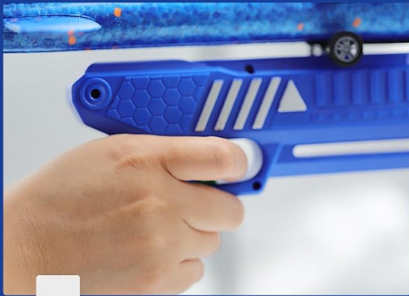
4 Launch The Airplane

Image: Easy to Install & Launch - Visual steps for inserting the wing, applying stickers, loading the launcher, and launching the airplane.