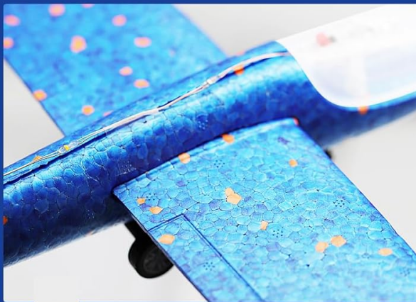
1 Insert The Wing