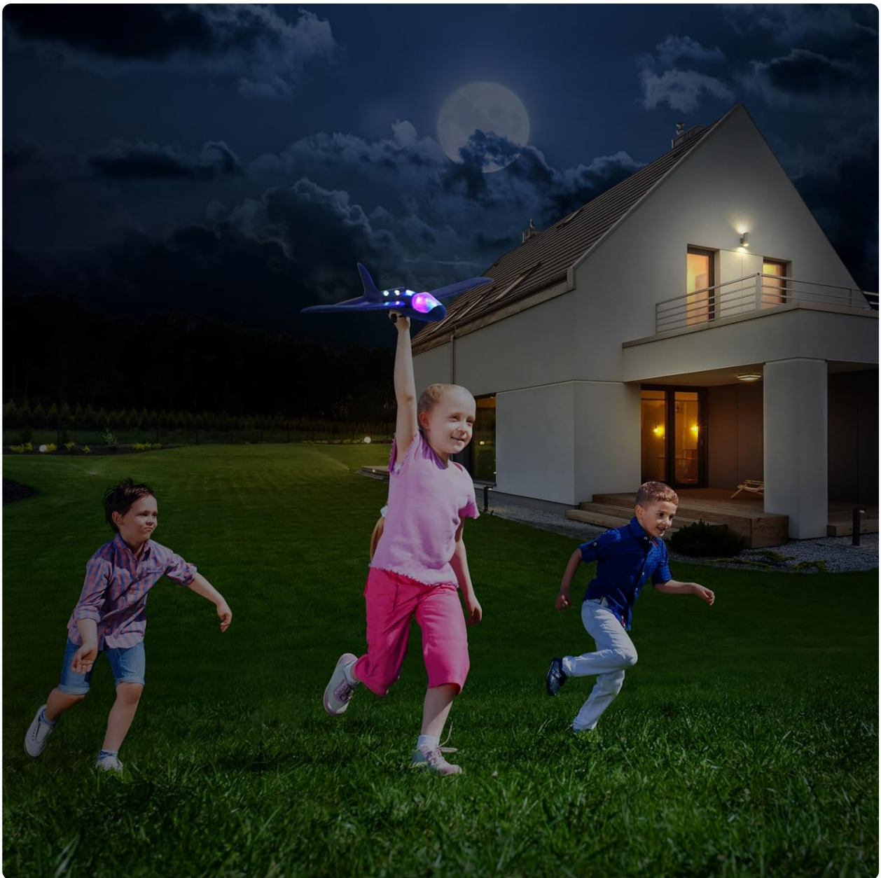
Image: Night Play with Lights - Shows children enjoying the airplanes with activated LED lights in the evening.