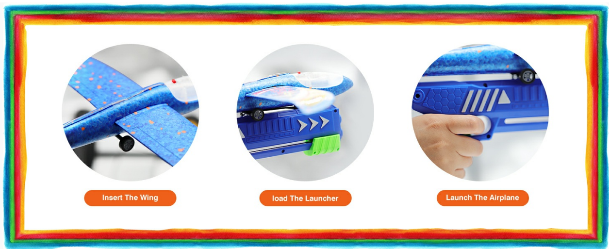
Image: Assembly Steps Diagram - Detailed visual instructions for inserting the wing, loading the launcher, and launching the airplane.