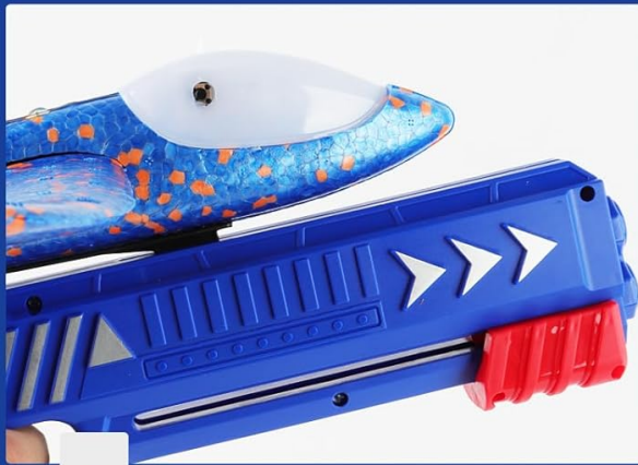
3 Load The Launcher