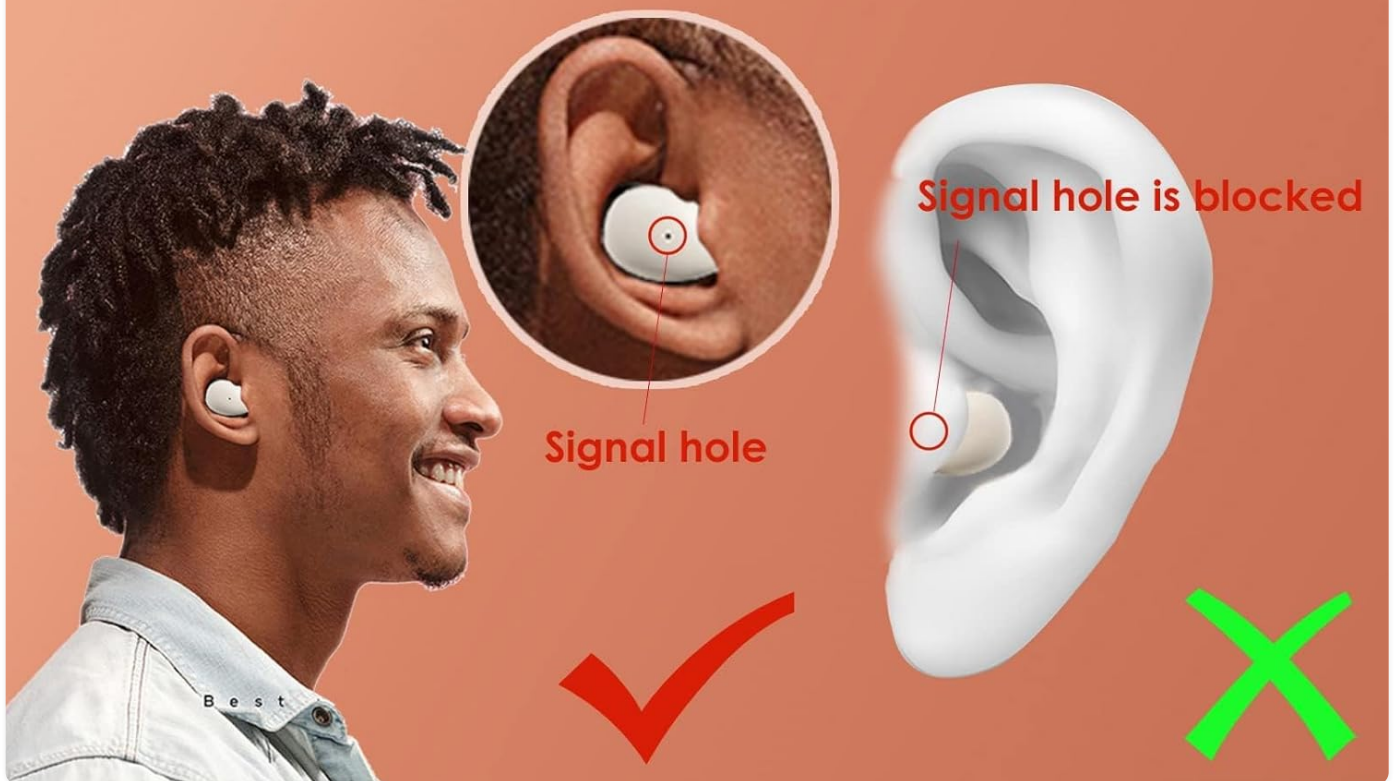
Image: A diagram illustrating the correct way to wear the earbuds, showing the signal hole facing outwards, and an incorrect way where the signal hole is blocked.

Put the earbuds into your ears and place the signal hole outside your ears (this is the most comfortable way to wear them and also ensures the stability of the Bluetooth signal)