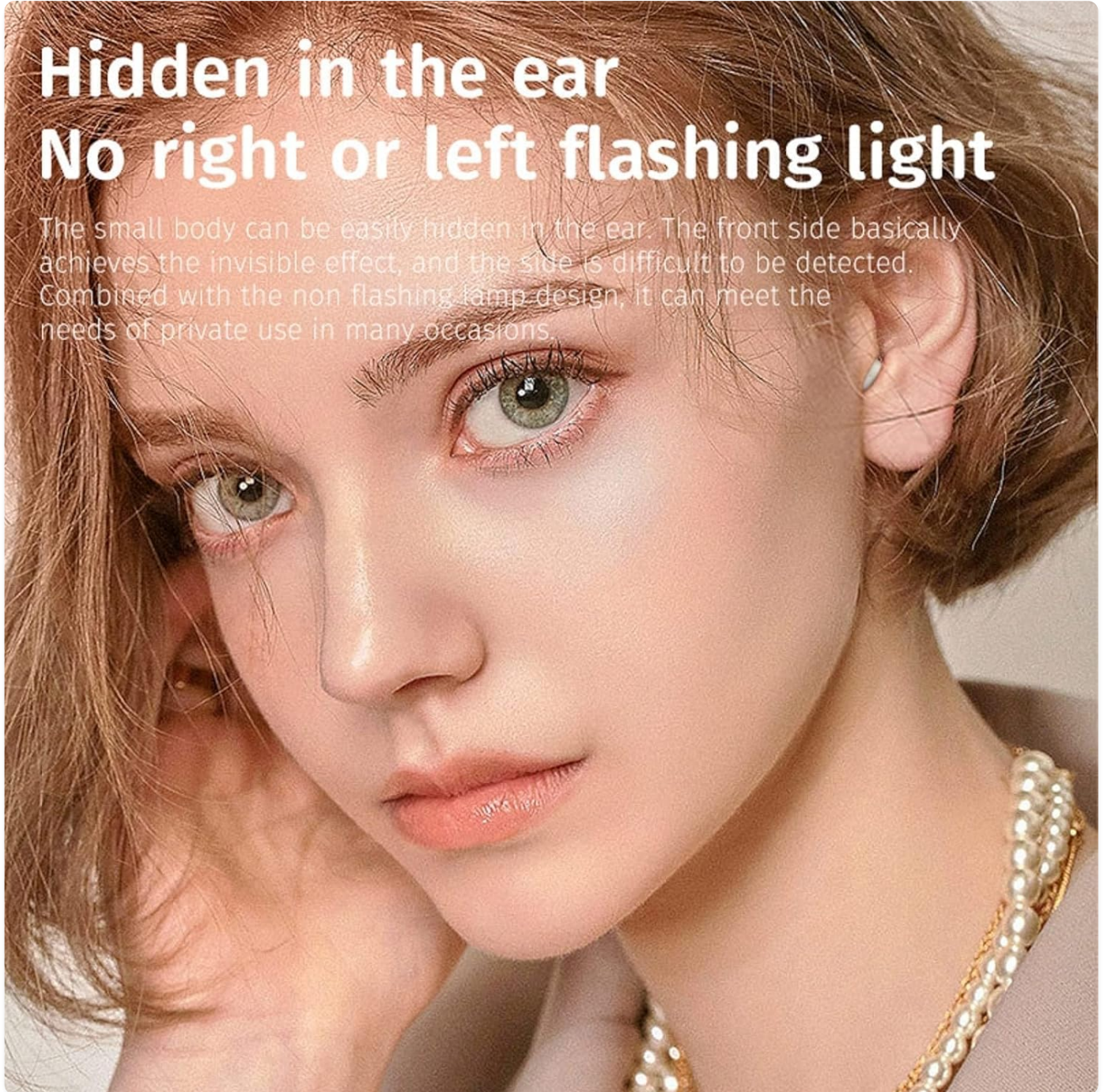
Image: A close-up of a person's ear with the small earbud discreetly placed inside, emphasizing its hidden design and lack of visible flashing lights.

These earbuds are designed to be discreet. Their small size allows them to be hidden in the ear, and they do not feature flashing lights during use, making them suitable for private use in various situations.