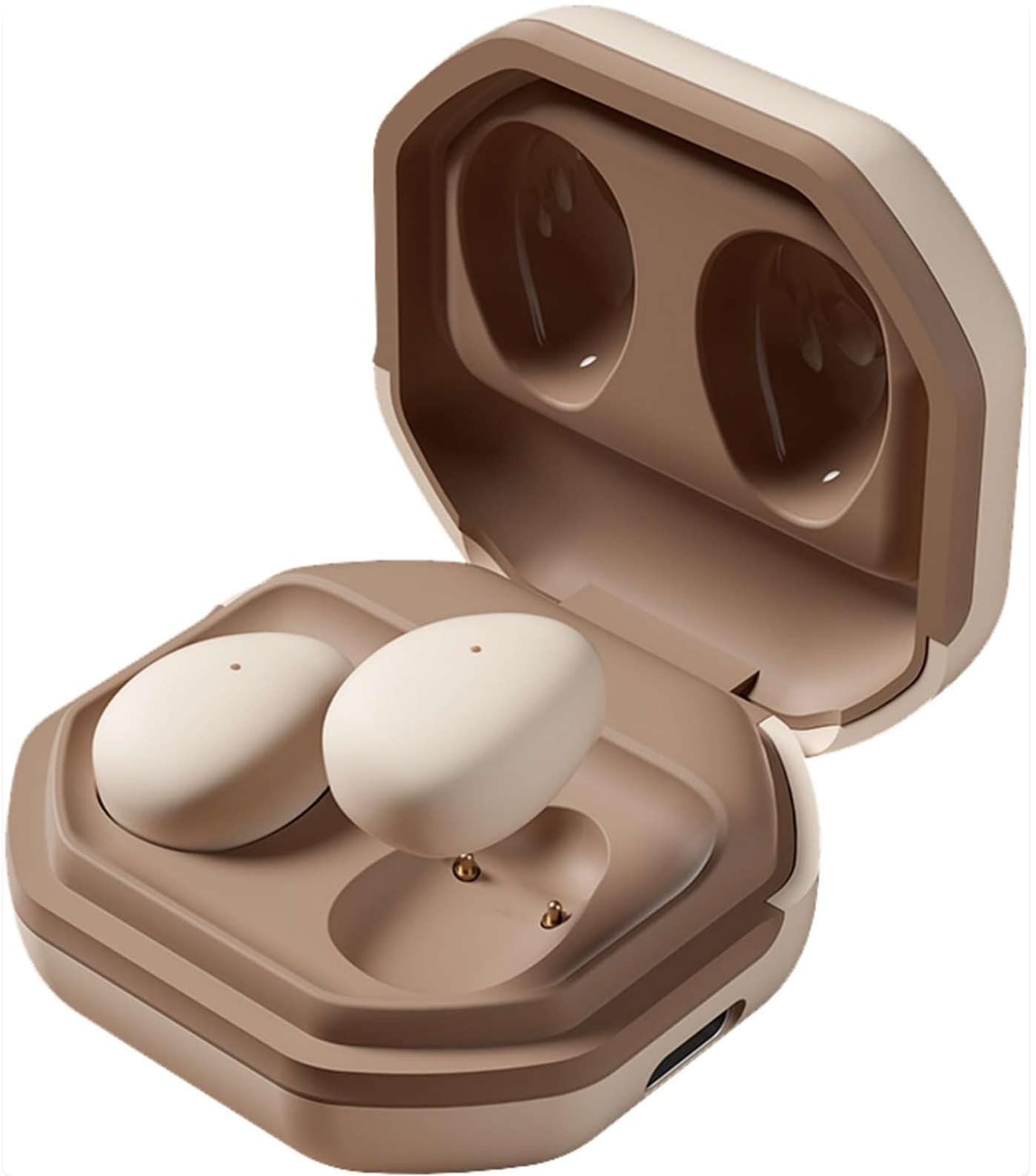
Image: The Xmenha Invisible Sleep Earbuds nestled in their compact brown charging case, with the lid open revealing the earbuds.