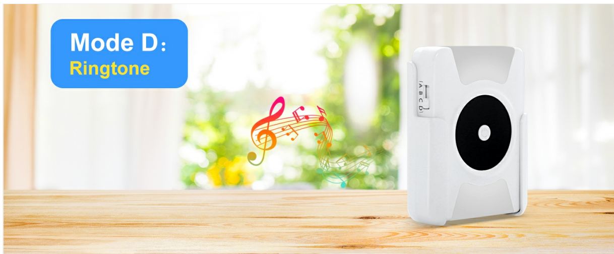
Figure 9: Available working modes for the receiver.