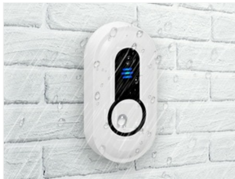
Figure 4: Pairing process for the SanJie Wireless Doorbell.