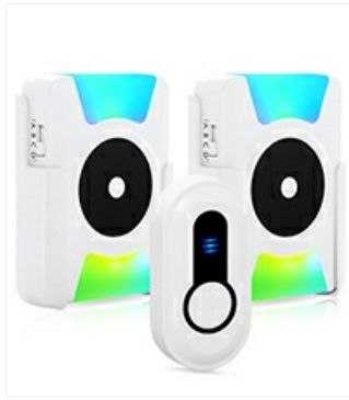
Figure 5: Waterproof push button suitable for outdoor use.