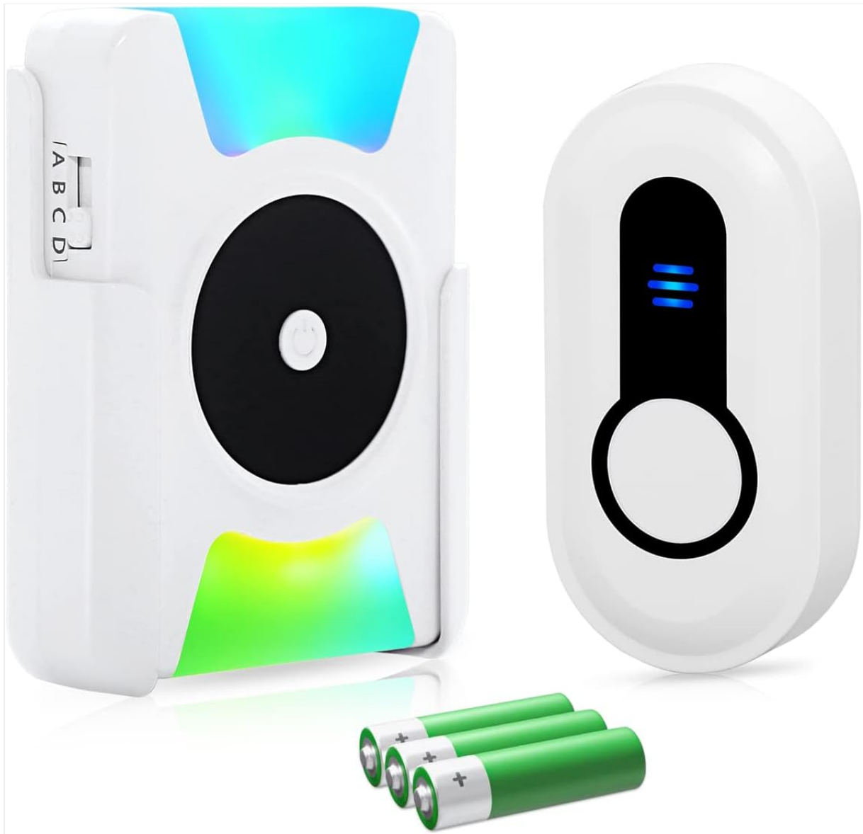
Figure 1: SanJie Wireless Doorbell System (1 Push Button + 1 Receiver)