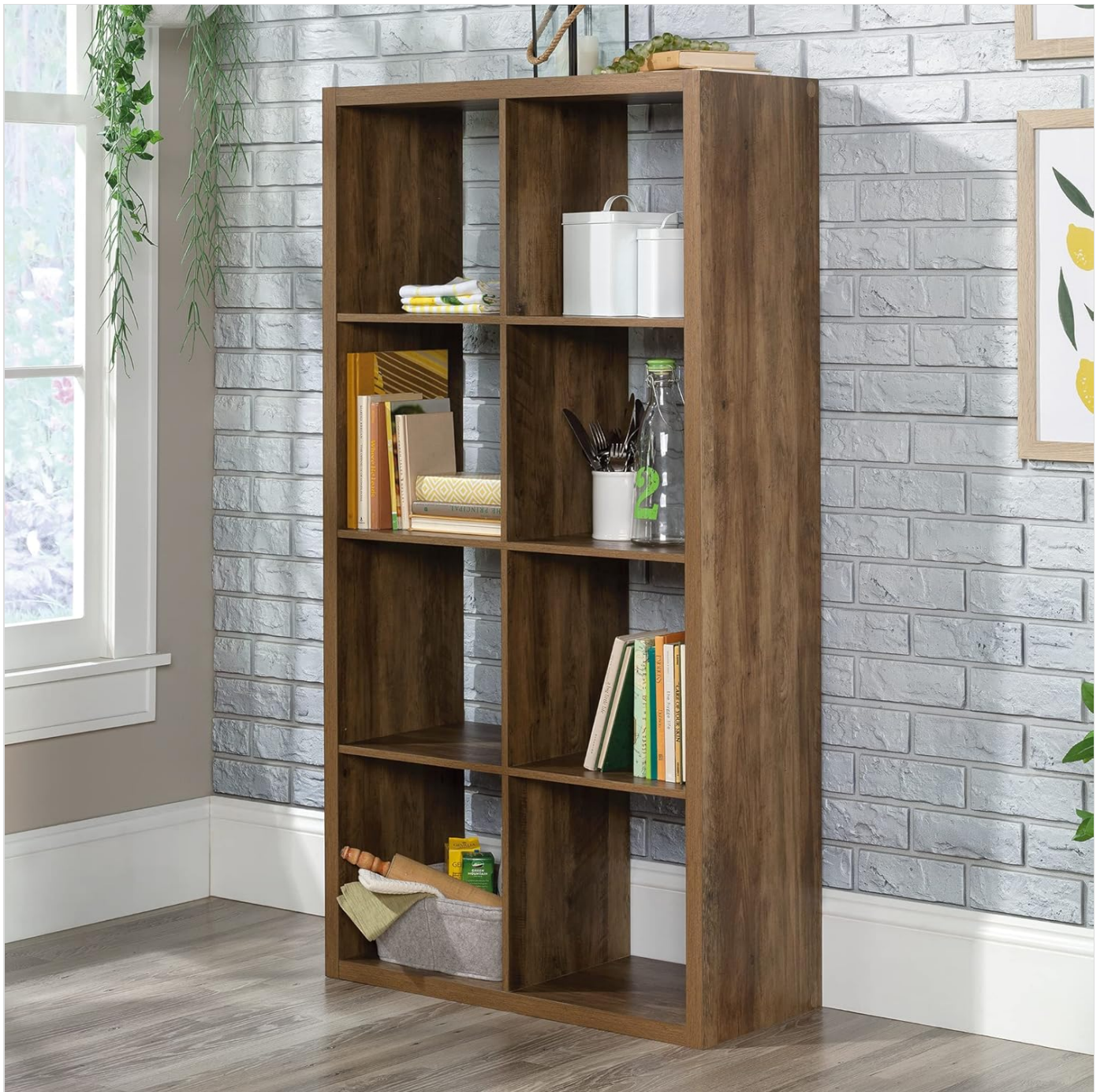
Image 1.1: The 8-Cube Organizer displayed vertically, showcasing its storage capacity for books and decor.