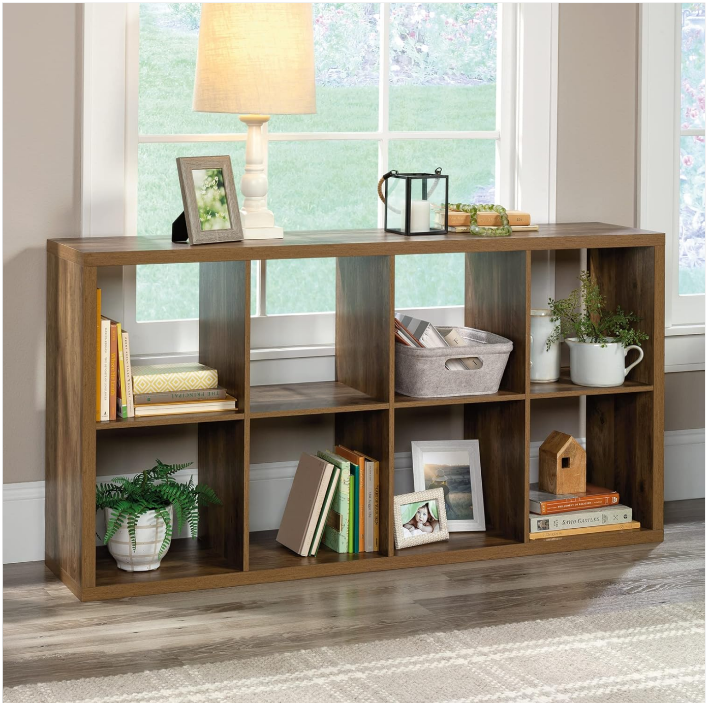
Image 1.2: The 8-Cube Organizer configured horizontally, functioning as a low storage unit or console.