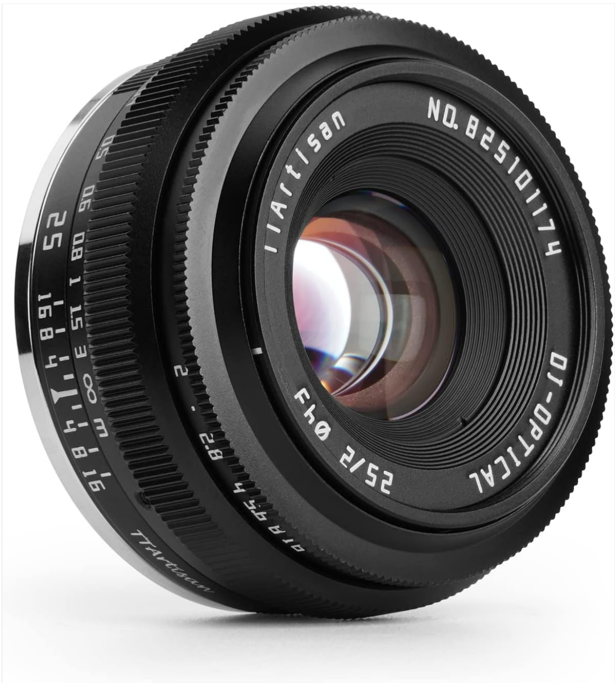
Image: The TtArtisan 25mm F2 APS-C Manual Lens, showcasing its compact design and aperture/focus rings.