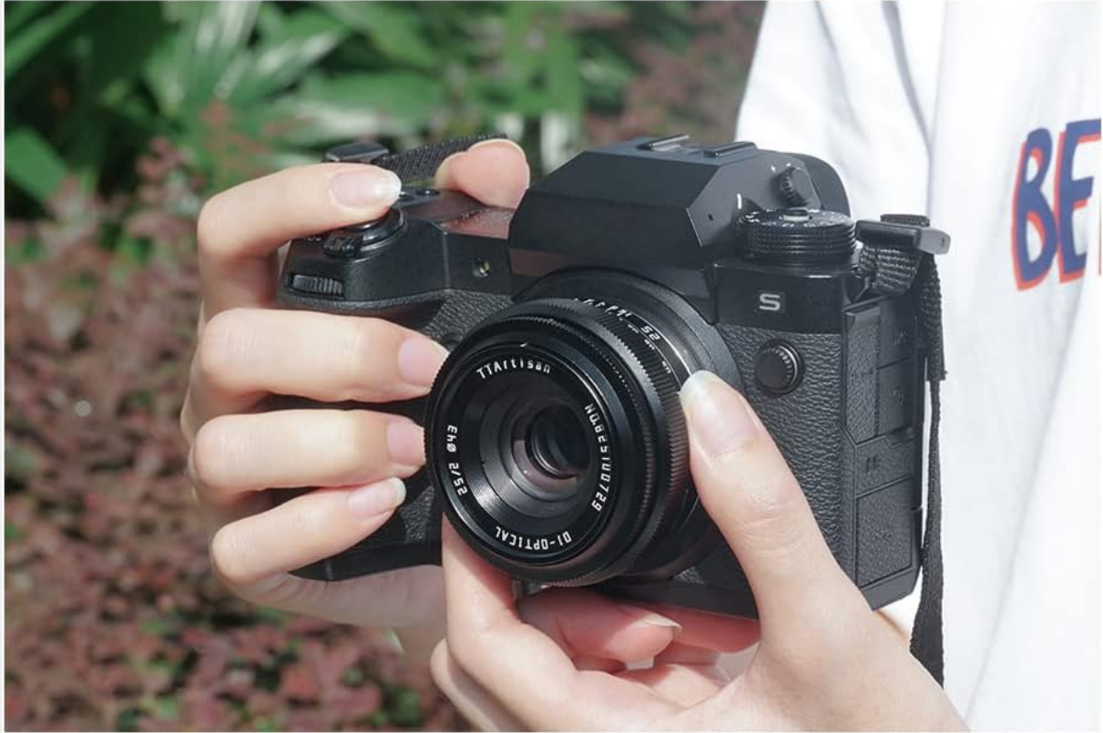
Image: A close-up of the TTArtisan 25mm F2 lens mounted on a camera, highlighting the textured focus and aperture rings.

The compact design improves portability, making it convenient for photographers to take it with them from time to time.