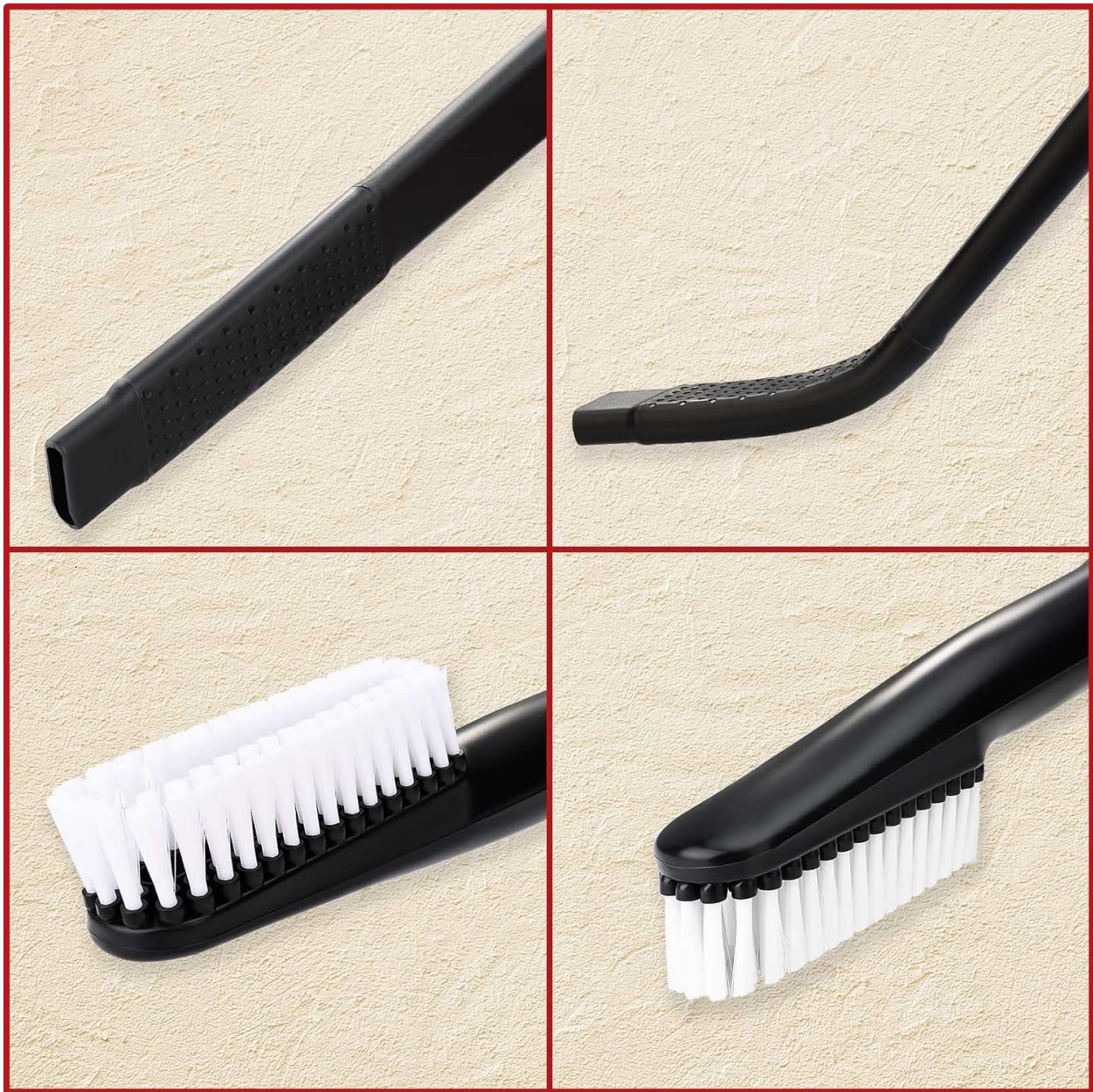
Image: Multiple close-up views of the soft bristle brush and the crevice tool, highlighting their design and features for various cleaning tasks.