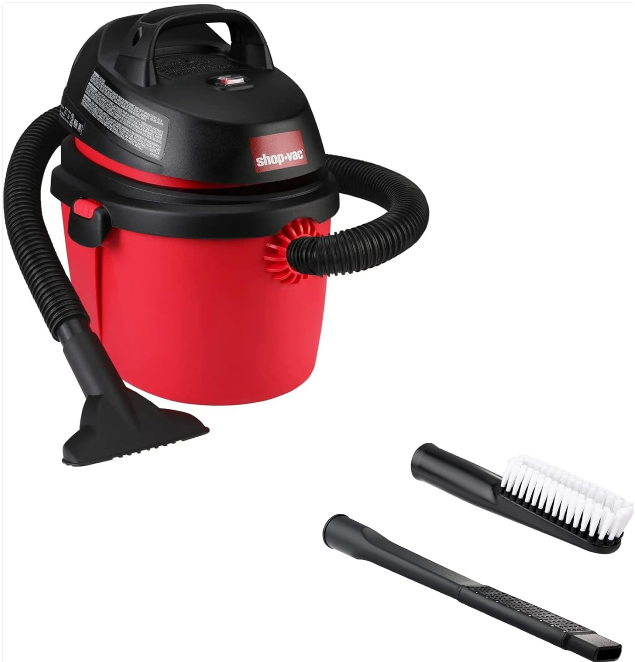
Image: The Shop-Vac 2.5 Gallon 2.0 Peak HP Wet/Dry Vacuum, showcasing its compact design and included accessories like the hose, gulper nozzle, and car cleaning kit.