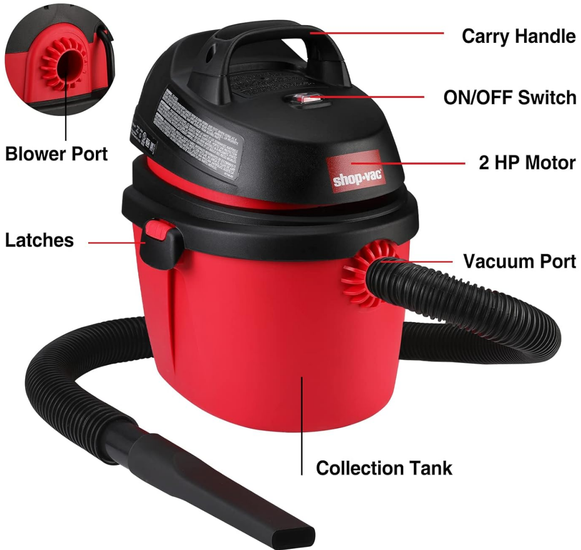
Image: Detailed view of the Shop-Vac vacuum with key components labeled, including the Carry Handle, ON/OFF Switch, 2 HP Motor, Blower Port, Latches, Vacuum Port, and Collection Tank.