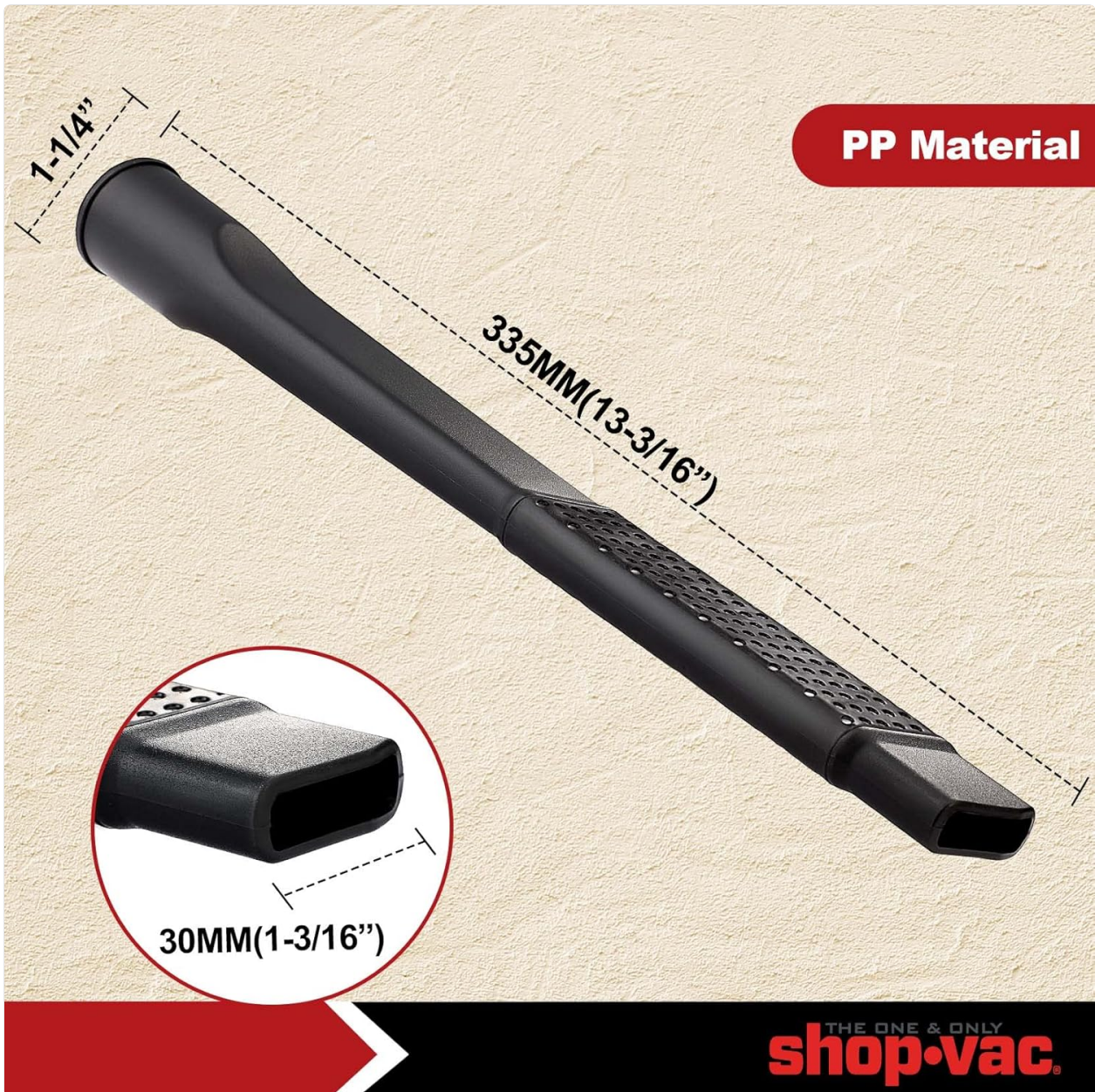
Image: Detailed view showing the dimensions of the crevice tool, indicating its length and tip width for precise cleaning.