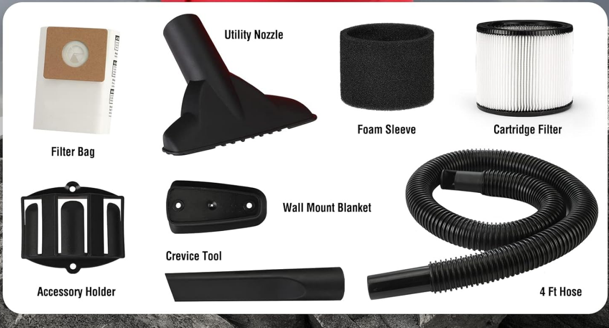
Image: A visual representation of all components included in the Shop-Vac package, such as the vacuum unit, hose, various nozzles, and filters.