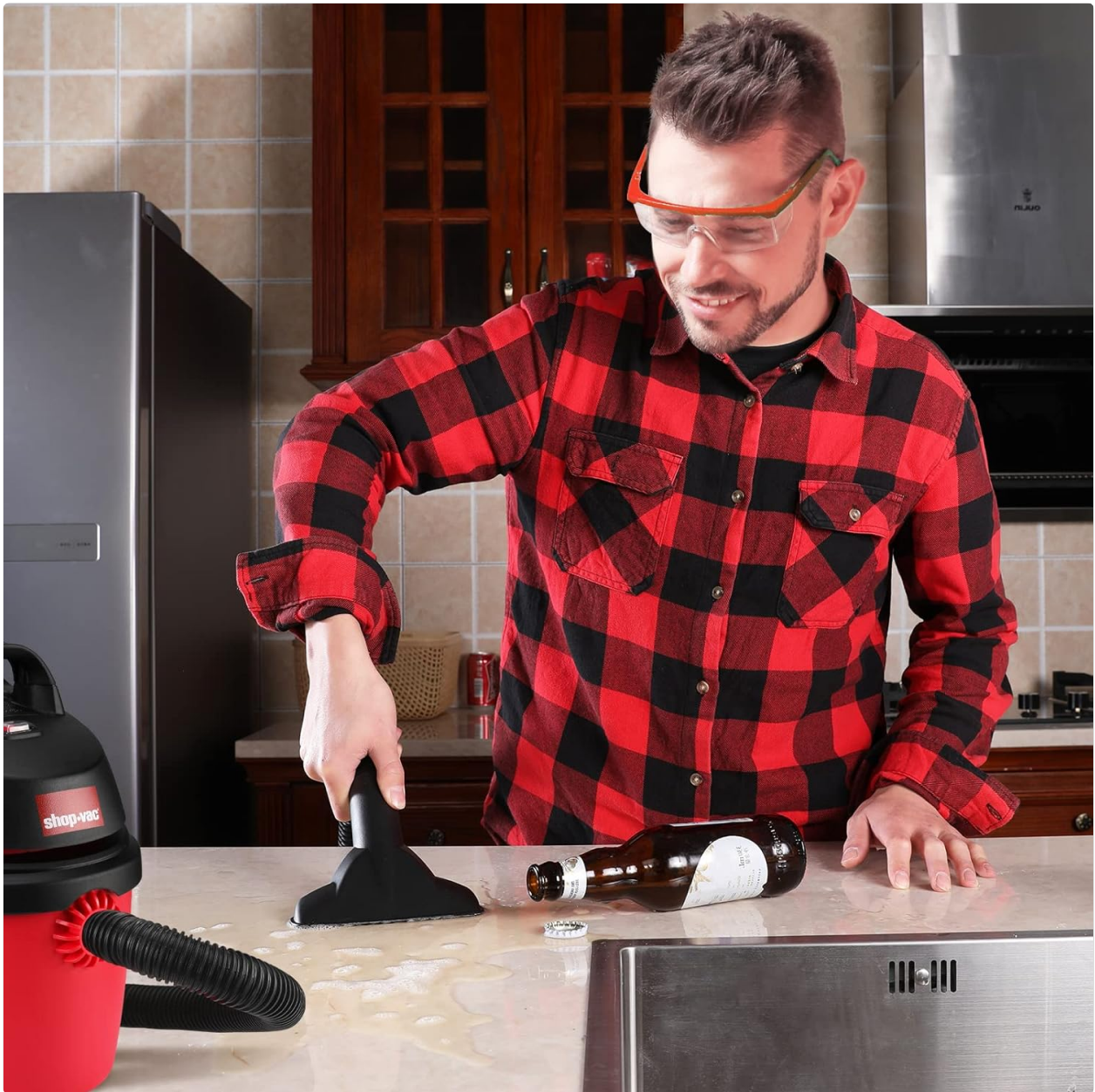
Image: A user demonstrating the wet vacuuming capability of the Shop-Vac, effectively cleaning a liquid spill on a countertop.