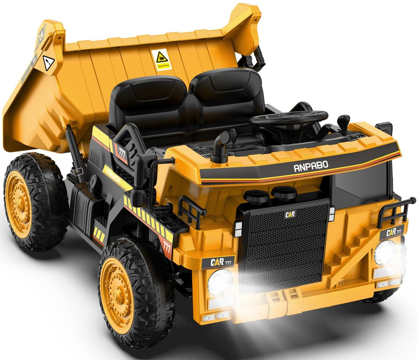
Image: The ANPABO Ride on Dump Truck, showcasing its vibrant yellow and black design with functional headlights.