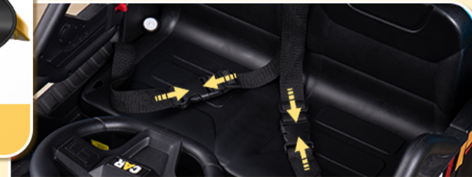
19" Seat with Safety Belt

Image: The truck's multimedia capabilities, including Bluetooth and USB connectivity for playing music.