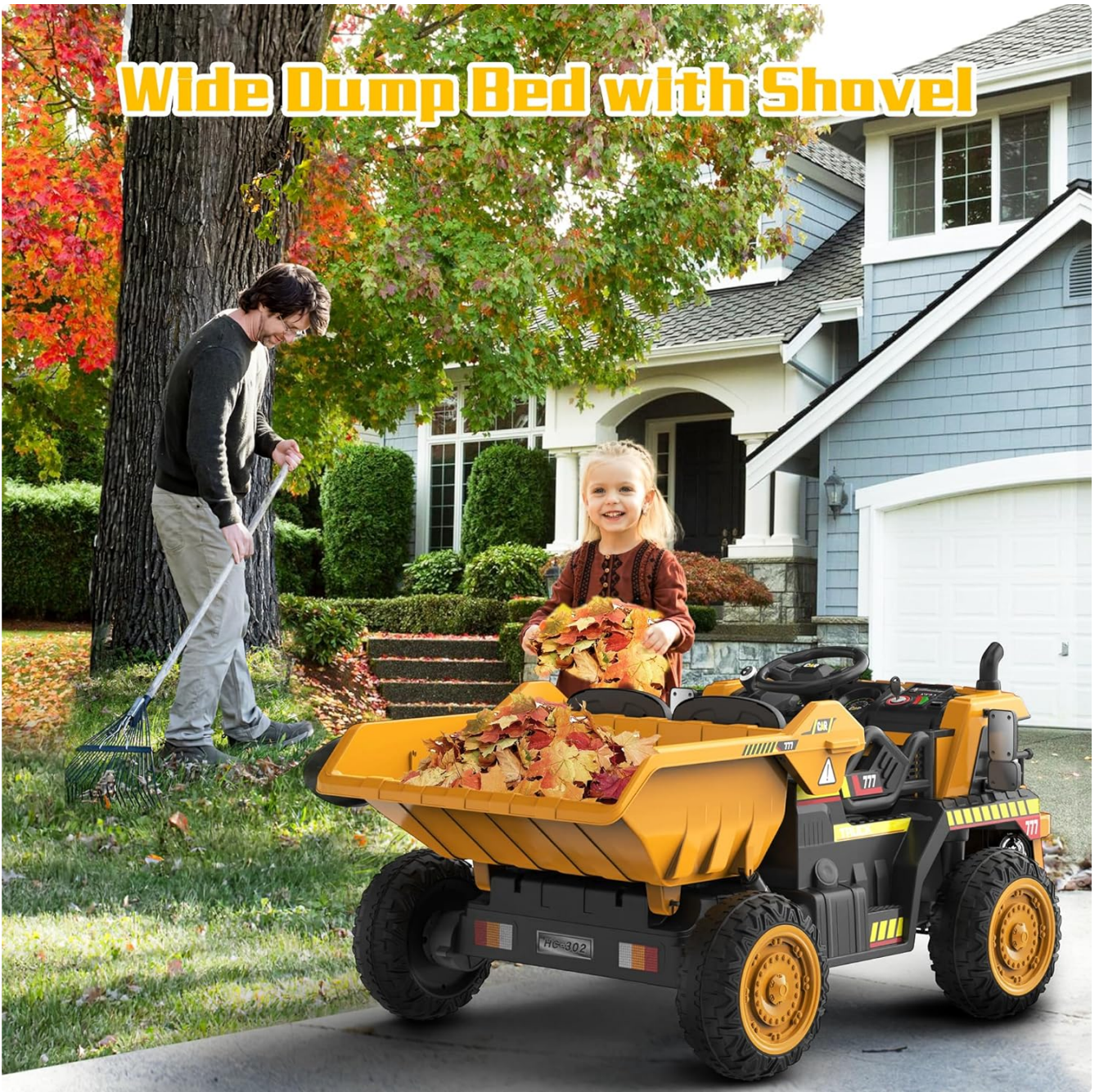
Image: The wide dump bed and included shovel, perfect for imaginative play and assisting with light yard work.