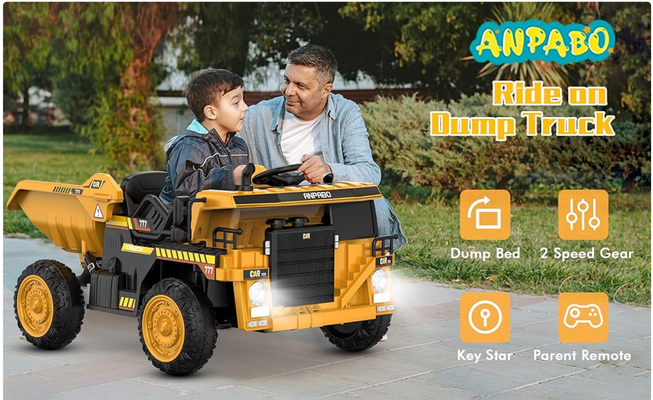
Image: Visual guide on controlling the dump bed's automatic lifting and dumping function.