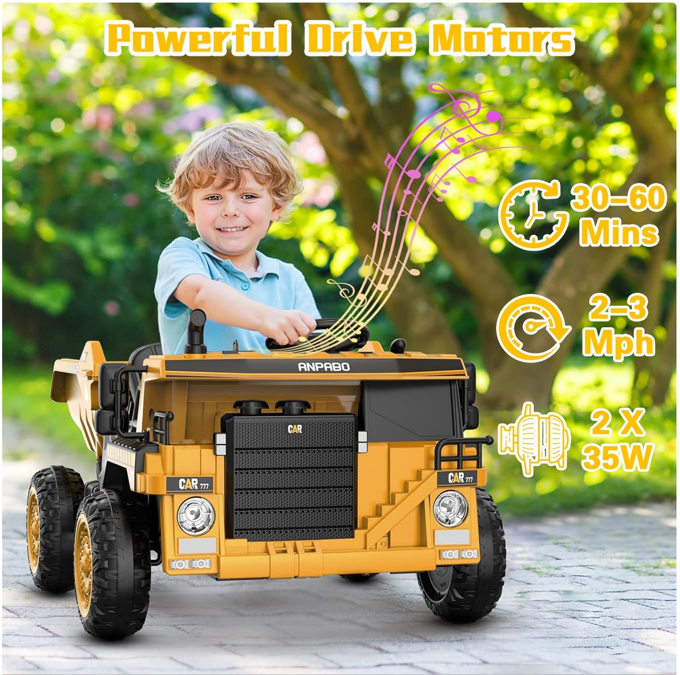
Image: The powerful drive motors of the truck, ensuring robust performance and extended play sessions.