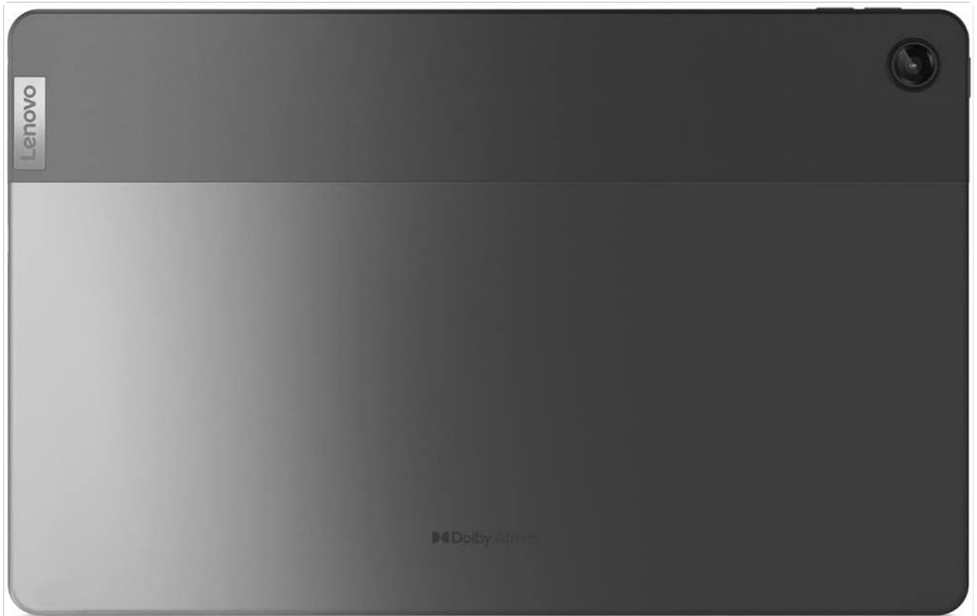
Figure 5: Rear view of the tablet, highlighting the main camera lens and flash.