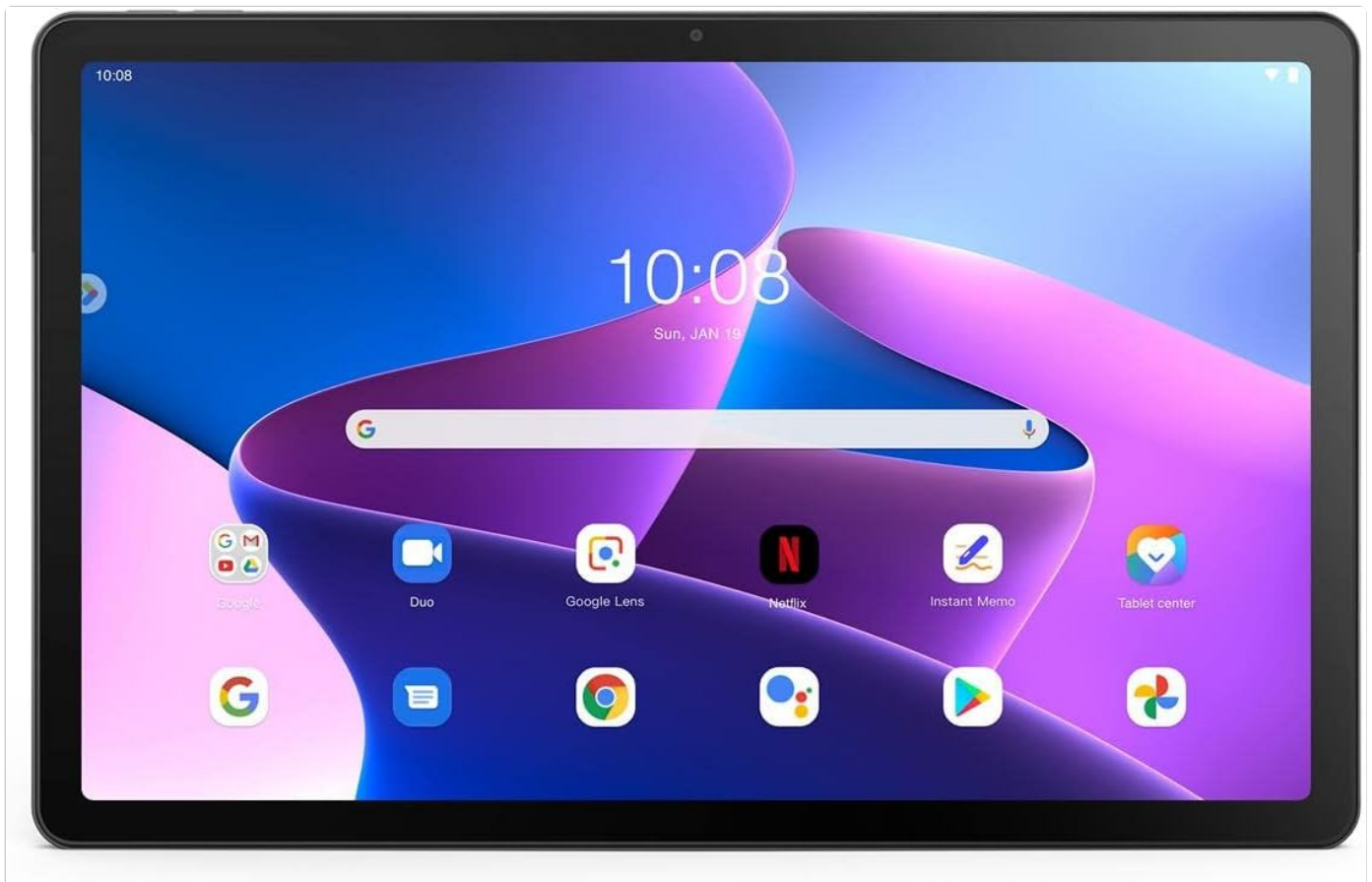
Figure 4: The tablet's home screen, showing typical Android interface elements and app icons.