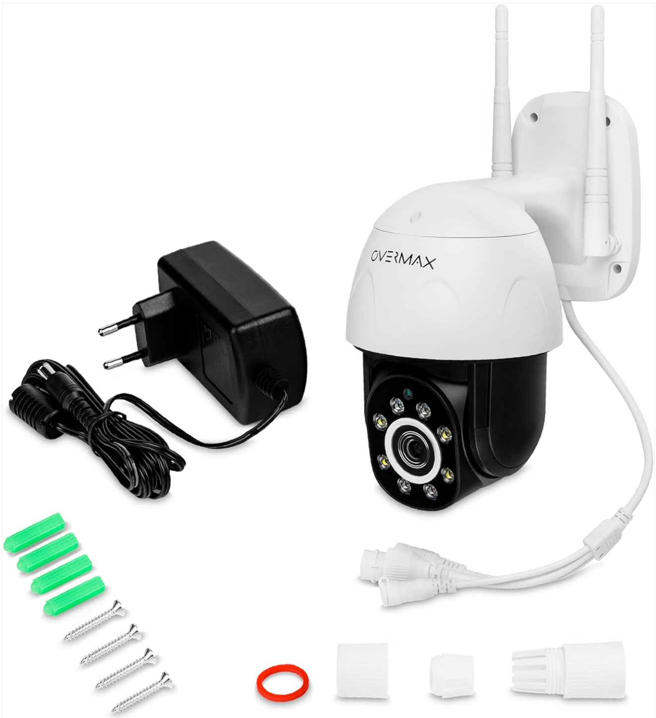
Image 3.1: Package contents for the Overmax Camspot 4.9 Pro camera.