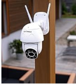
Image 4.1: Overmax Camspot 4.9 Pro camera mounted on an outdoor wooden post.