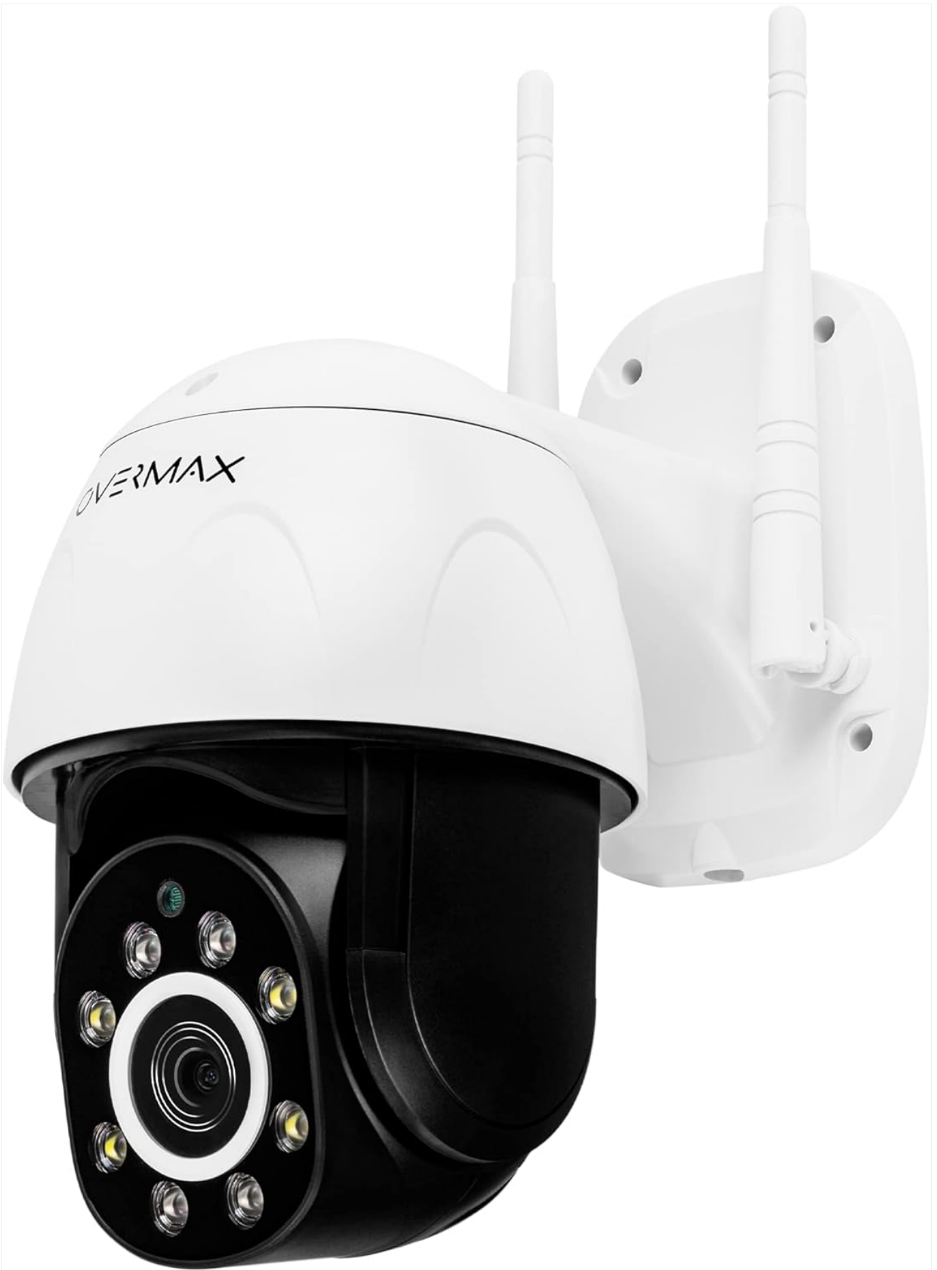
Image 2.1: Front view of the Overmax Camspot 4.9 Pro camera, showing the lens and LED array.