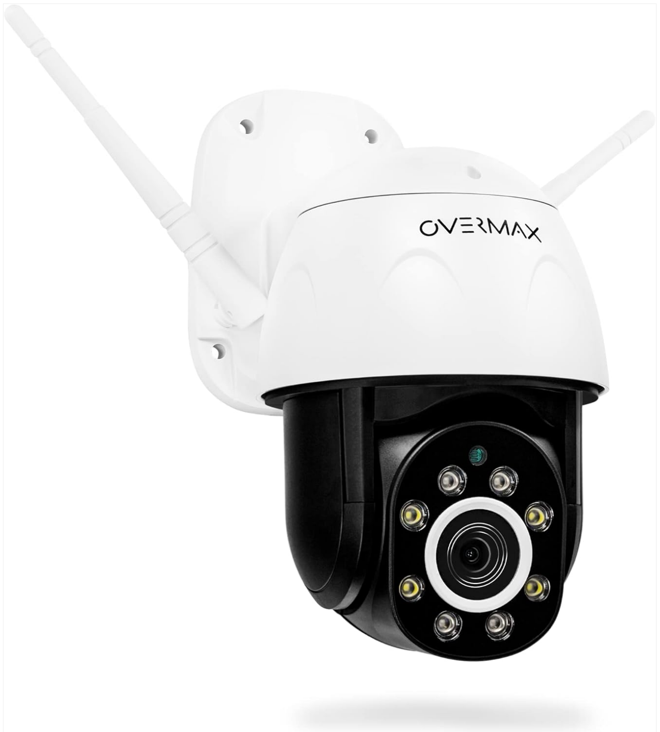
Image 5.3: Front view of the camera with its night vision LEDs active.