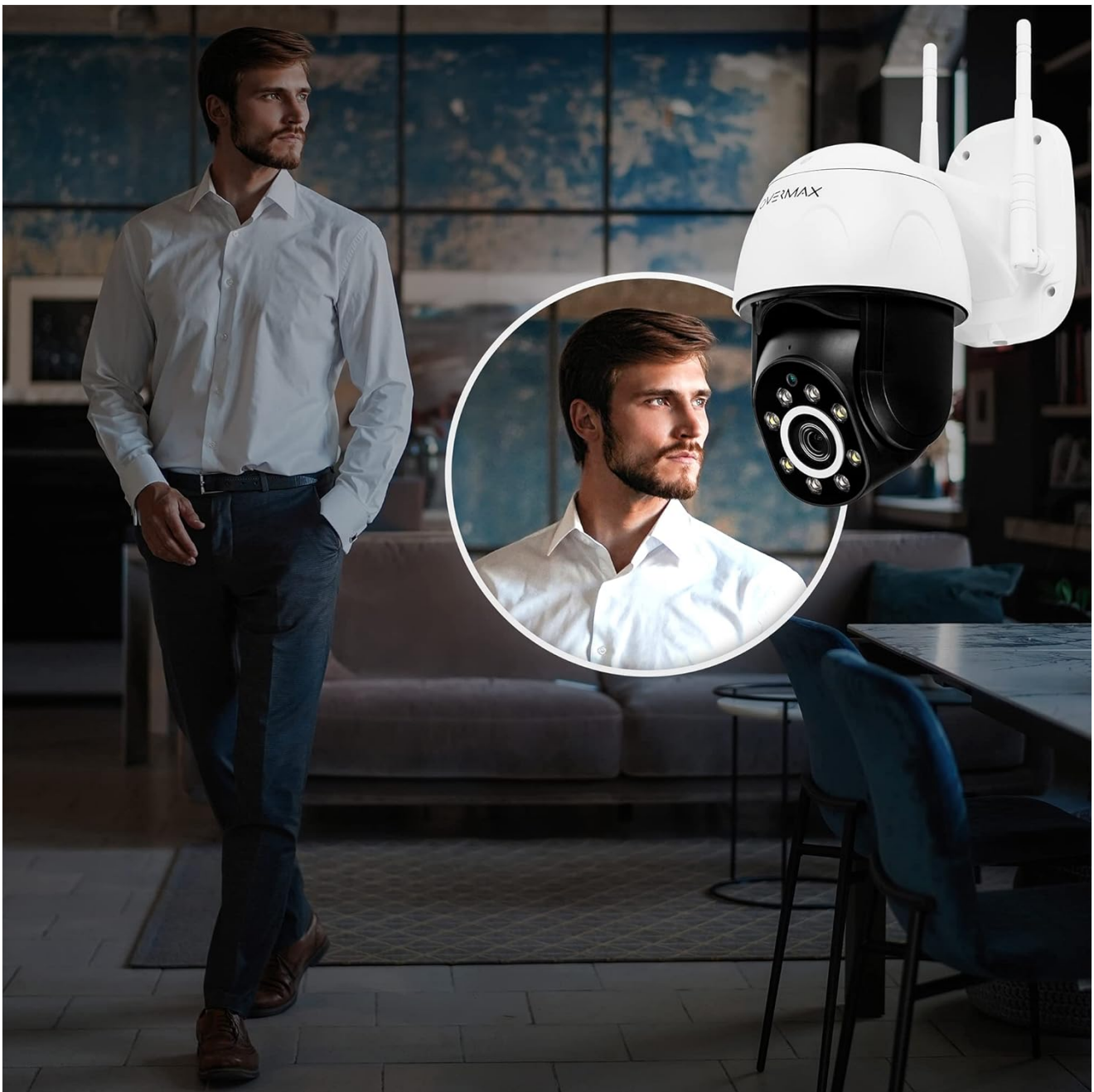
Image 5.1: The camera providing a live view of a person in an indoor setting.