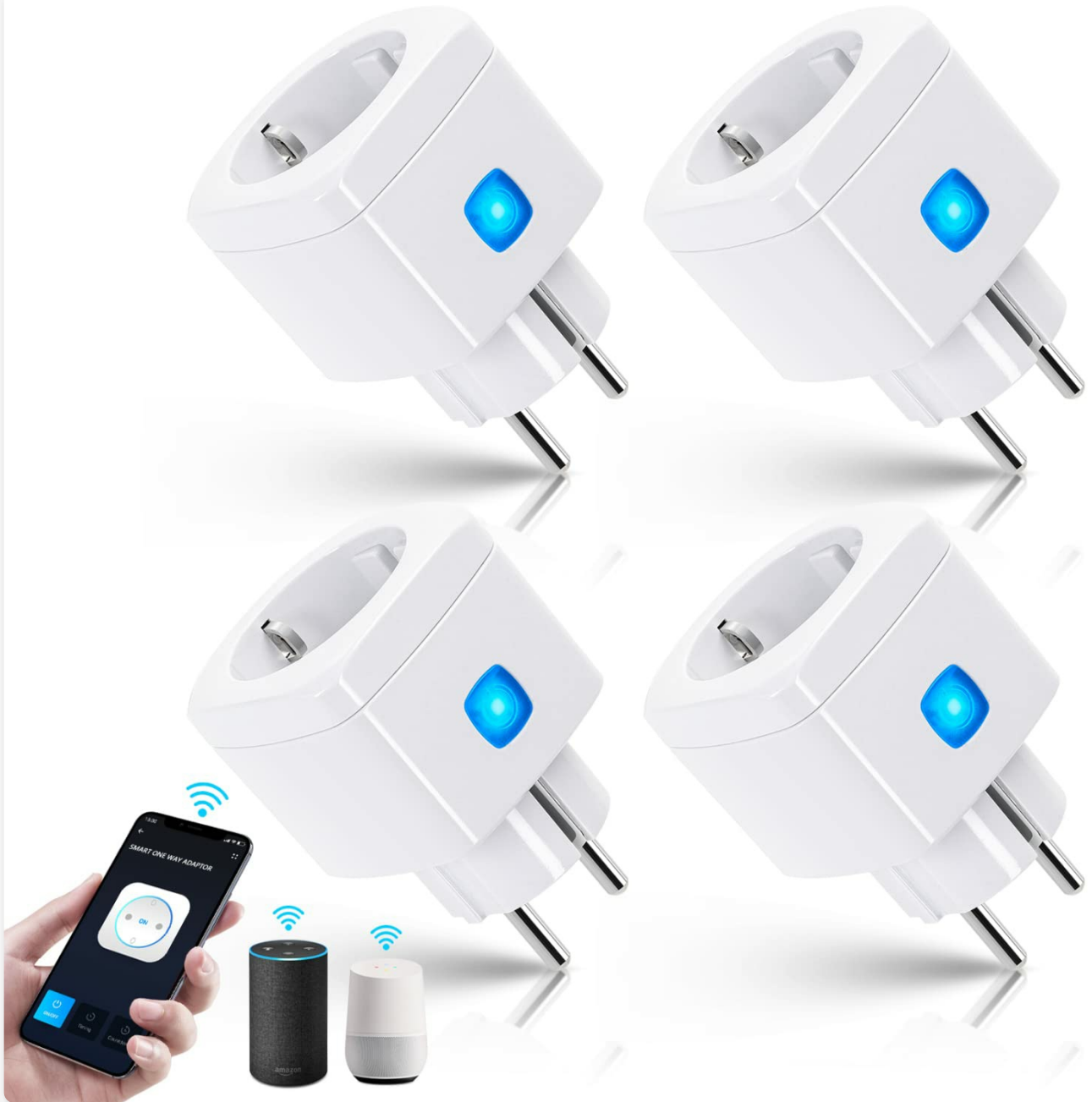
Image: A set of four Aigostar Mini Smart Wifi Plugs, demonstrating their compact design and compatibility with smart home ecosystems like Alexa and Google Home via a smartphone app.