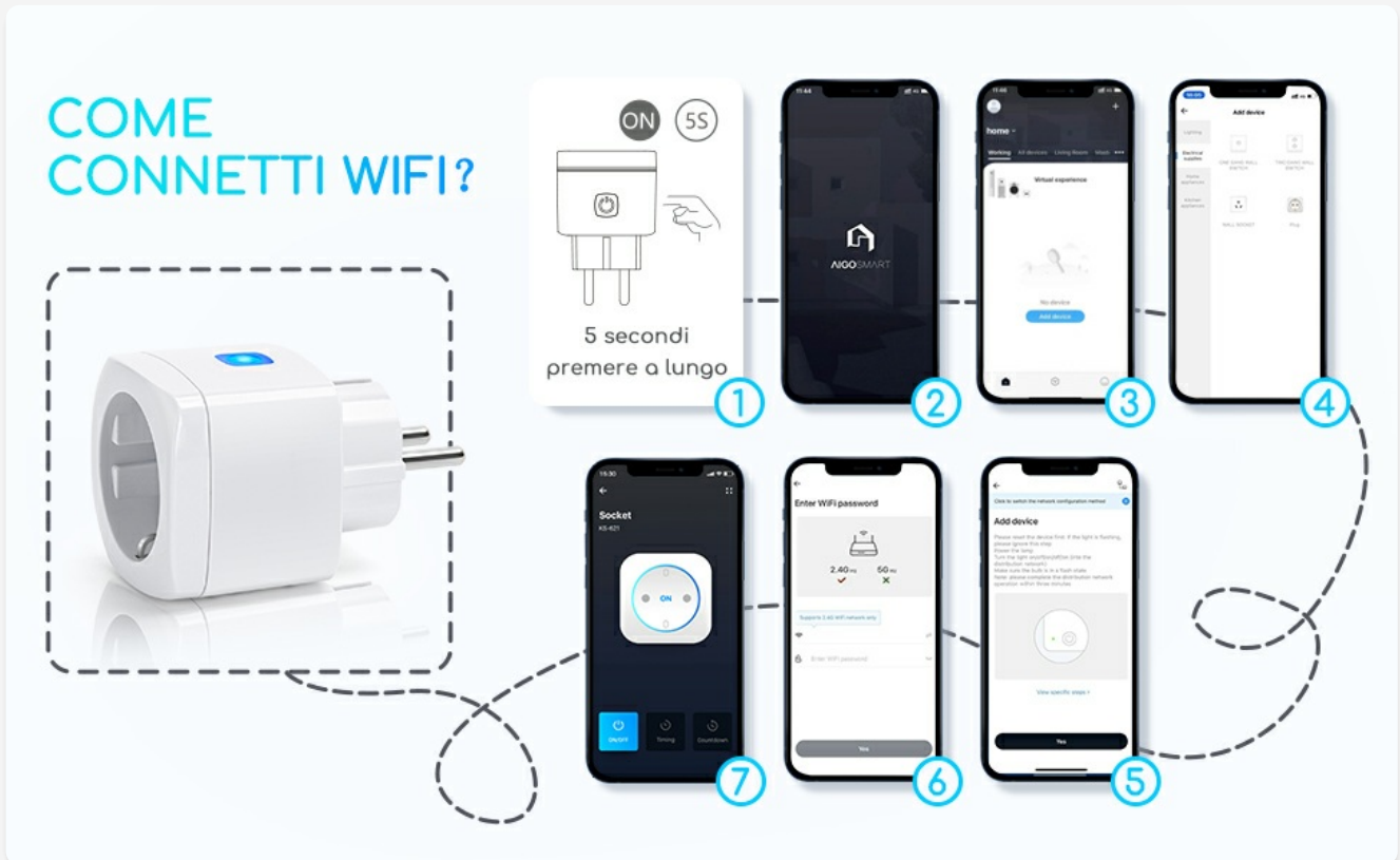
Image: A visual guide demonstrating the 7 steps to connect the Aigostar Smart Plug to your home Wi-Fi network using the AigoSmart app, including downloading the app, pressing the plug button, adding the device, and entering Wi-Fi credentials.