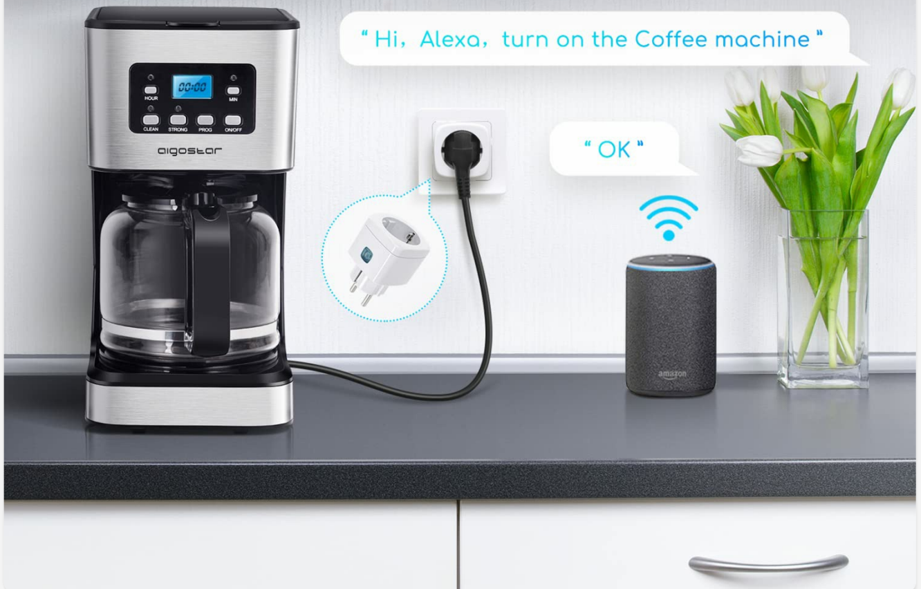
Image: A kitchen scene where a person is using an Amazon Alexa device to voice control a coffee machine plugged into an Aigostar Smart Plug, demonstrating the command "Hi, Alexa, turn on the Coffee machine" and the response "OK".