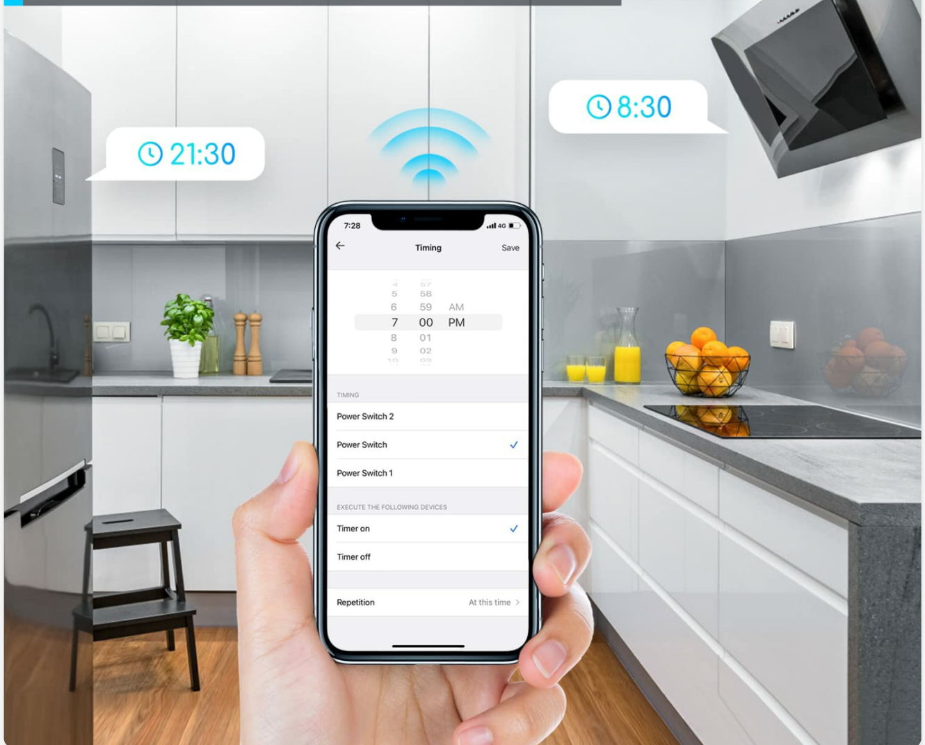
Image: A smartphone screen displaying the scheduling and timer settings within the AigoSmart app, allowing users to program their smart plugs for automatic operation at specific times, such as 9:30 PM or 8:30 AM.