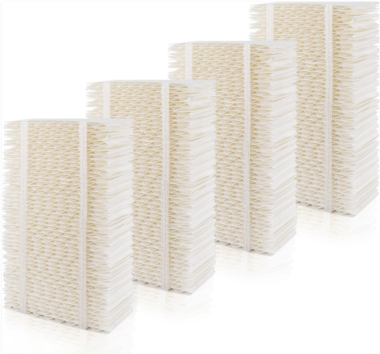
Image: A pack of four Funmit HDC411 humidifier wick filters, ready for use.