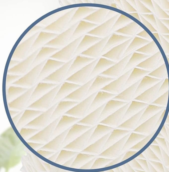
Image: Detailed view of the filter's construction, highlighting hot glue strips, dense material, cotton fiber, and reinforced mesh paper.