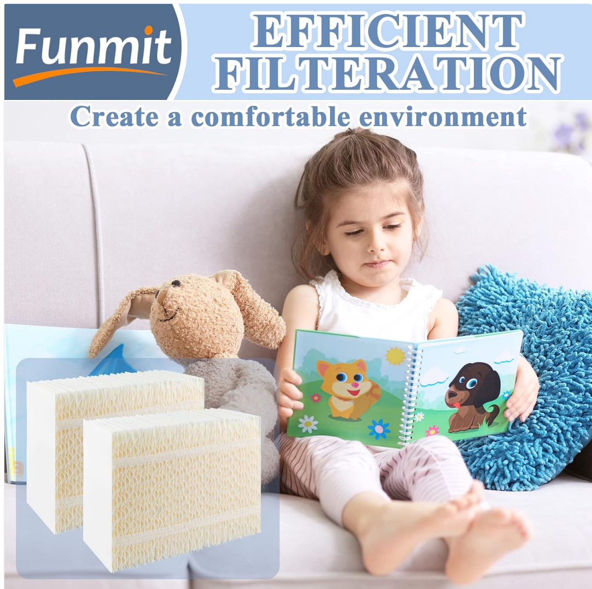
Image: A comfortable indoor setting, suggesting the benefits of efficient air filtration provided by the humidifier filters.

Once the new filter is installed, operate your humidifier as per its manufacturer's instructions. The Funmit HDC411 filter will begin to absorb water and release moisture into the air. It may take a short period for the filter to become fully saturated and for optimal humidification to begin.