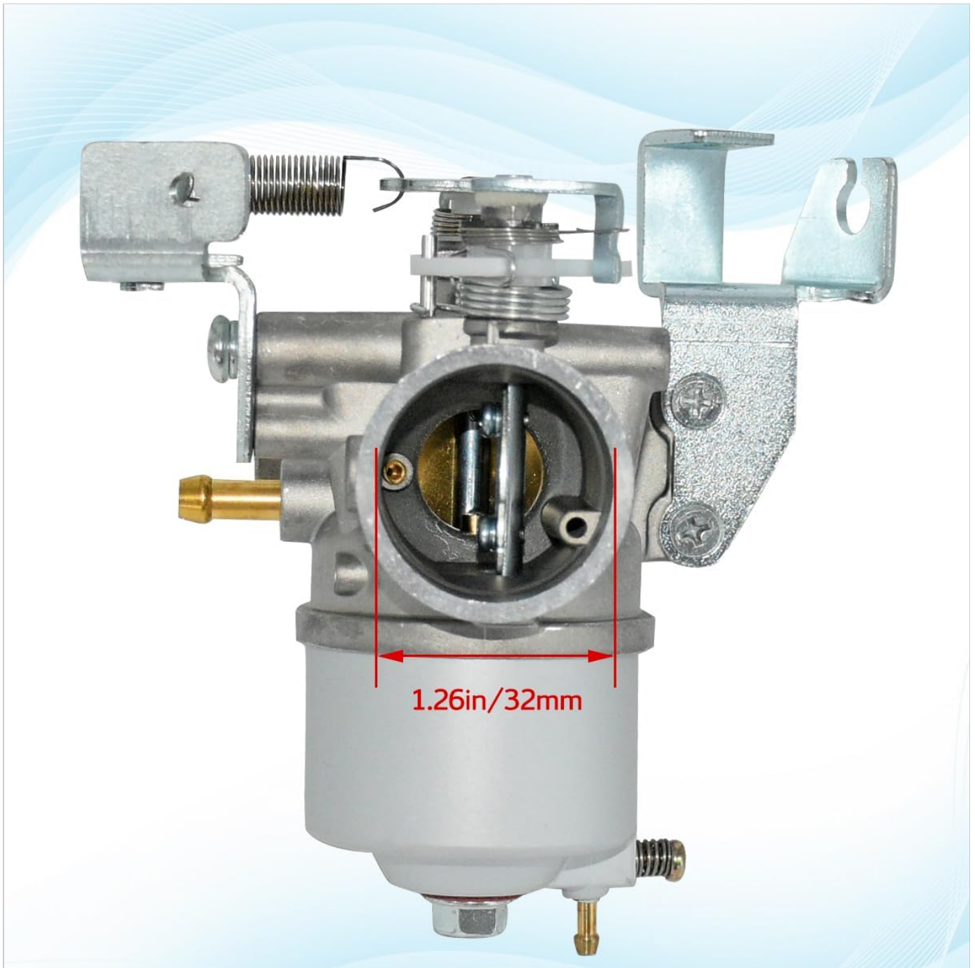
Figure 5: Top view of the carburetor with key dimensions. This image illustrates the overall width and height of the carburetor assembly.