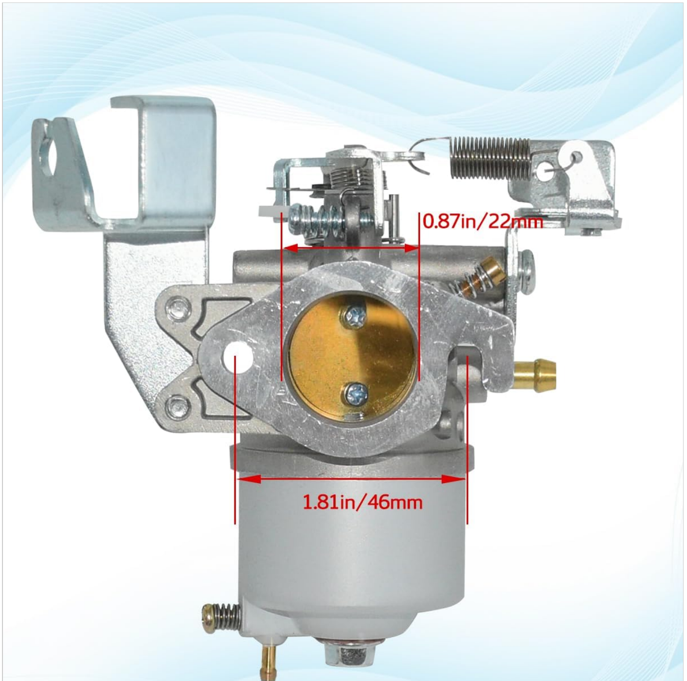
Figure 4: Front view of the carburetor with key dimensions. This image helps in understanding the carburetor's intake and outlet measurements.