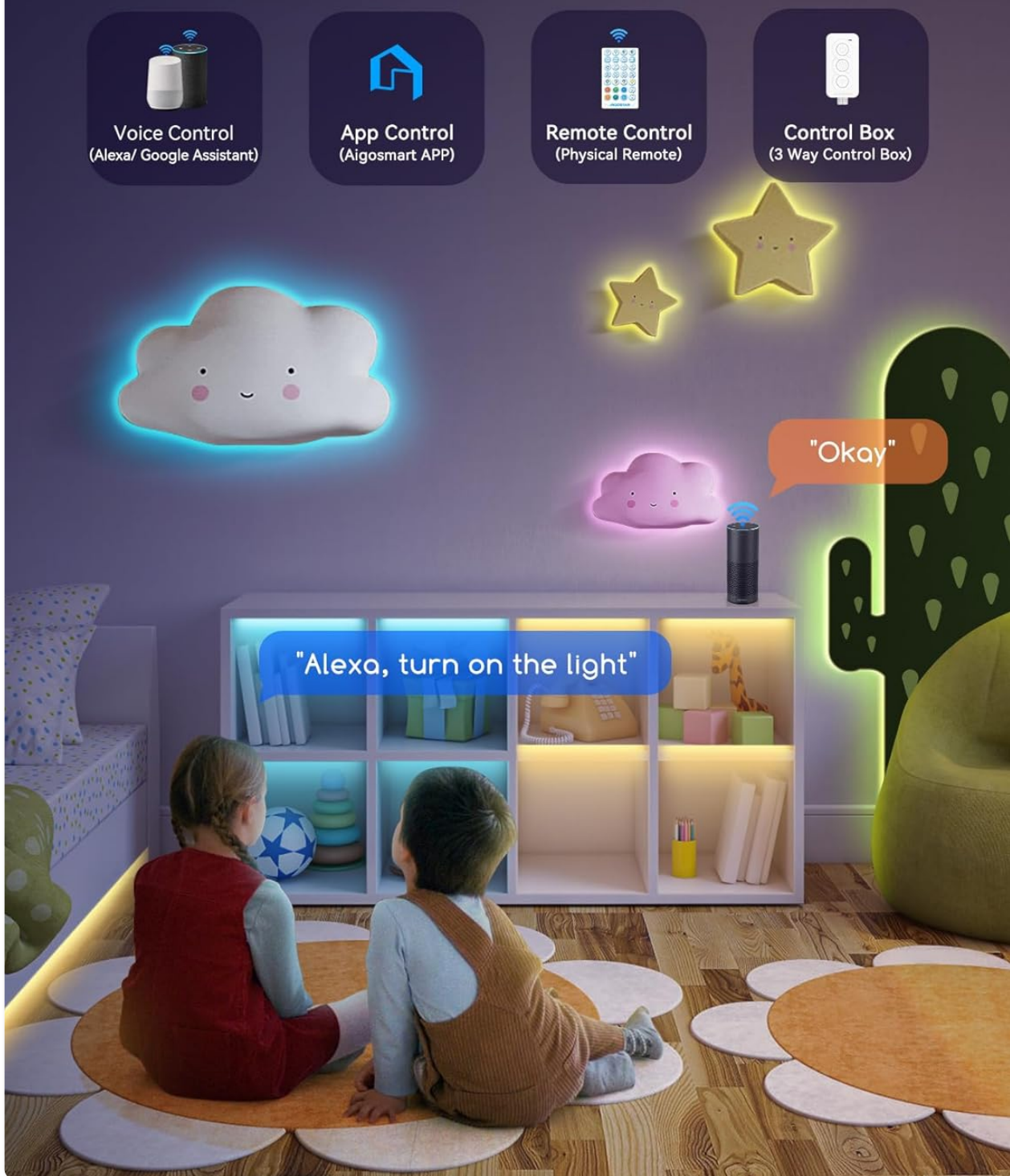
Image: This image illustrates the four primary methods for controlling the Aigostar Smart LED Strip Light: voice commands via Alexa or Google Assistant, the Aigosmart mobile application, the included physical remote control, and the integrated 3-button control box.