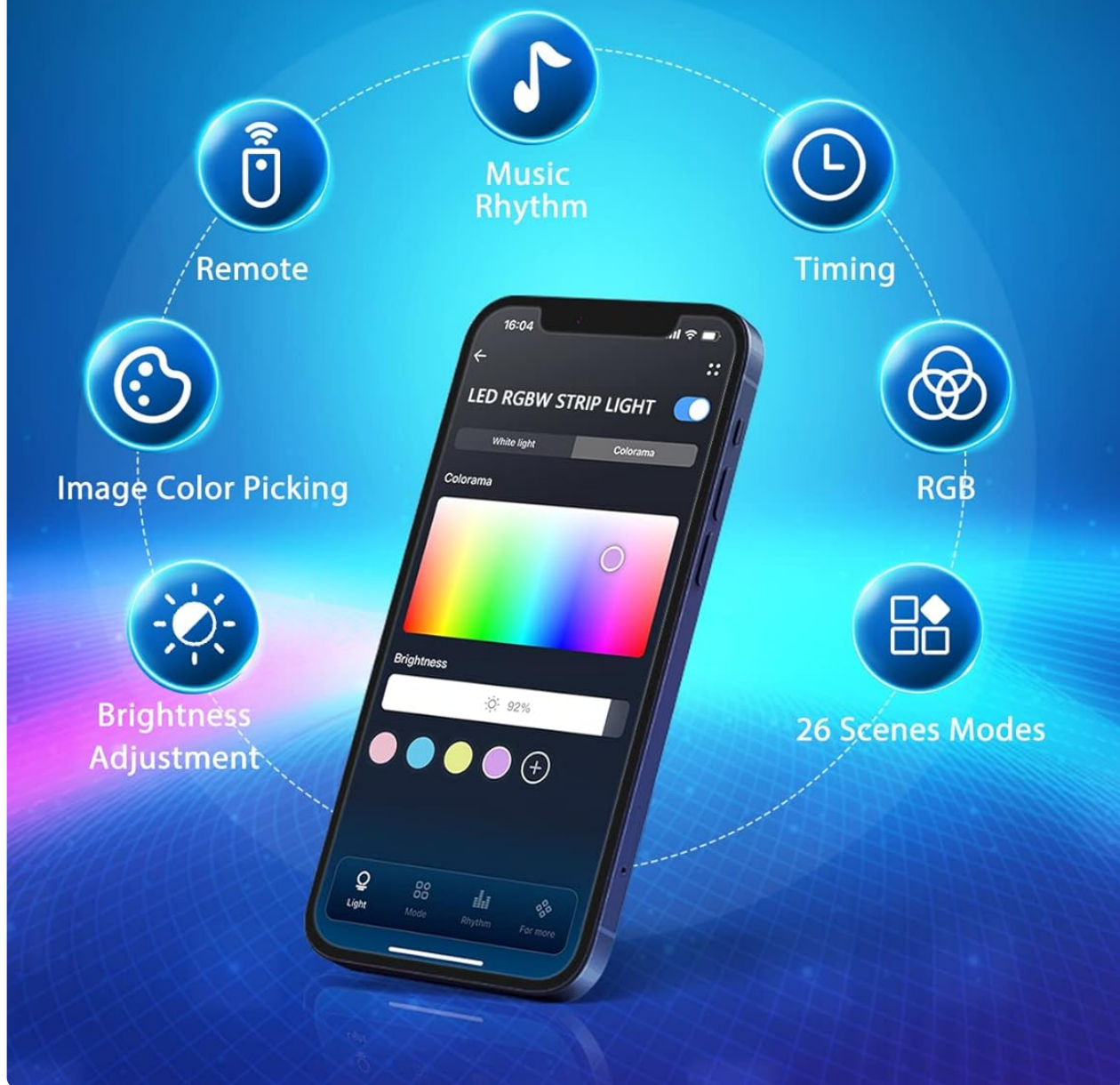
Image: The Aigosmart app on a smartphone, showing a color selection interface with a color wheel and brightness adjustment. It also highlights features like music rhythm, timing, RGB control, image color picking, and 26 scene modes.