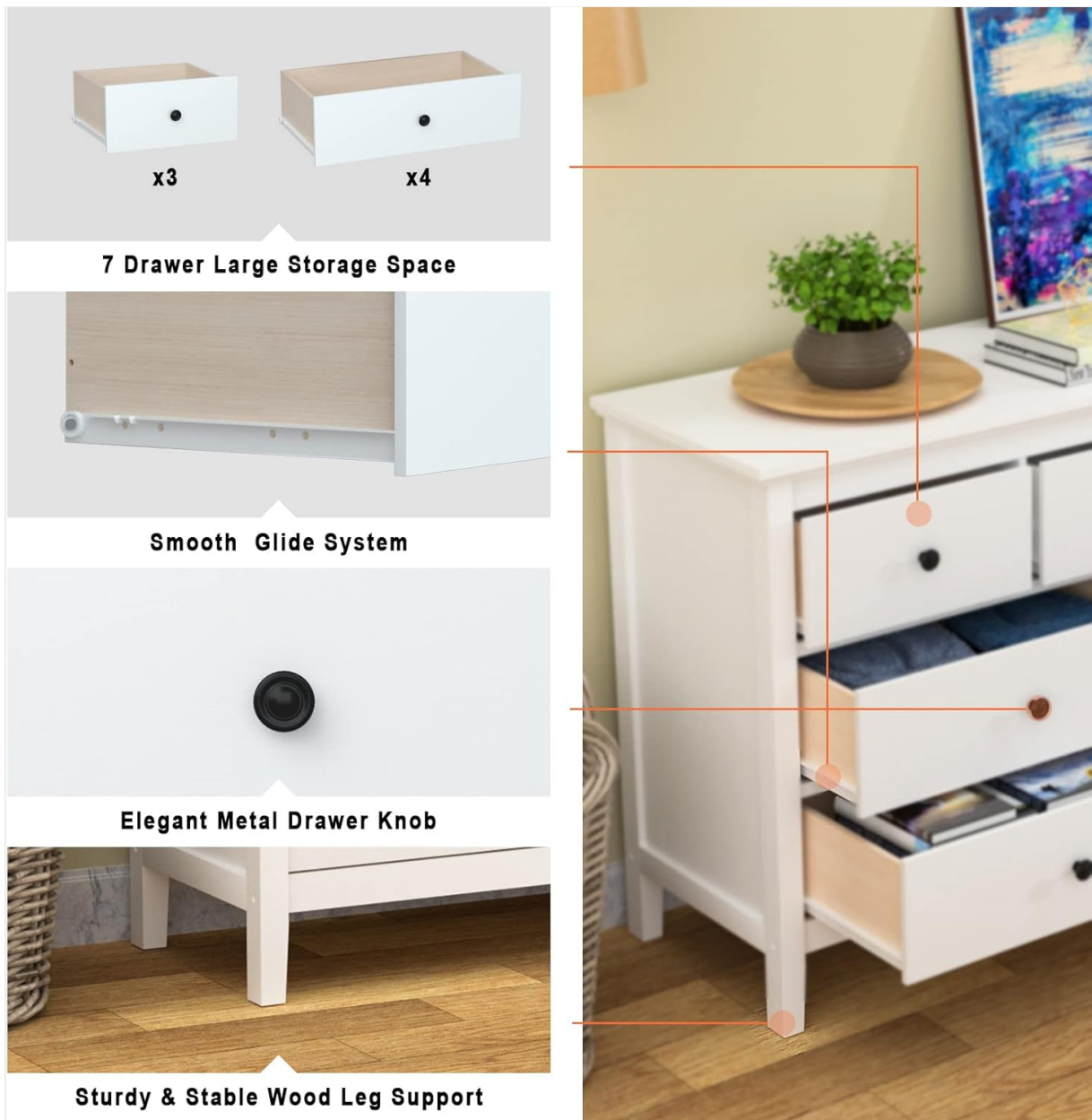
Image 5.1: The dresser with several drawers open, showcasing storage capacity.