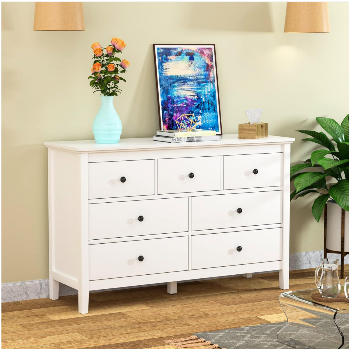
Image 1.1: The CARPETNAL White 7-Drawer Double Dresser in a bedroom setting.