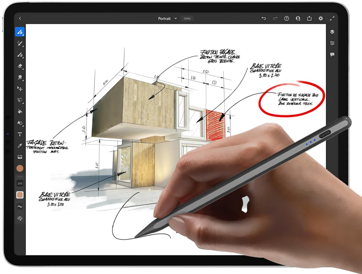
Figure 6: Magnetic attachment of the stylus to an iPad.