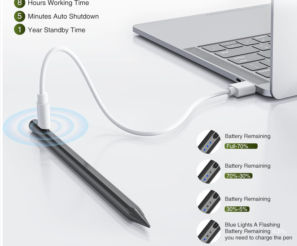
Figure 3: Stylus Pen charging and power display indicators.