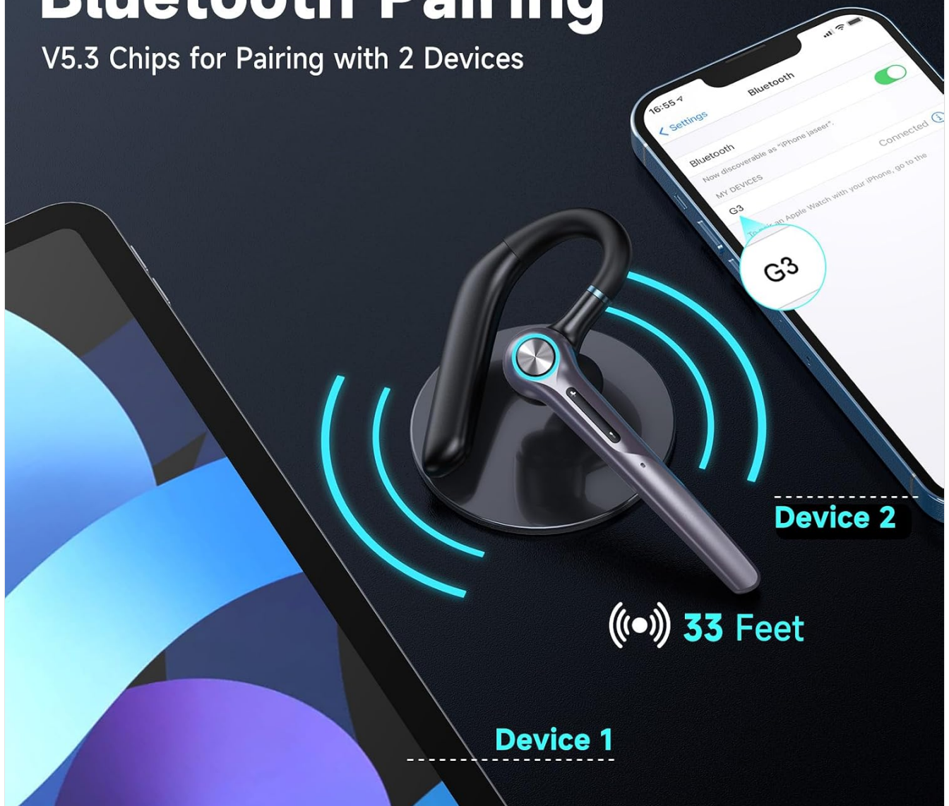
Image: Dual Device Bluetooth Pairing with V5.3 chips.