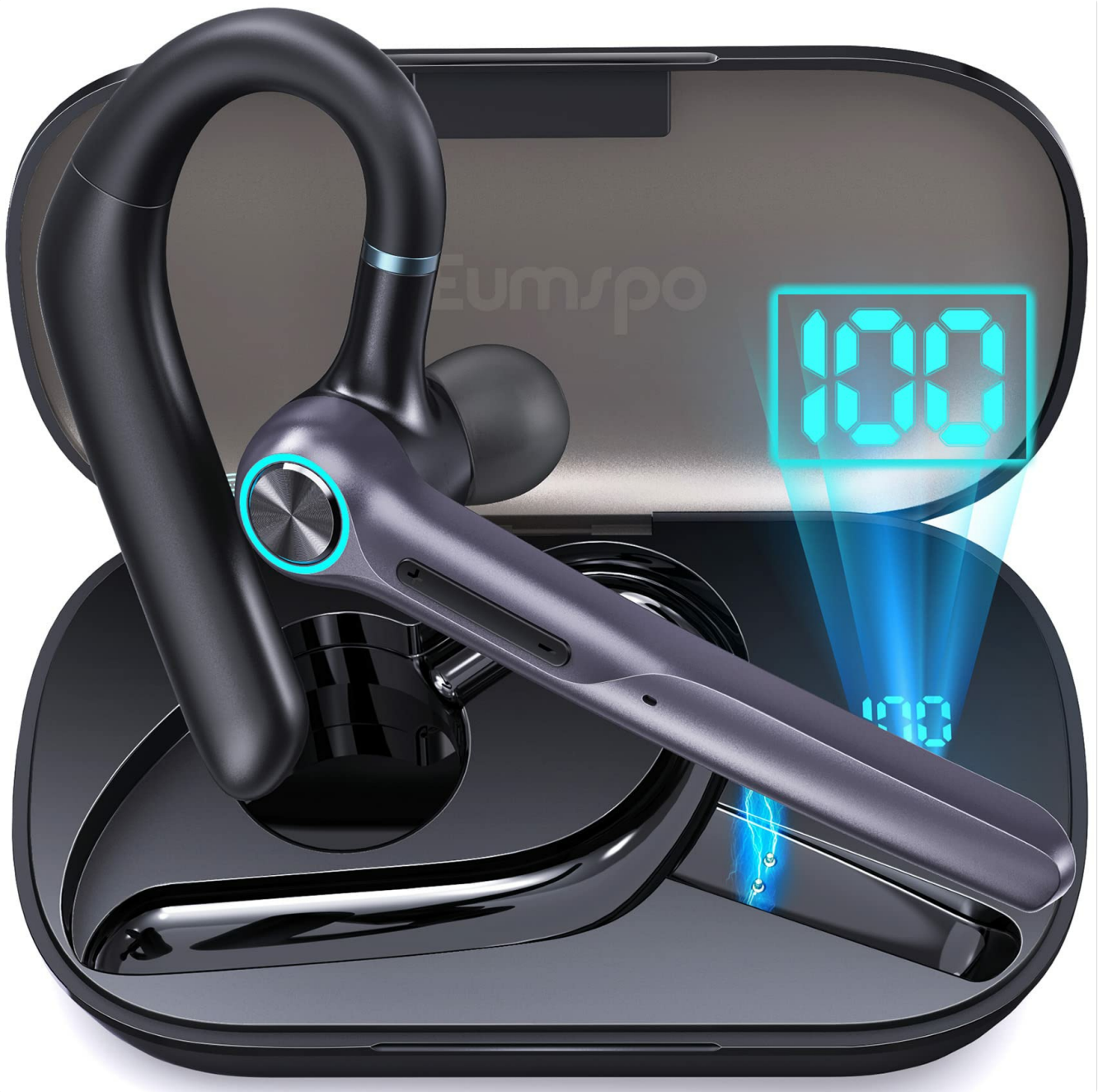
Image: Noise Cancelling Headset with Dual-Mic technology.