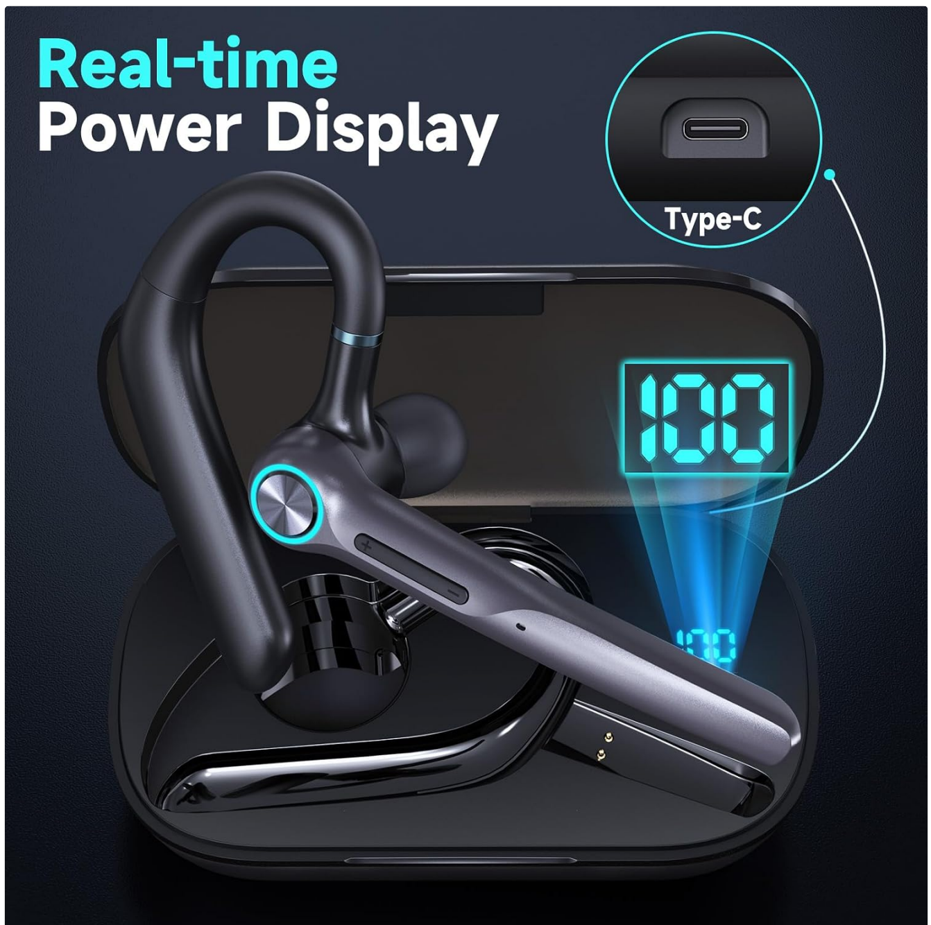
Image: Headset Features Showcase - MFB button, Power, Volume, and Dual Mic Noise Cancelling.

Familiarize yourself with the main components and controls of your Eumspo G3 headset.