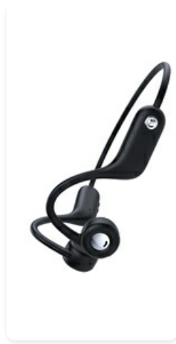
Image: A close-up view of the magnetic charging pins located on the side of the GenXenon X7 headphones, showing the contact points for the charging cable.