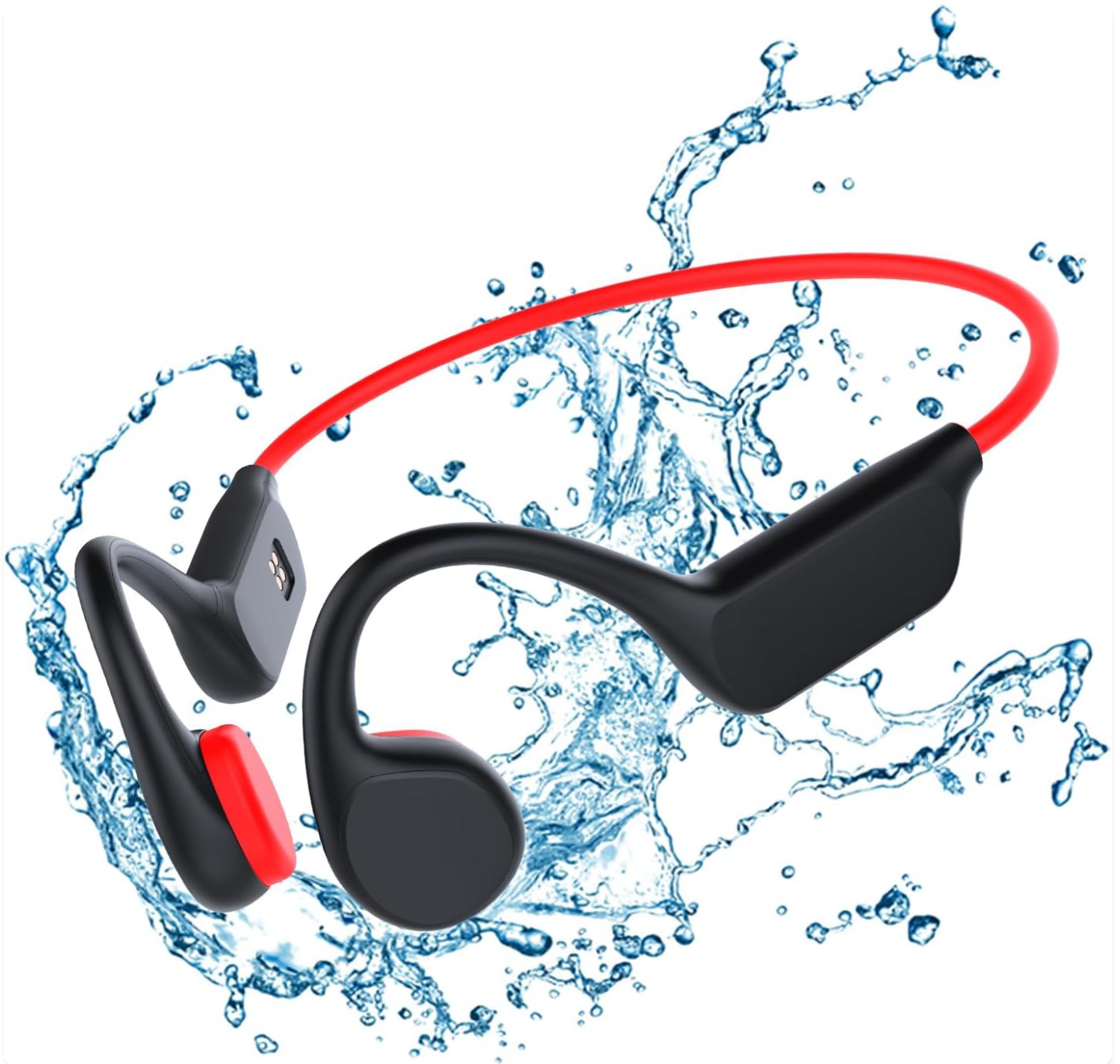
Image: GenXenon X7 Bone Conduction Headphones, black with a red band, surrounded by water splashes, highlighting its waterproof feature.