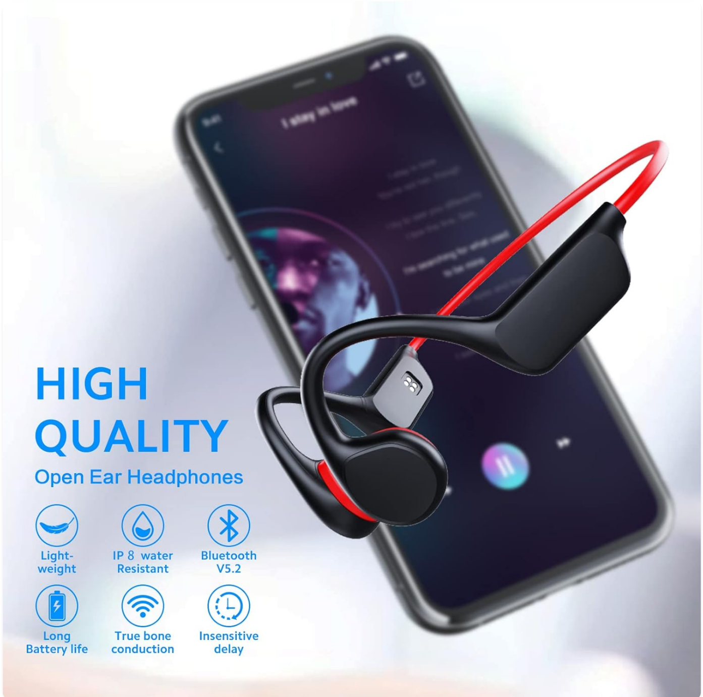
Image: The GenXenon X7 headphones displayed next to a smartphone, illustrating key features such as lightweight design, IPX8 water resistance, Bluetooth V5.2, long battery life, true bone conduction, and insensitive delay.