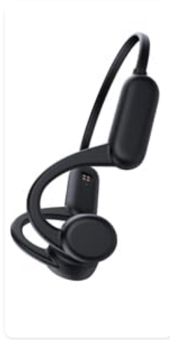
Image: A side profile view of the GenXenon X7 headphones positioned on a head model, demonstrating the open-ear design and how the bone conduction transducers rest near the ear.

3. Adjust for a snug and comfortable fit. The lightweight design ensures stability during various activities.