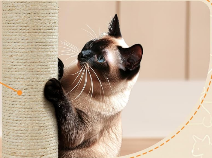
Natural Sisal Rope