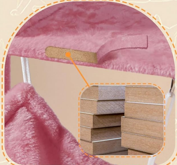
Durable Particle Board