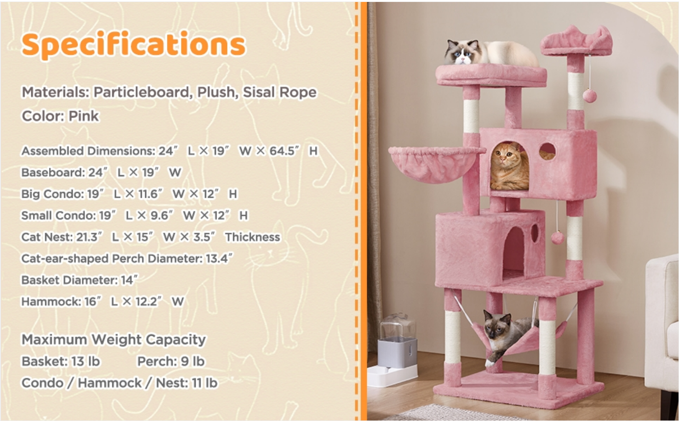
Figure 7: Diagram illustrating the key dimensions and weight capacities for various components of the cat tree.