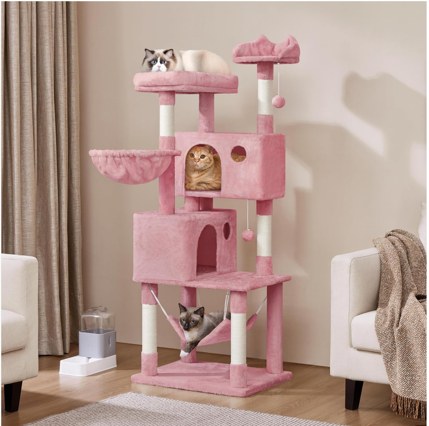
Figure 4: A cat utilizing the top perch for rest, demonstrating the comfort and utility of the elevated platforms.