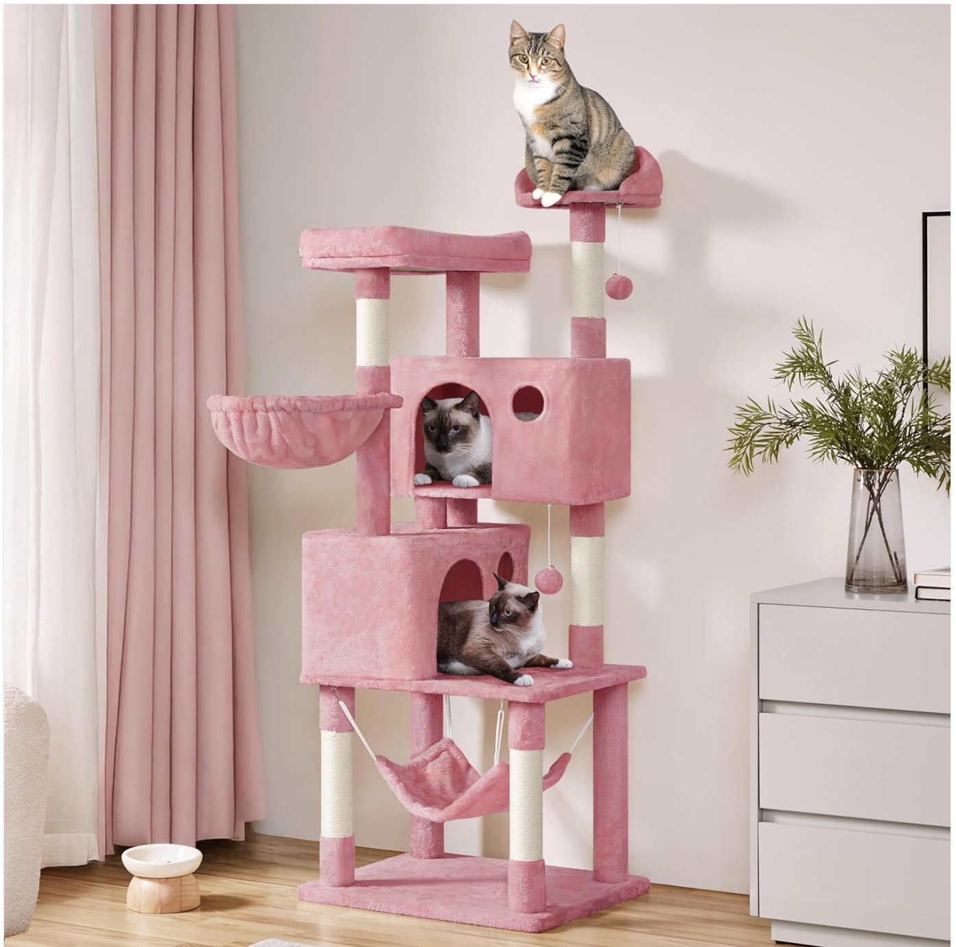
Figure 3: The completed cat tree, showcasing its various features like condos, perches, and hammock.