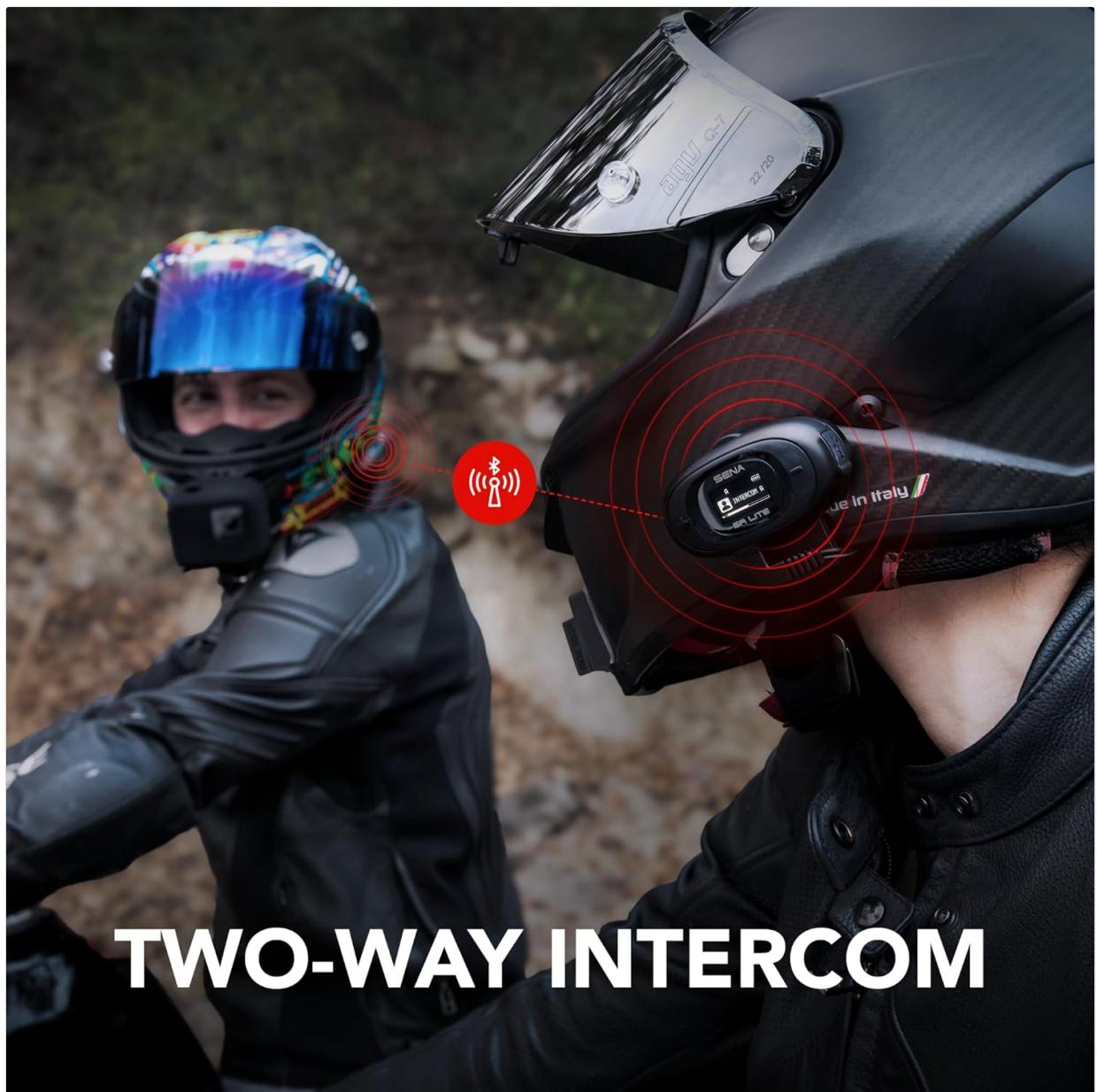
Image: Two riders communicating with Sena 5R LITE intercoms. The image illustrates the two-way intercom feature between two motorcycle riders.