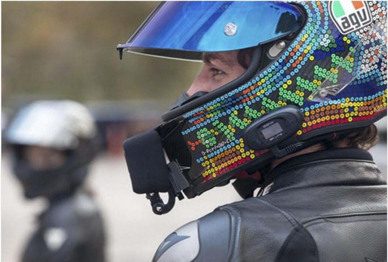
Image: Sena 5R LITE main unit mounted on a motorcycle helmet. The unit is attached to the side of a helmet, with the boom microphone positioned near the rider's mouth.

Video: Sena 10S Helmet Installation. This video provides a general guide for installing a Sena communication system on a helmet, which is applicable to the 5R LITE.