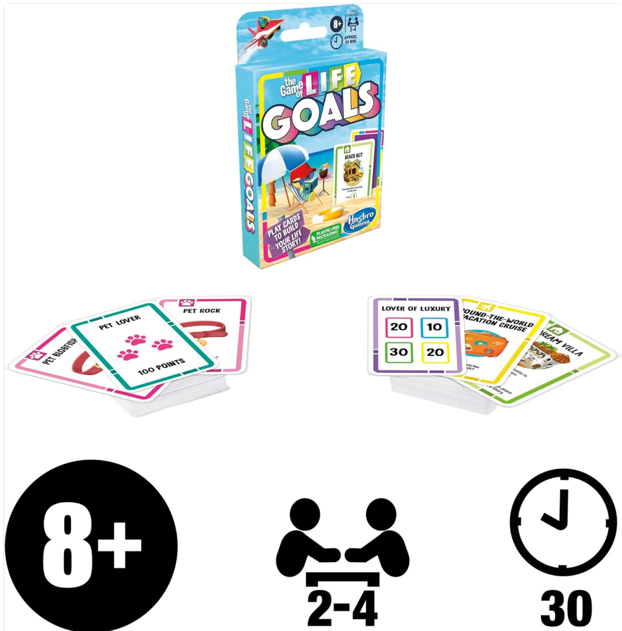
Image 3.1: The game box displayed alongside icons indicating the recommended age of 8+, player count of 2-4, and an approximate game duration of 30 minutes.