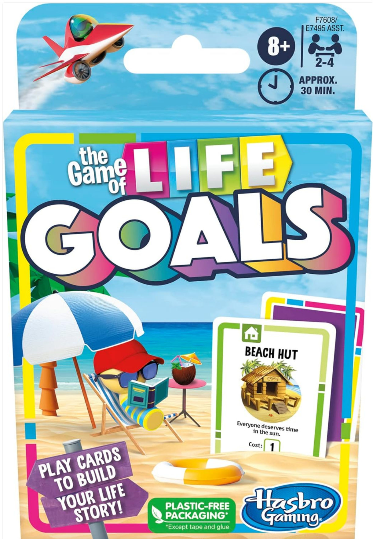
Image 1.1: The front of The Game of Life Goals card game box, showing game title, age recommendation (8+), player count (2-4), and approximate play time (30 min).

Players navigate life's choices, aiming to align their decisions with their secret Lifestyle card and public Life Goals to maximize their score. The game encourages strategic card play and lighthearted storytelling.