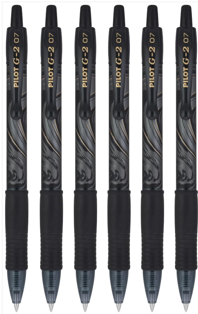
Image: A pack of six PILOT G2 Mineral Art Collection pens, showcasing their black ink and unique marbled barrel designs.