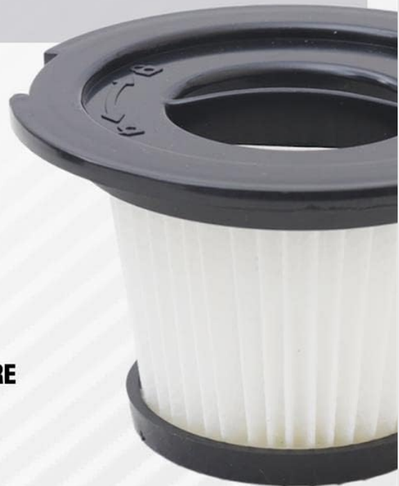
Figure 6.1: The dustbin and filter components, showing how they can be separated for cleaning.

CONTENITORE RACCOGLI POLVERE TRASPARENTE