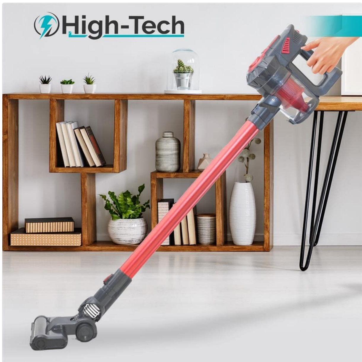
Figure 1.1: The High-Tech 120W Wireless Multicyclonic Vacuum Cleaner in stick mode, ready for use.