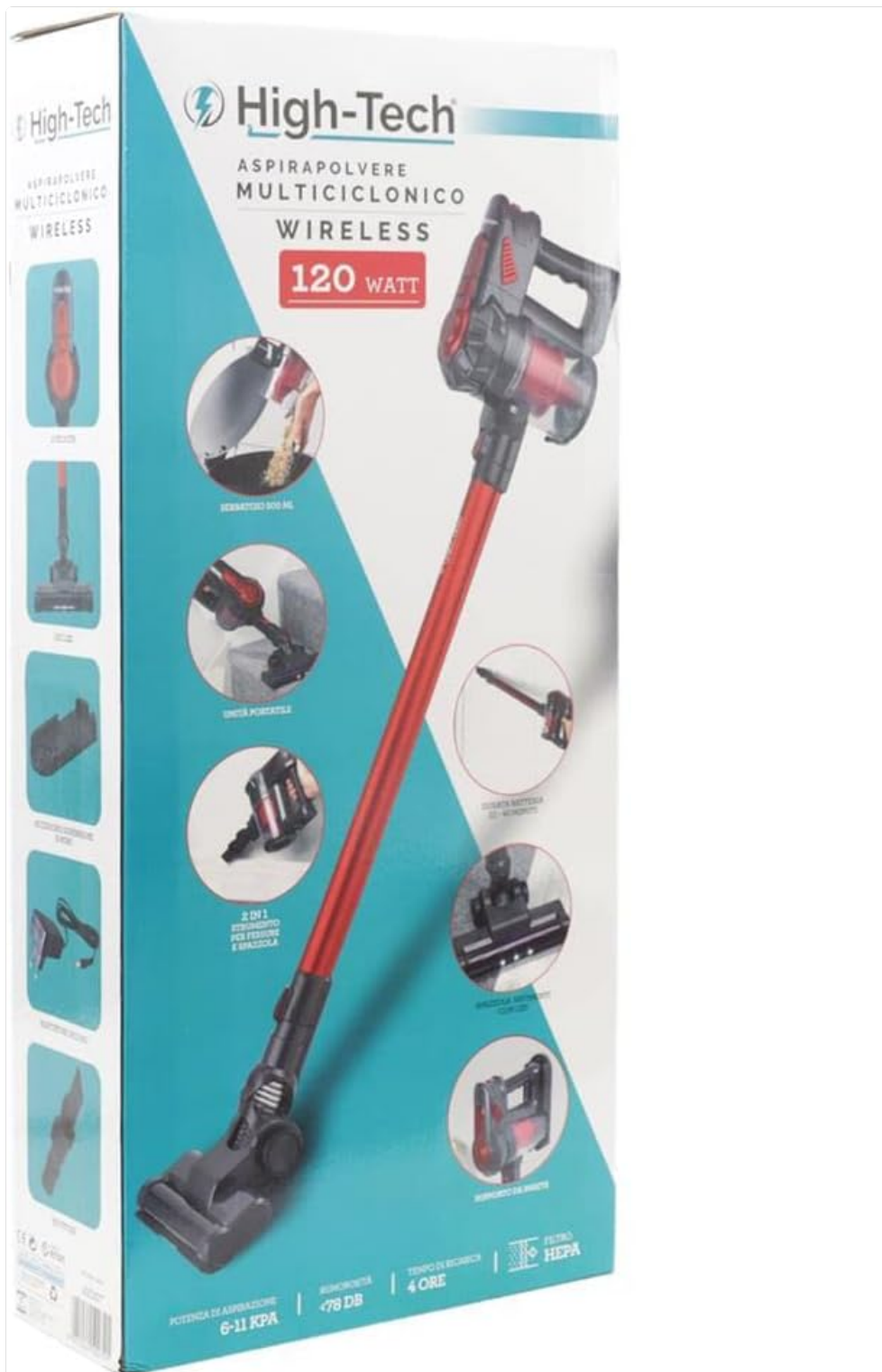
Figure 6.2: Detail of the washable multicyclonic HEPA filter and the transparent dust collector.