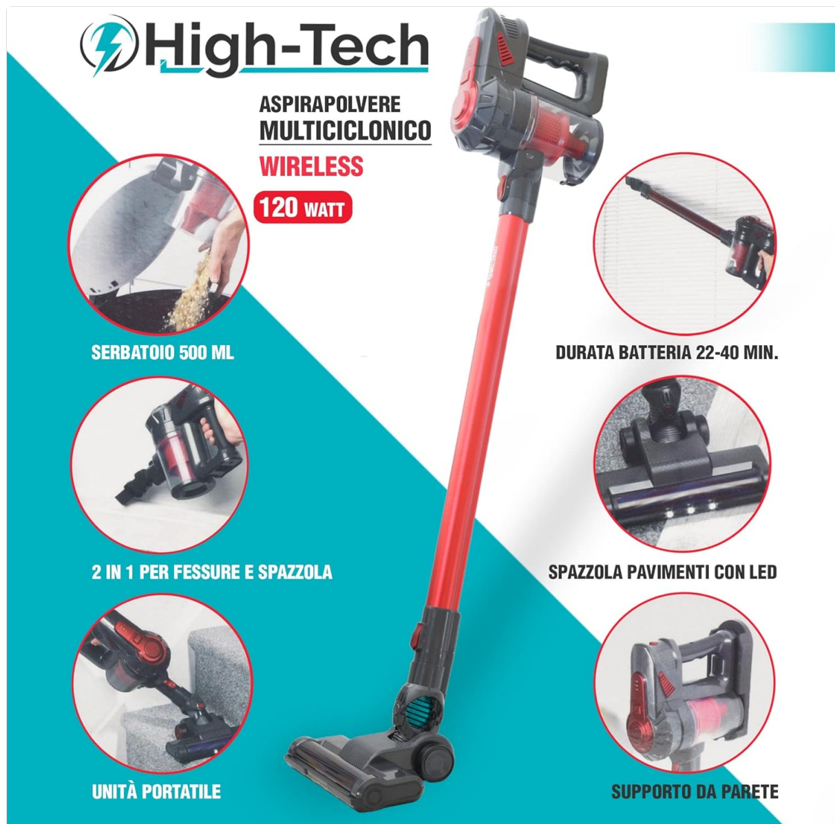
Figure 4.1: The vacuum cleaner can be configured as a stick vacuum or a handheld unit, and includes a wall mount for storage.