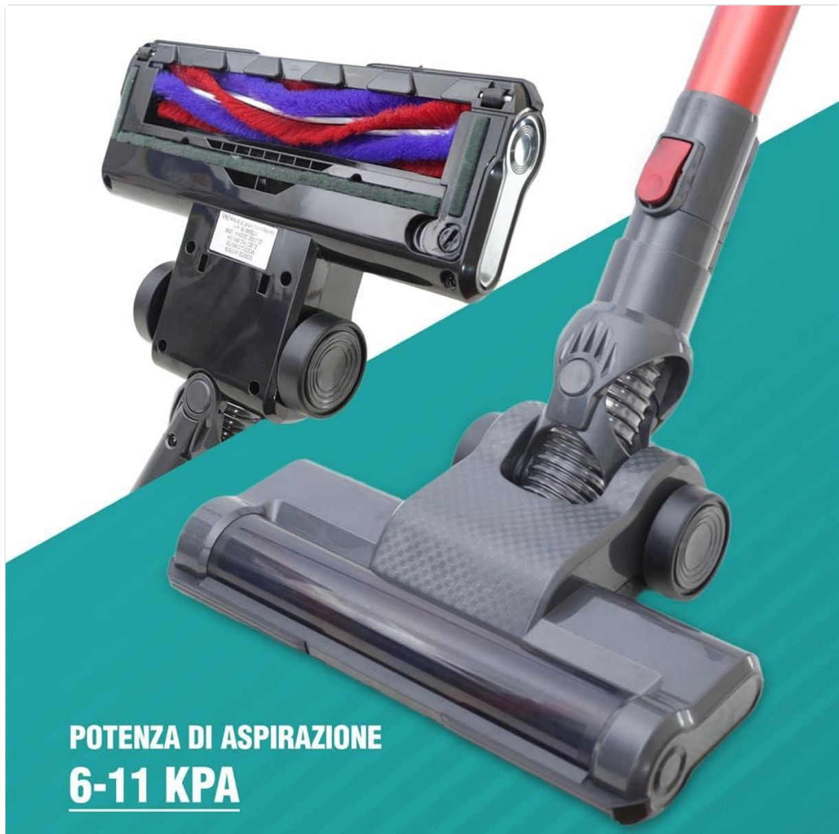
Figure 3.1: Included components: Main unit, adapter, 2-in-1 tool, wall mount, and floor brush with LED lights.