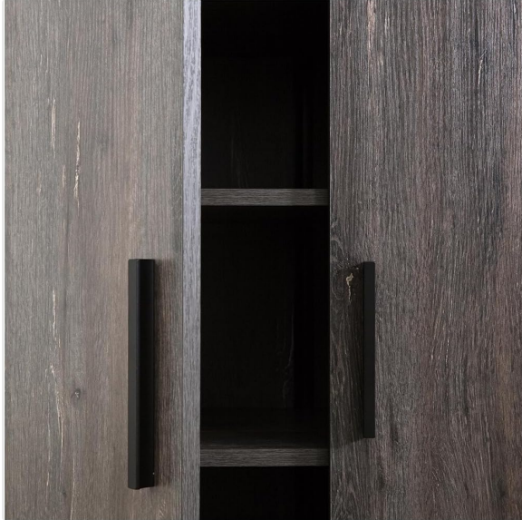
Image: Close-up of the cabinet door and handle. This detail highlights the rustic gray finish and the design of the door handle, demonstrating the soft-close mechanism.