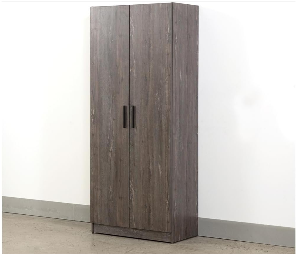
Image: Fully assembled Klair Living Mia Farmhouse Wood Shoe Cabinet. This image shows the overall appearance of the cabinet once assembly is complete, featuring its rustic gray finish and two vertical doors.