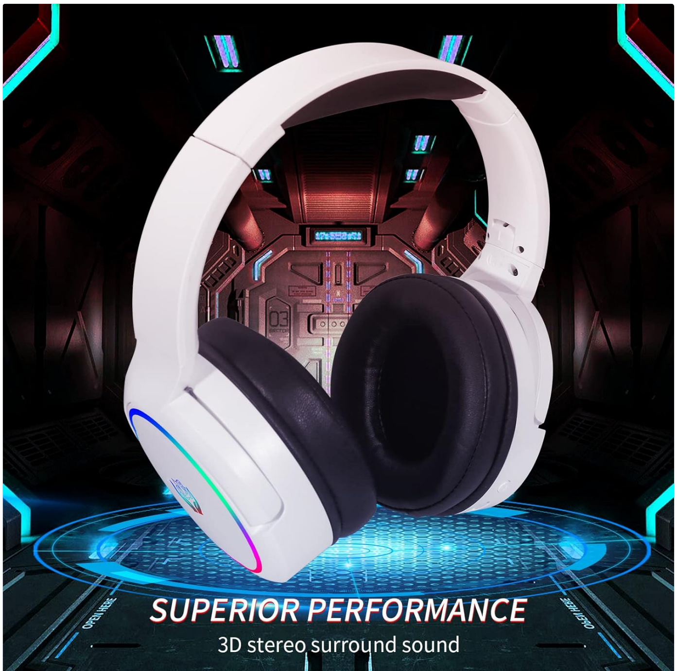
Image 4.3: The headset in use, emphasizing its superior performance and 3D stereo surround sound capabilities.