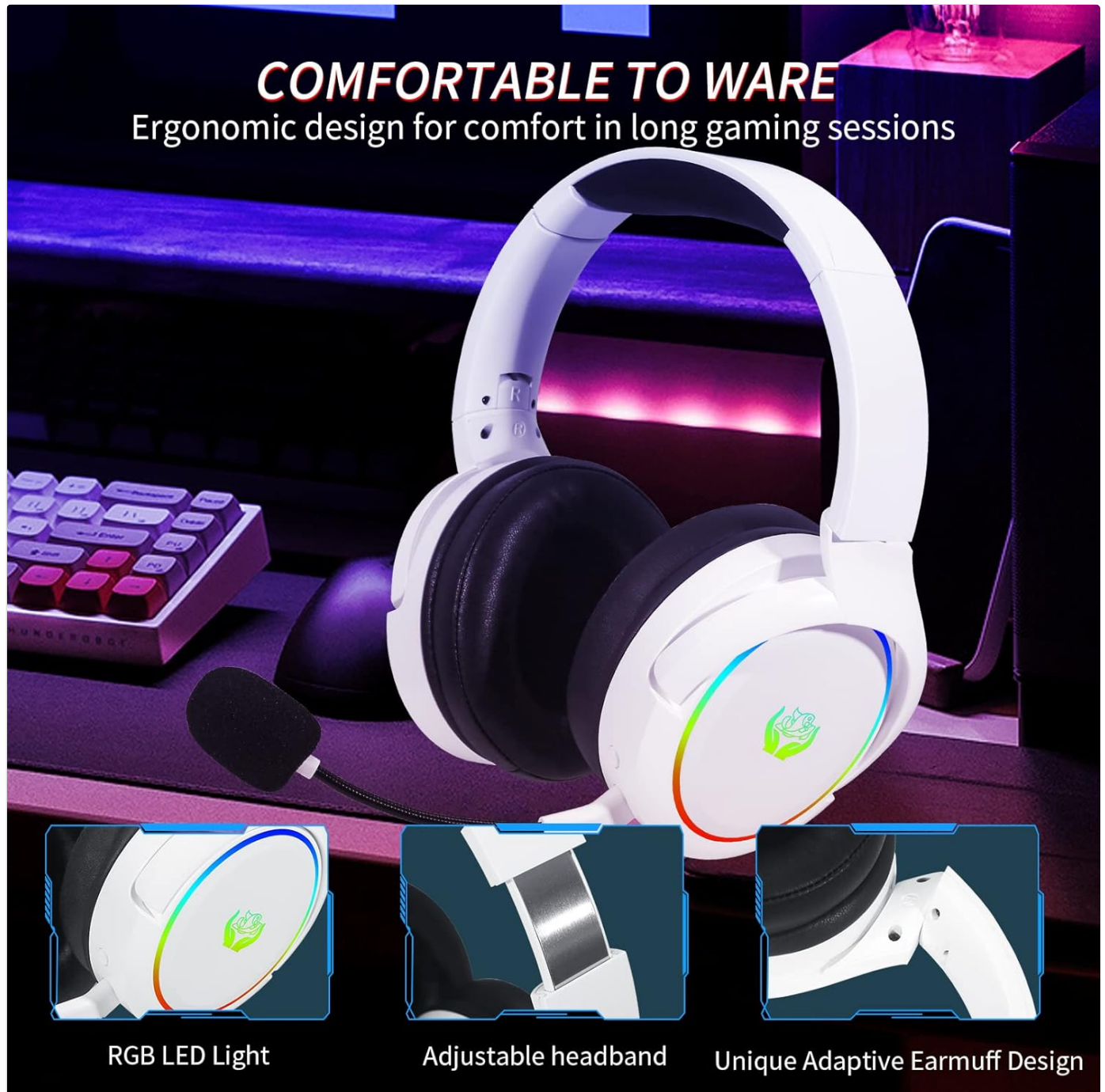
Image 4.2: Close-up view of the headset highlighting the RGB LED light, adjustable headband, and adaptive earmuff design for comfort.

The X-PRO headset is designed for comfort during long gaming sessions. It features an adjustable headband to fit various head sizes and foldable earcups for portability and convenient storage. The earmuffs are made of soft protein leather for breathability and comfort.