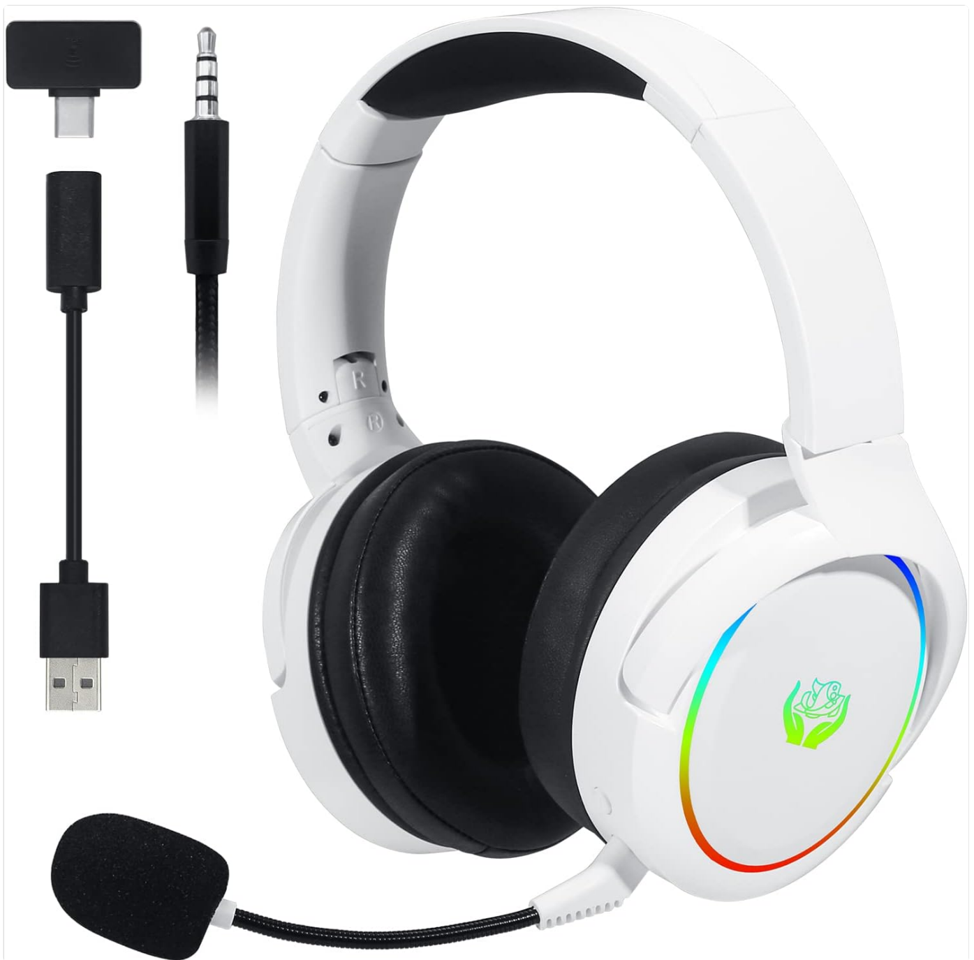
Image 1.1: The HUO JI X-PRO Wireless Gaming Headset shown with its USB-C dongle, USB-A adapter, and 3.5mm audio cable.