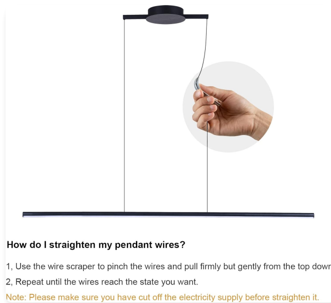
Image 4.3: Illustration demonstrating the use of a wire scraper to gently pull and straighten the pendant wires from top to bottom.