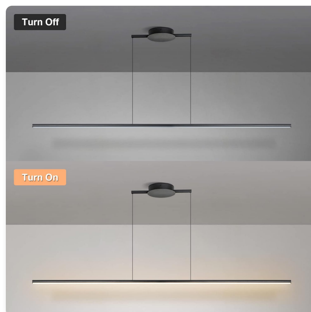
Image 5.1: A visual comparison showing the pendant light fixture when turned off (top) and when illuminated with warm

Operate the light using a standard wall switch connected to the fixture's circuit. The fixture is designed to respond to a push-button type switch.