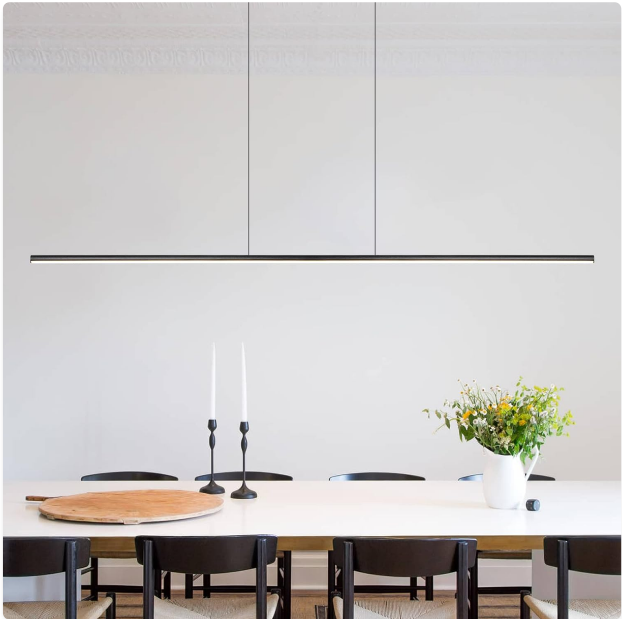
Image 1.1: The Zicbol linear LED pendant light fixture installed above a dining table, showcasing its sleek design and warm illumination.