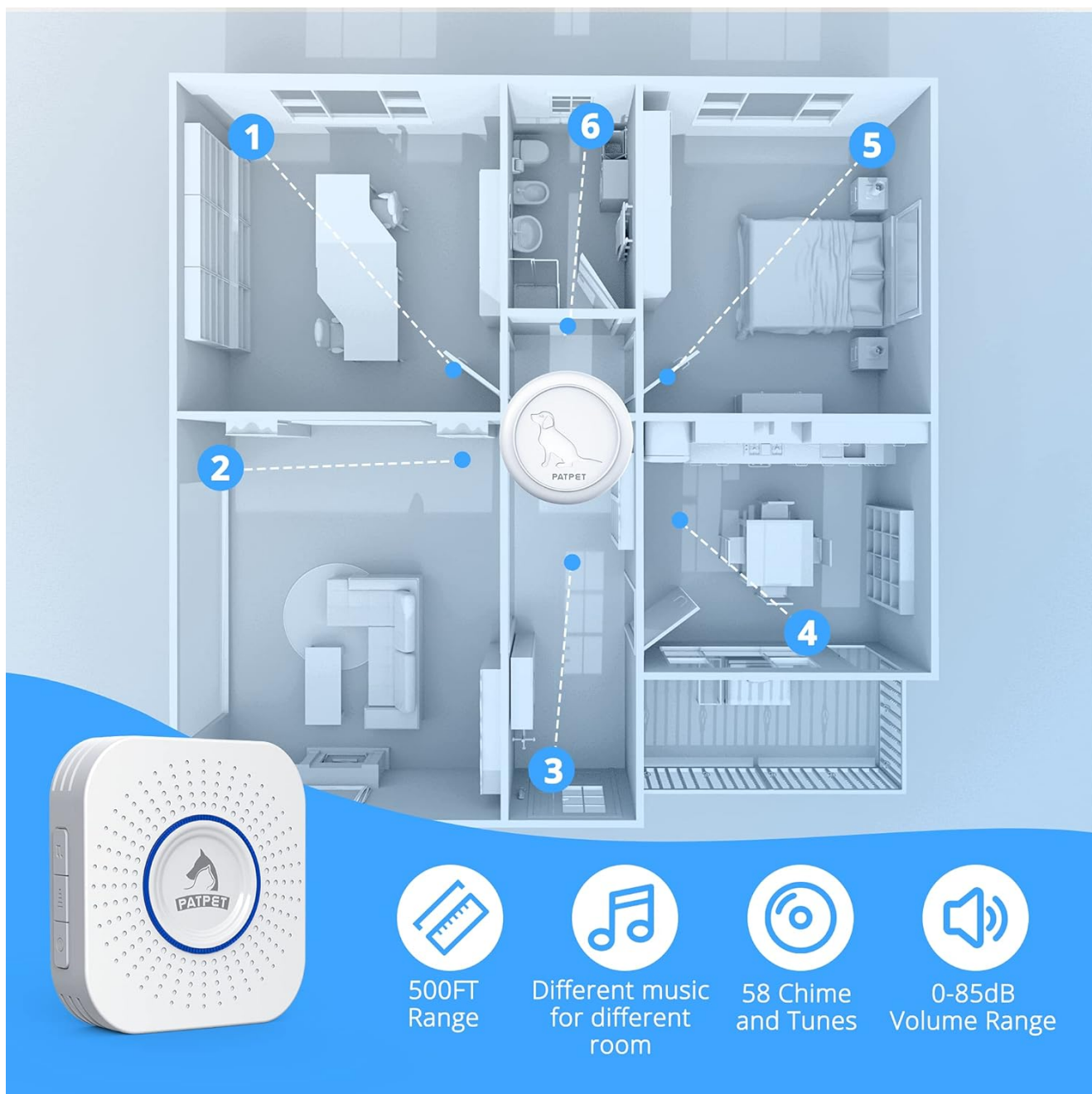
Image: A floor plan illustrating the 500ft operating range of the doorbell, showing its ability to cover multiple rooms within a home.