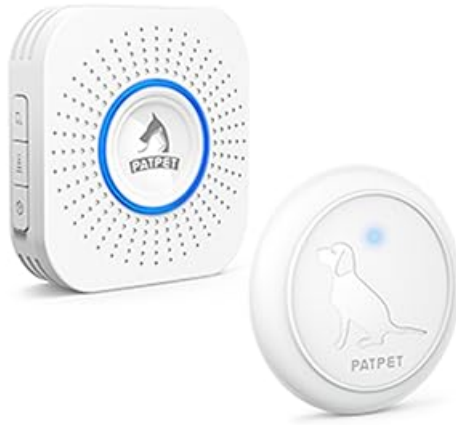
Image: The PATPET receiver and transmitter shown together, highlighting their compact design.