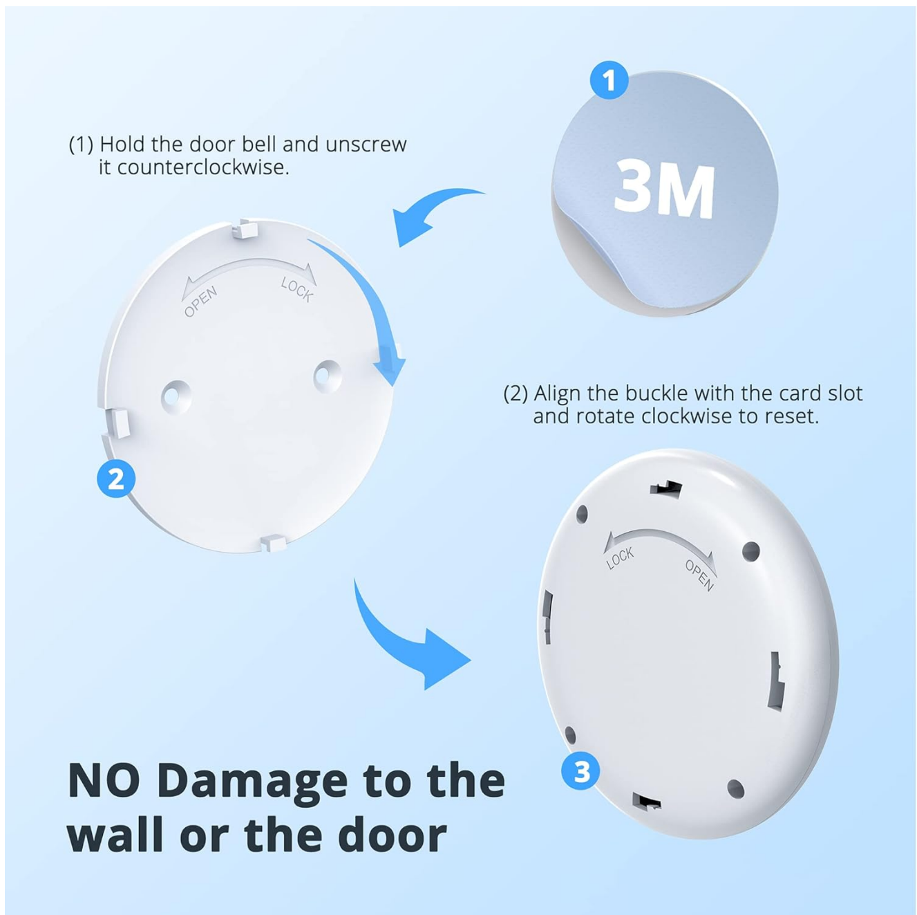
Image: A visual guide demonstrating how to detach the transmitter from its mounting base by twisting counter-clockwise.