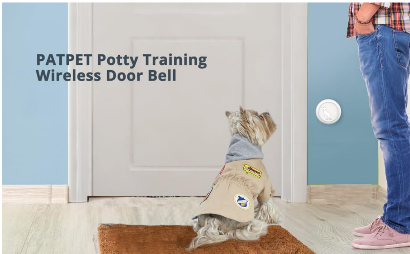
Image: A dog patiently waiting by a door, with the PATPET wireless doorbell visible on the wall, illustrating its use for potty training.

The PATPET Wireless Dog Doorbell is designed to assist in potty training your dog by providing a clear and consistent signal when your dog needs to go outside. This system includes a waterproof touch button transmitter and a plug-in receiver with multiple melody and volume options. Its robust design ensures reliable performance in various home environments.