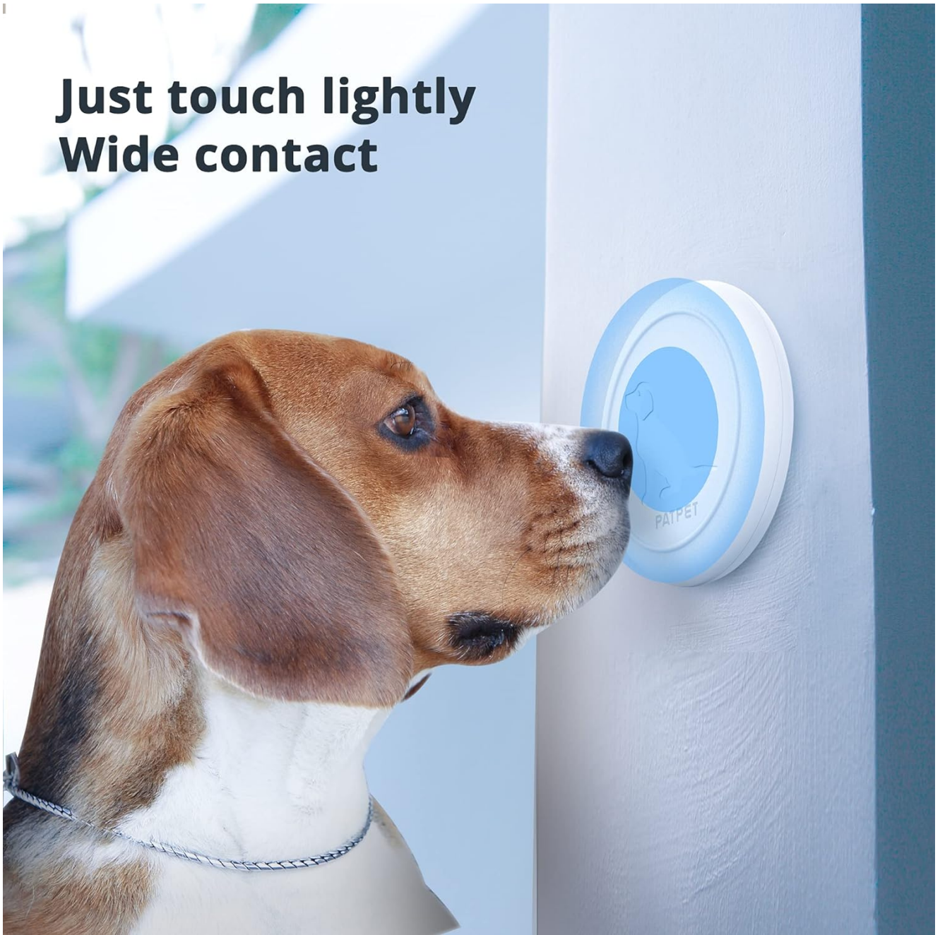
Image: A dog interacting with the PATPET doorbell transmitter, demonstrating the touch activation feature.