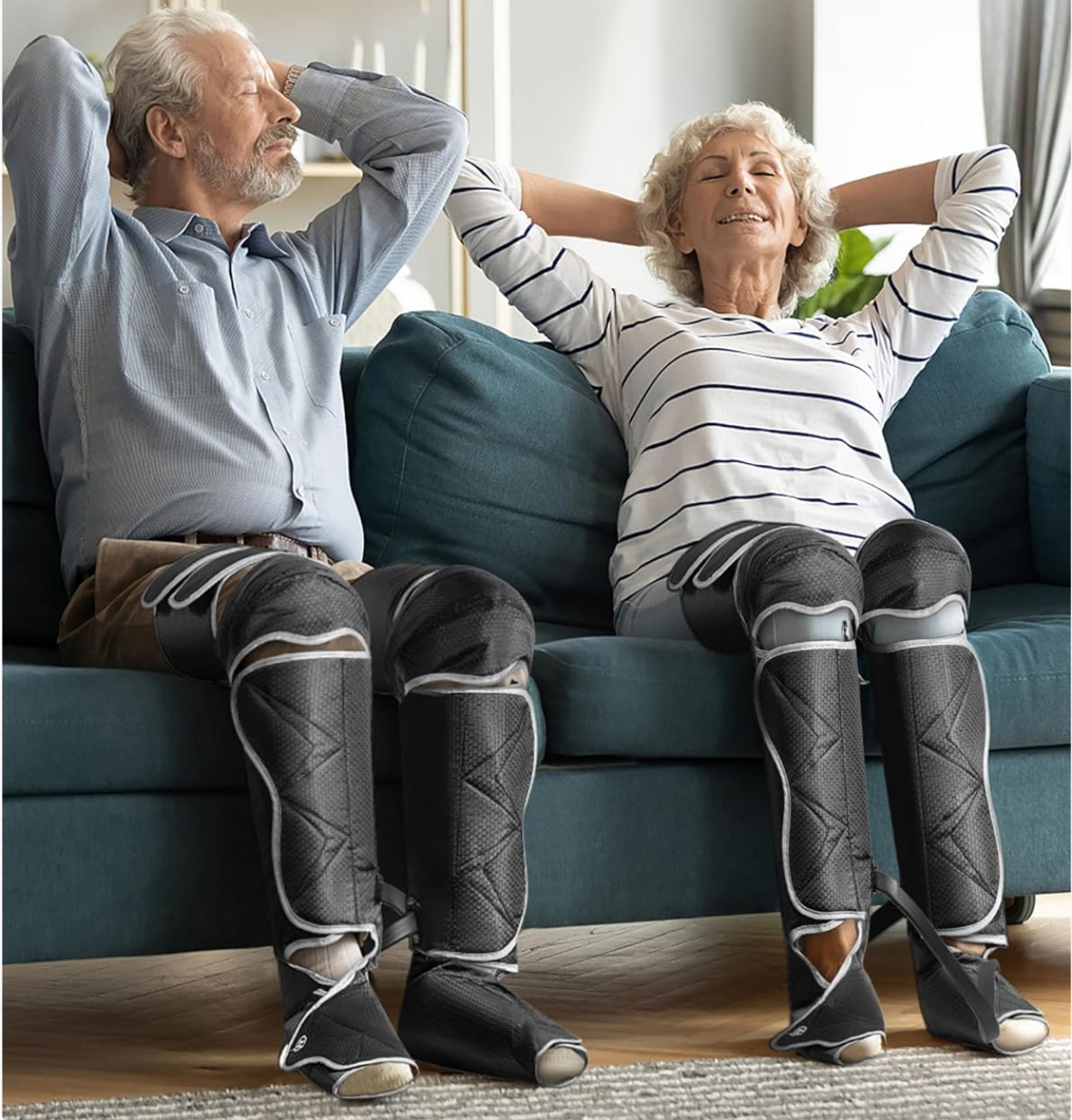
Image 1: The ALLJOY AJFLM22 Leg Massager, showing the main unit and leg wraps.

Linderung der Beinermüdung und Verbesserung der Durchblutung