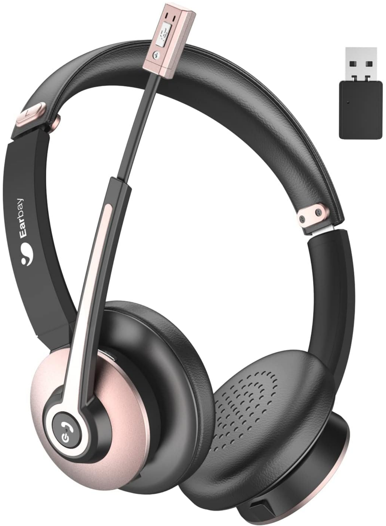
Image: Earbay Bluetooth Headset in Rose Gold color, showing the headset and USB dongle.