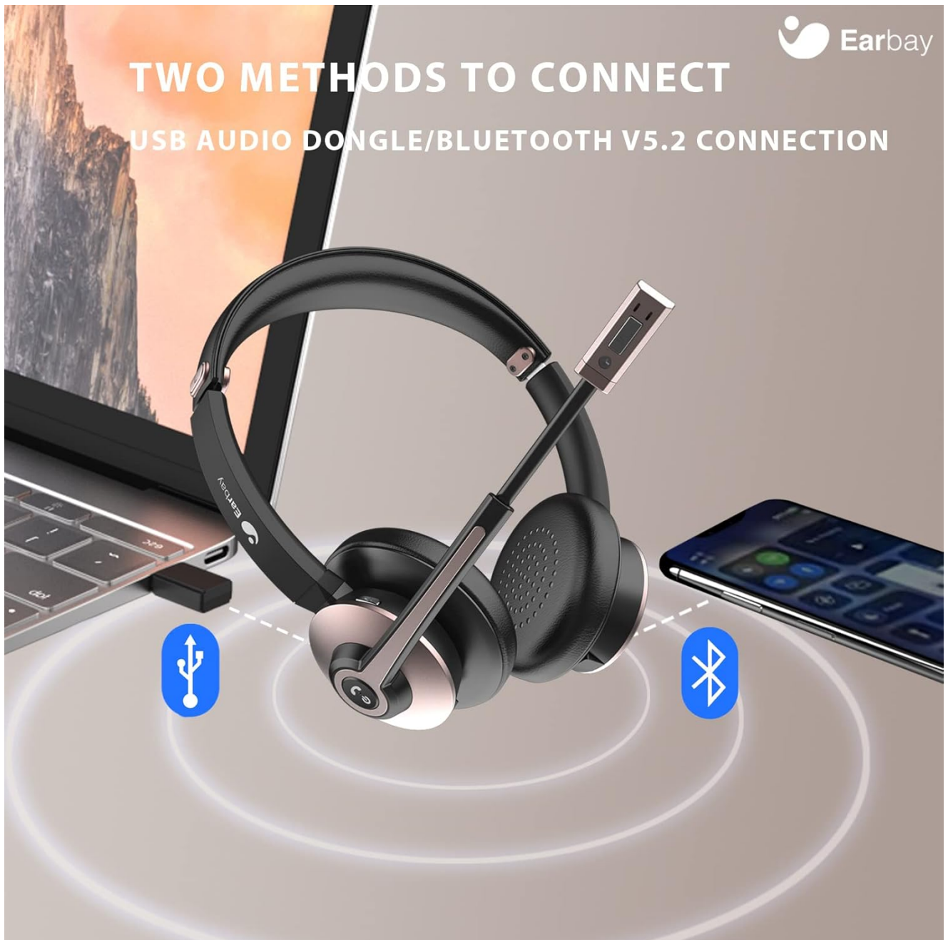
Image: Illustration showing a laptop connected via USB dongle and a smartphone connected via Bluetooth, demonstrating dual connectivity options.

For optimal performance with communication platforms like Skype or Zoom, ensure "BT68 Handsfree AG Audio" is selected in the application's audio settings.