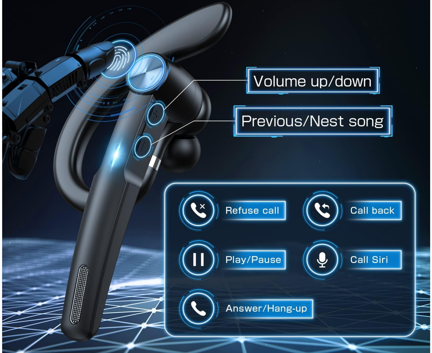
Image: A detailed diagram of the TEIMO Bluetooth Headset G1 highlighting its control buttons and their respective functions, including volume up/down, previous/next song, refuse call, call back, play/pause, call Siri, and answer/hang-up.

Touch control MFB button with 2 mechanical buttons make operation easier