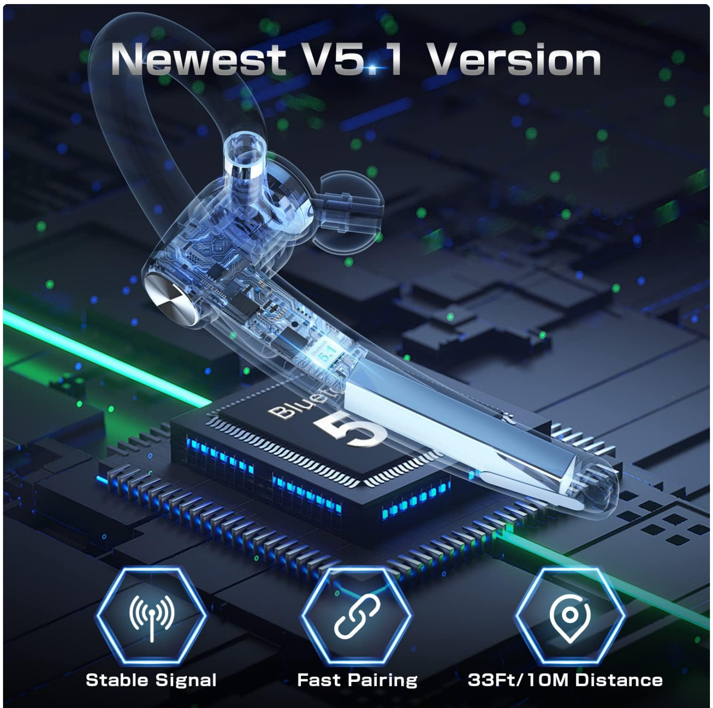
Image: An illustration highlighting the V5.1 Bluetooth technology of the TEIMO G1 headset, emphasizing stable signal, fast pairing, and a 33ft/10m connection distance.