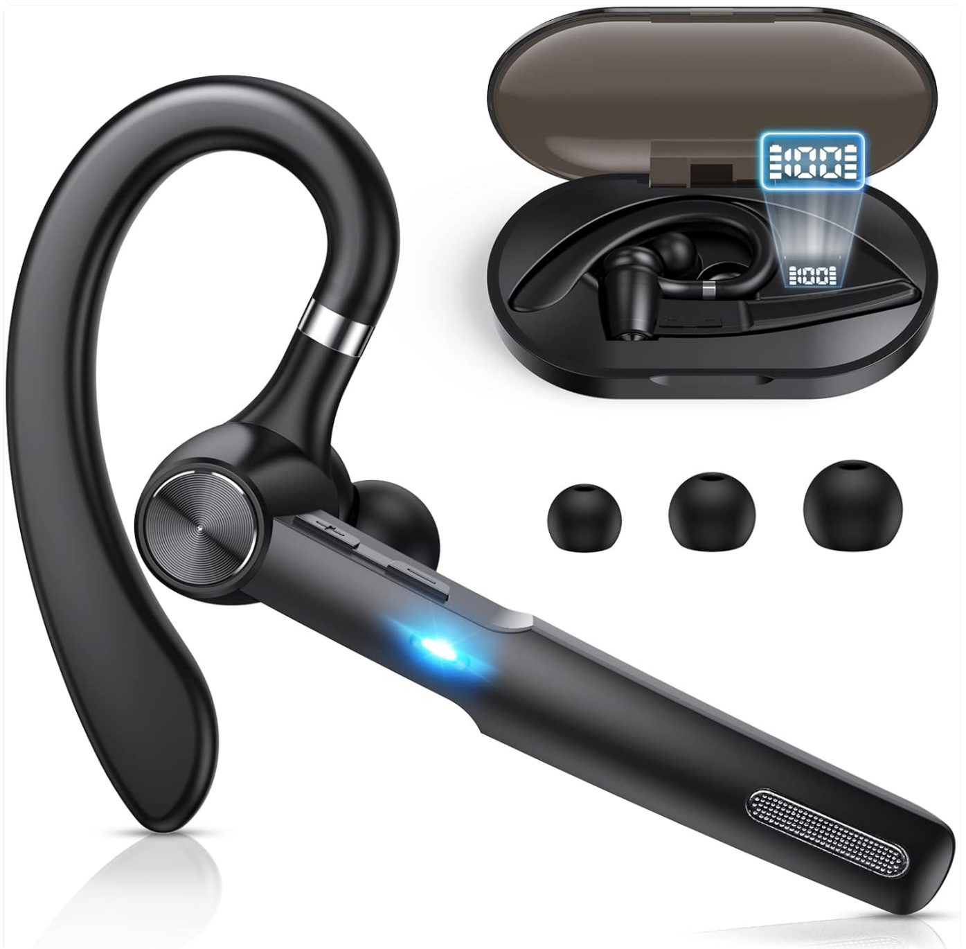
Image: The TEIMO Bluetooth Headset G1, showcasing the earpiece and its compact charging case. The earpiece features an over-ear hook design and an in-ear bud, with the charging case displaying battery indicators.