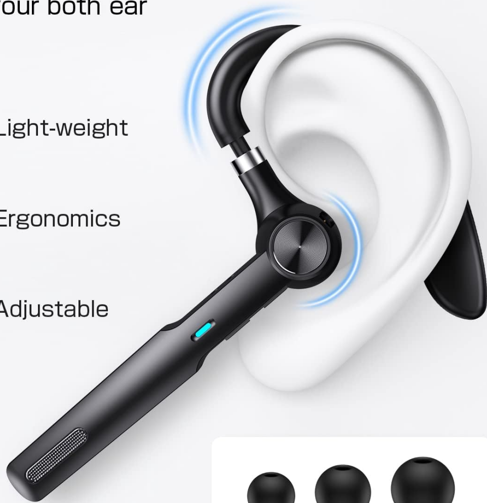
Image: The TEIMO Bluetooth Headset G1 shown alongside three different sizes of ear tips (Small, Medium, Large), highlighting the customizable fit for user comfort.