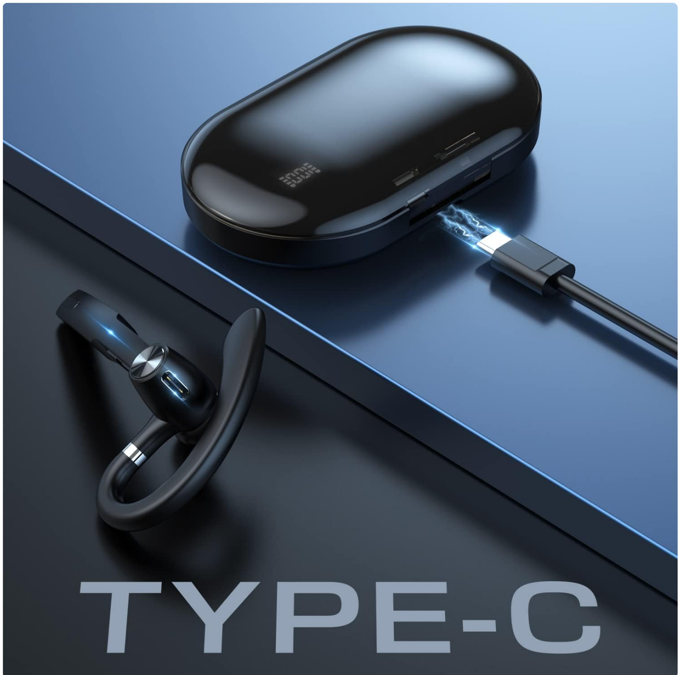
Image: The TEIMO Bluetooth Headset G1 charging case connected to a USB Type-C cable, illustrating the charging process. The headset is shown next to the case.