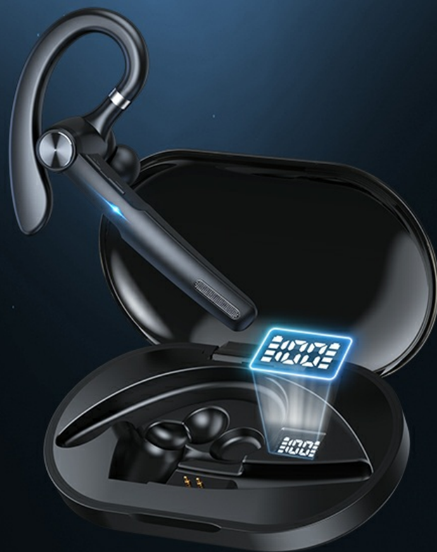
Image: A graphic illustrating the battery life of the TEIMO Bluetooth Headset G1, showing 12 hours of talking time, 10 hours of music time, and up to 55 hours of total playtime with the charging case.