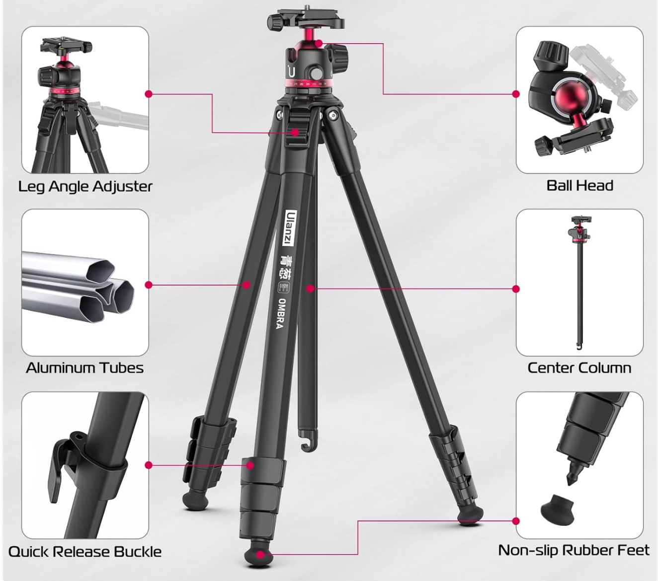
Figure 2: Key components including leg angle adjuster, ball head, aluminum tubes, center column, quick release buckle, and non-slip rubber feet.