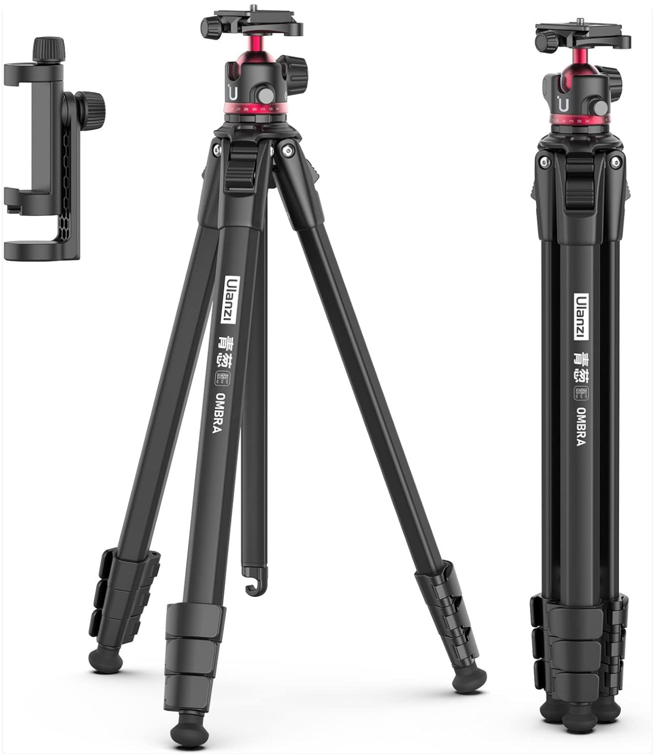
Figure 1: ULANZI MT-55 Ombra Travel Tripod with included phone holder.