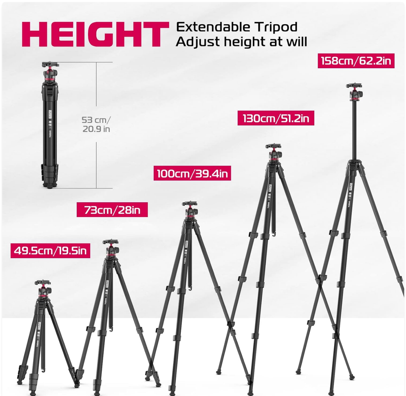
Figure 3: The tripod can be adjusted to various heights, from a folded 20.9 inches to an extended 62.2 inches.