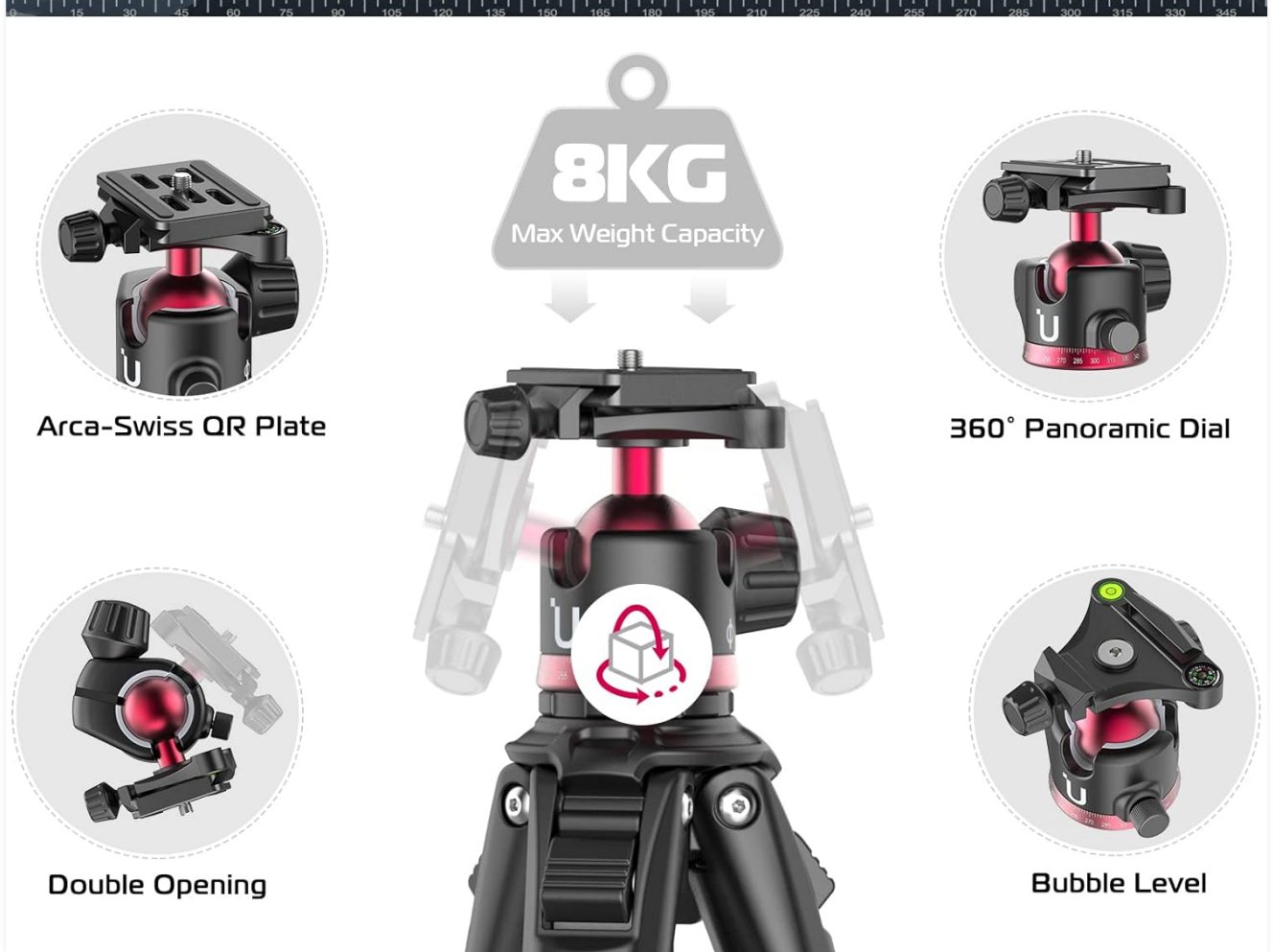
Figure 4: The ergonomic ball head features an Arca-Swiss QR plate, 360° panoramic dial, double opening for vertical/horizontal shooting, and a bubble level.

Ergonomic Ball Head Ultra-smooth & Omnidirection