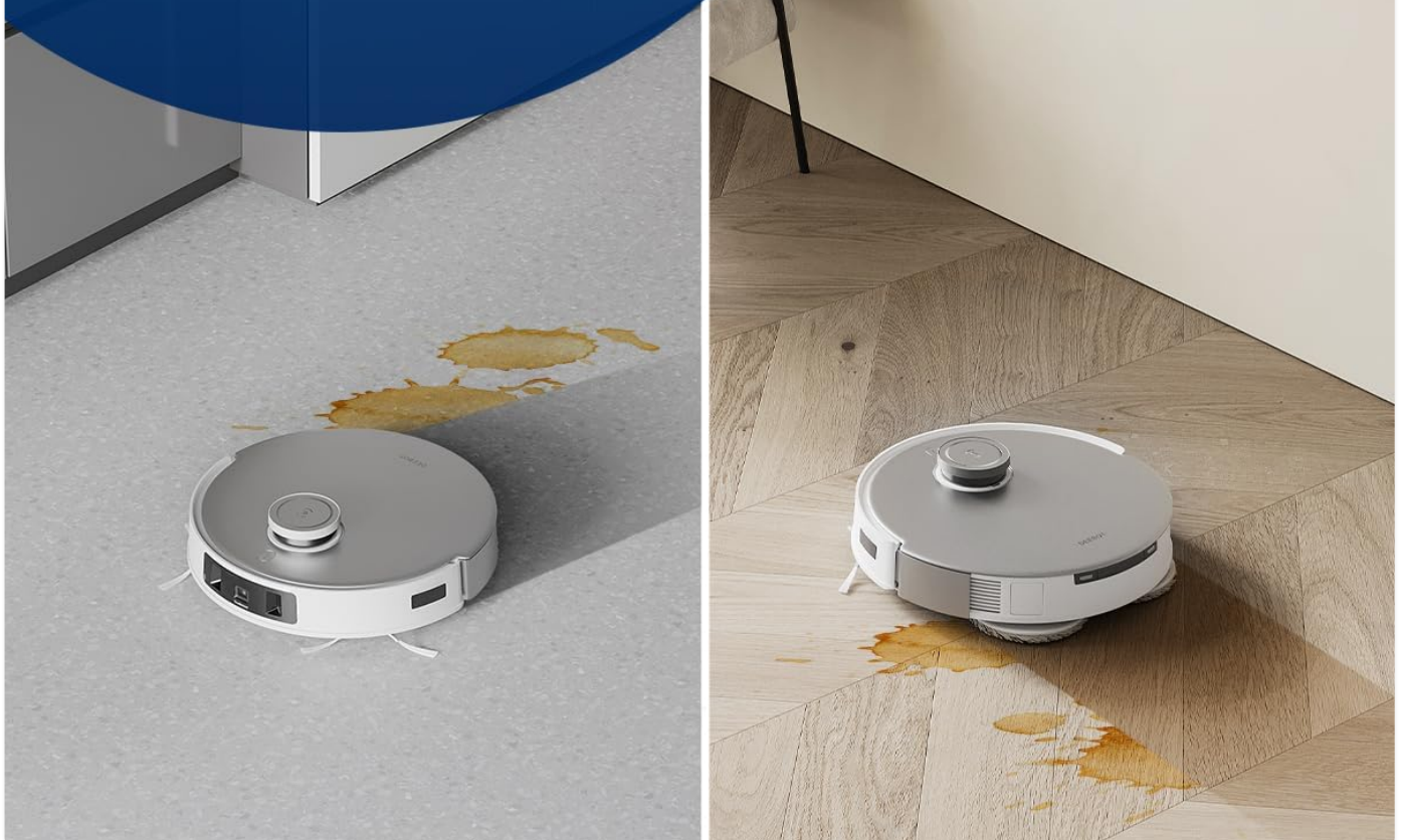
Image: The DEEBOT cleaning solution is suitable for multiple surfaces, as shown by the robot cleaning both tile and wood floors.

Comprehensive cleaning solution for entire home