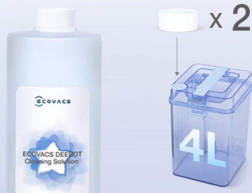
Image: Visual guide for adding two bottle caps of solution to the clean water tank.

Two bottle caps per clean for 4L water tank capacity.