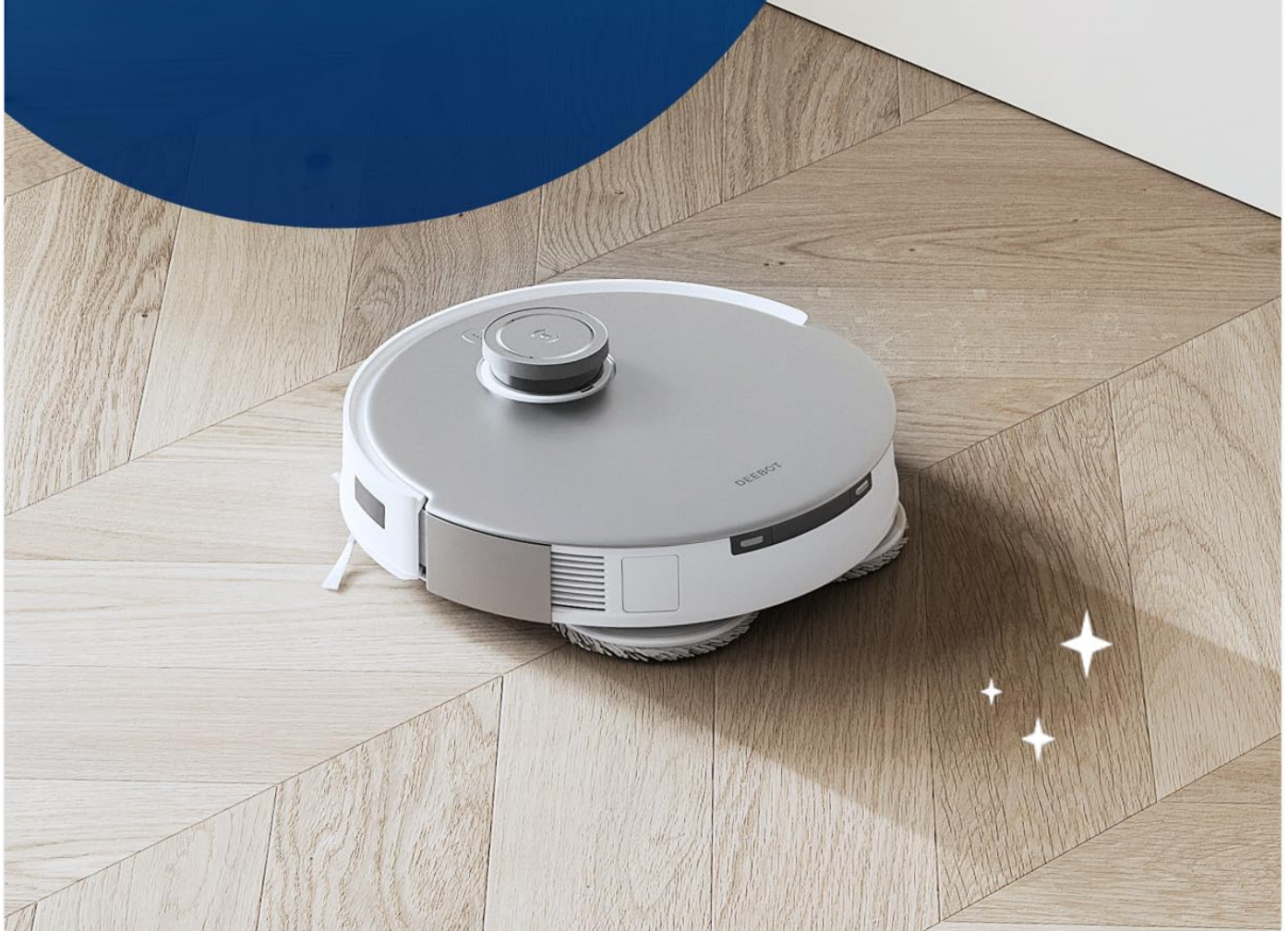
Image: A DEEBOT robot vacuum actively cleaning a wooden floor, demonstrating the solution's effectiveness.