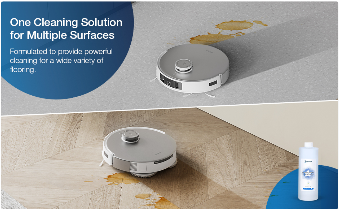
Image: The DEEBOT's self-cleaning feature ensures mop pads are clean, complementing the cleaning solution's effectiveness.

Formulated to provide powerful cleaning for a wide variety of flooring.