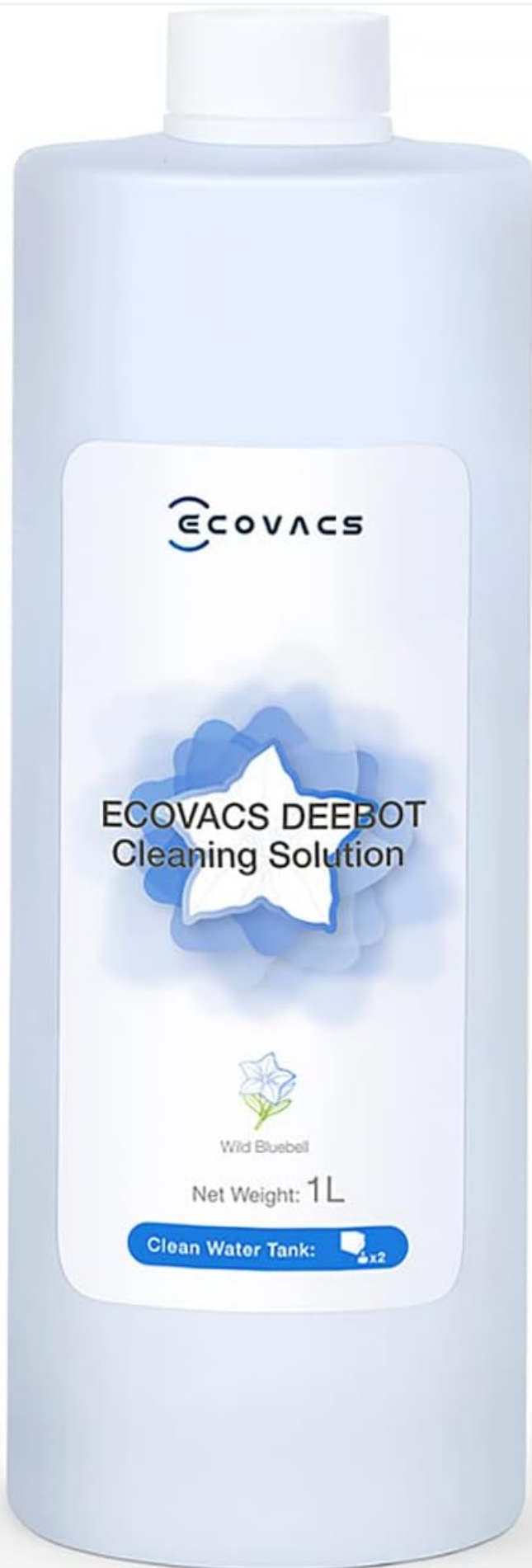
Image: ECOVACS DEEBOT Multi-Surface Floor Cleaning Solution 1L bottle.