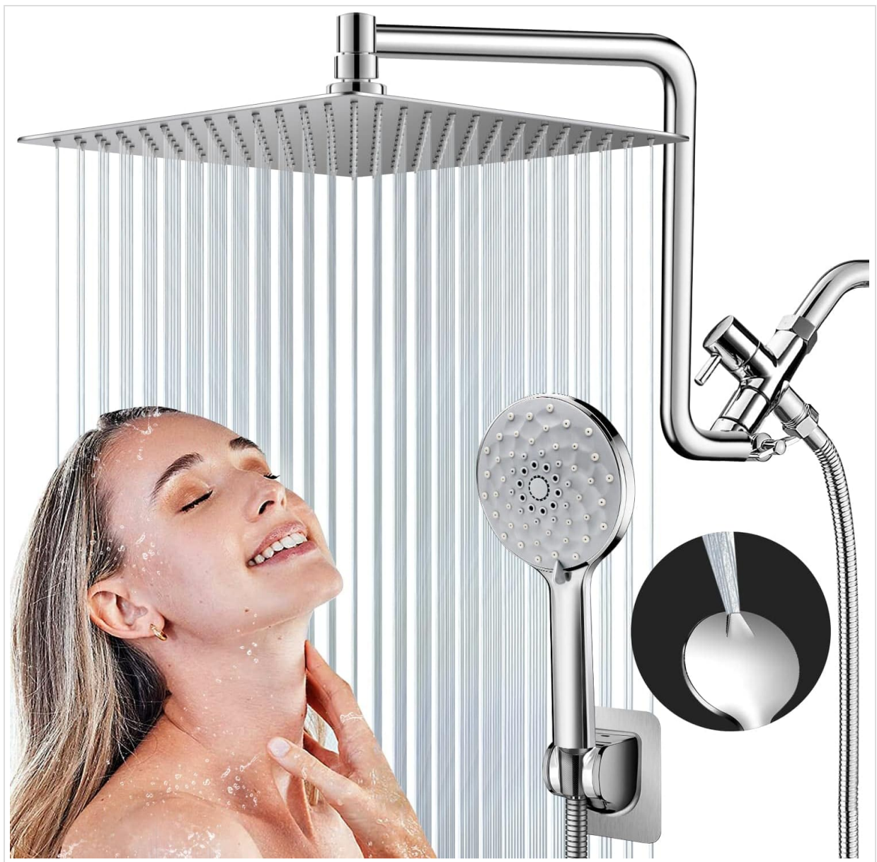
Figure 1: PinWin 12-Inch Dual Rain Shower Head System