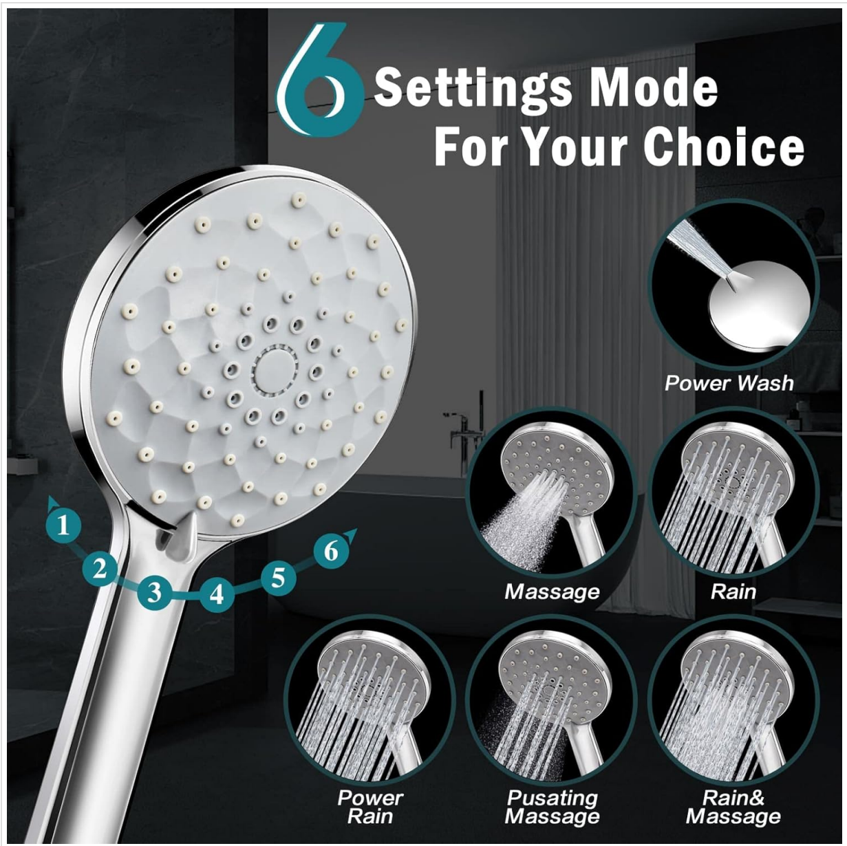
Figure 5: Handheld Shower Head with 6 spray settings