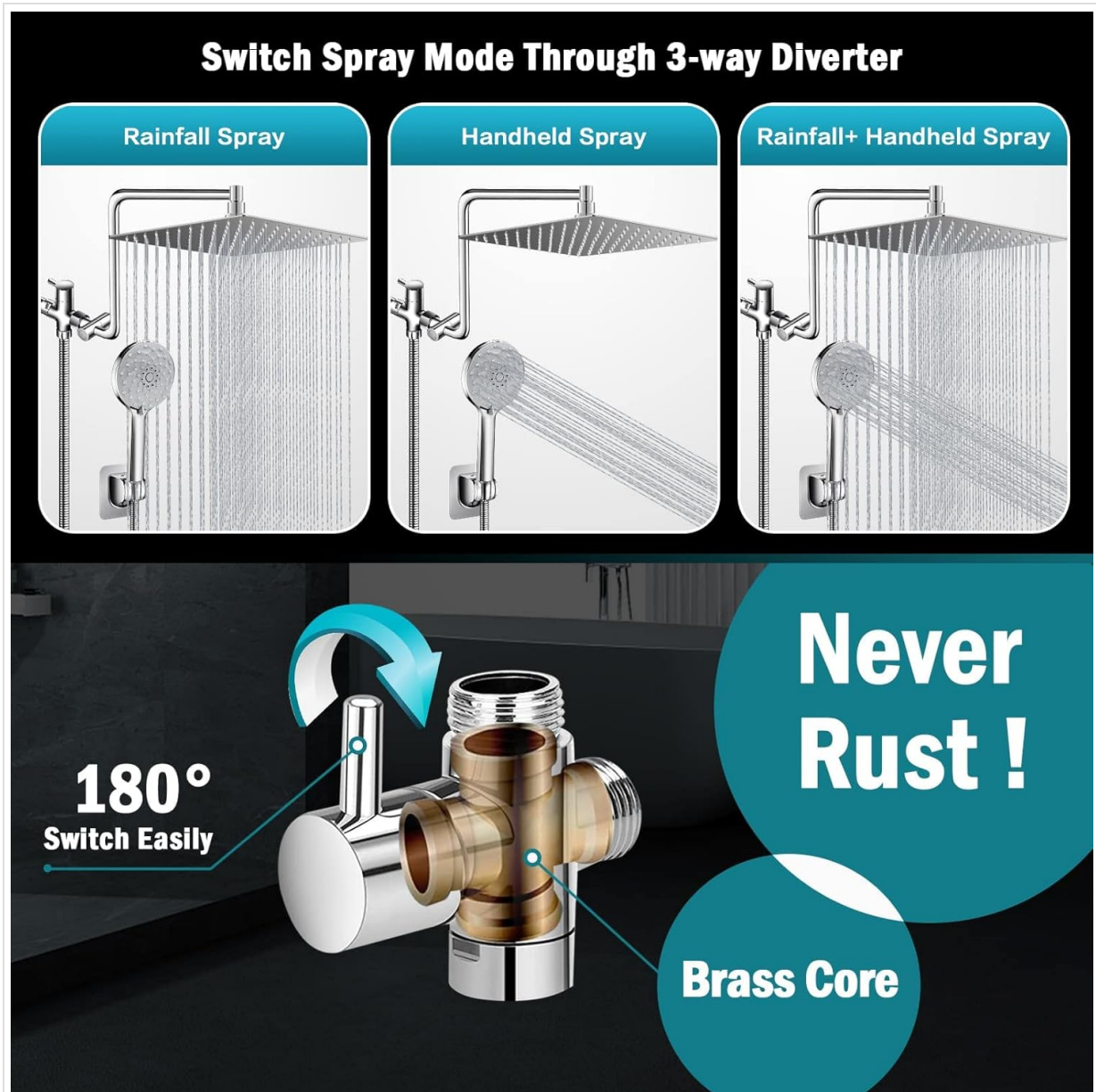
Figure 4: 3-Way Water Diverter for spray mode selection