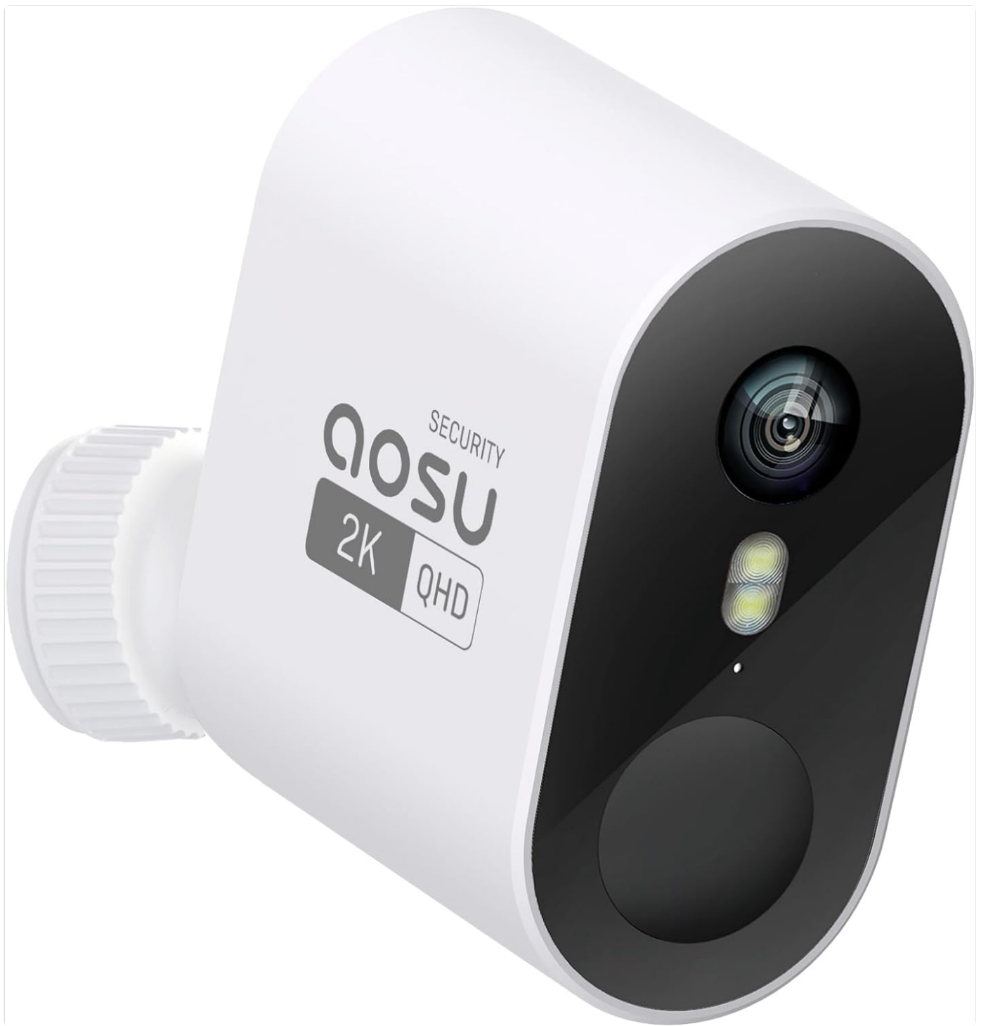
Figure 1: aosu 2K Add-on Camera (Model C6P2AH11)