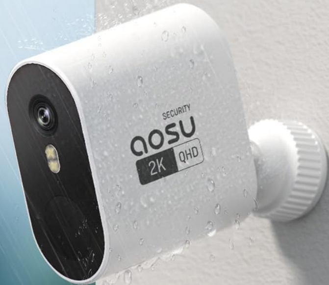
Figure 2: The aosu 2K Add-on Camera mounted on an exterior wall, illustrating its wire-free and battery-powered design.